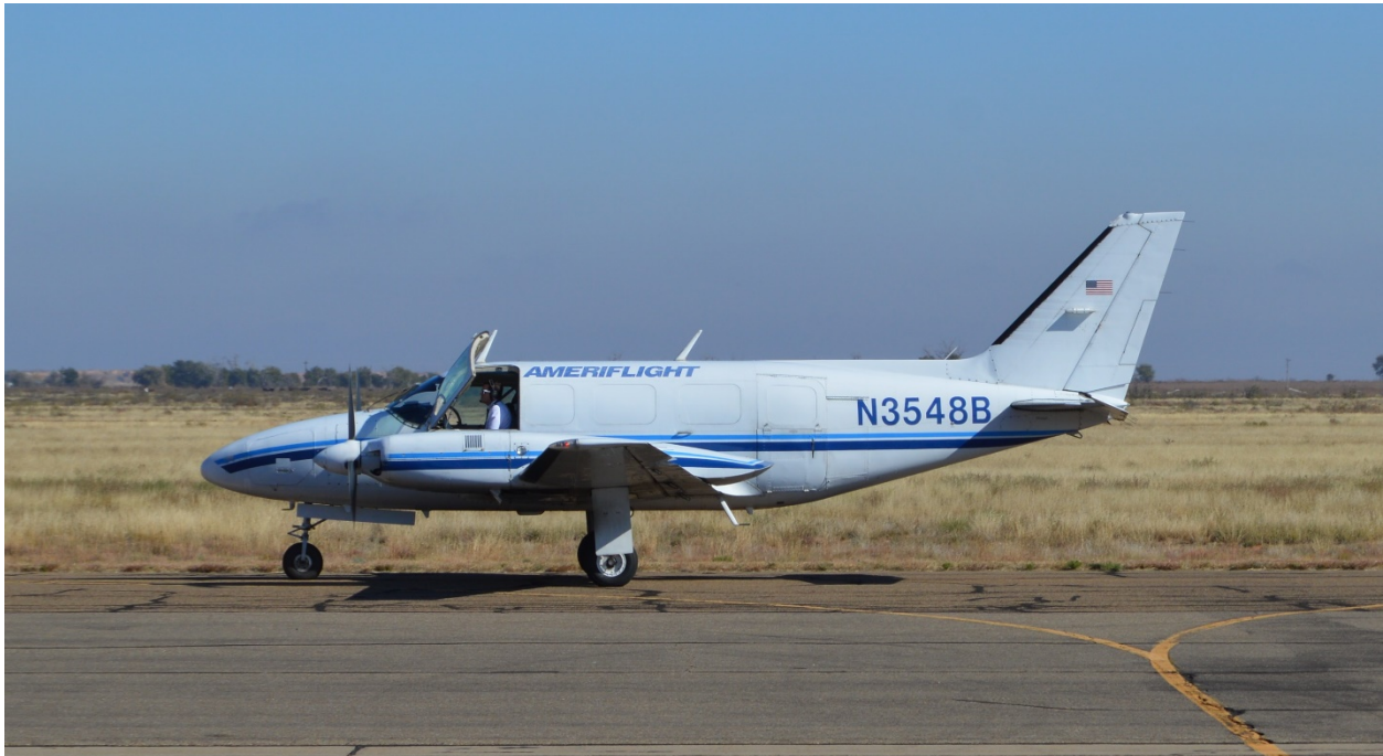
Ameriflight Piper Navajo at the Tucumcari, New Mexico airport.