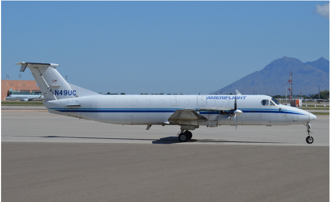
Ameriflight Beechcraft 1900C at the Albuquerque Sunport.