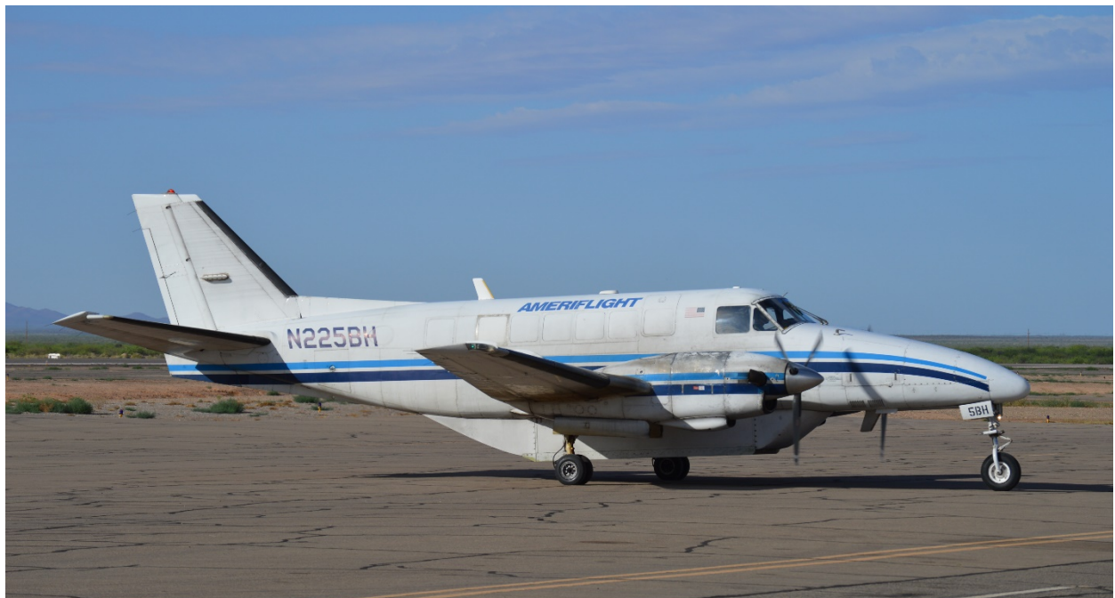
Ameriflight Beechcraft 99 at the Alamogordo/White Sands Regional Airport.