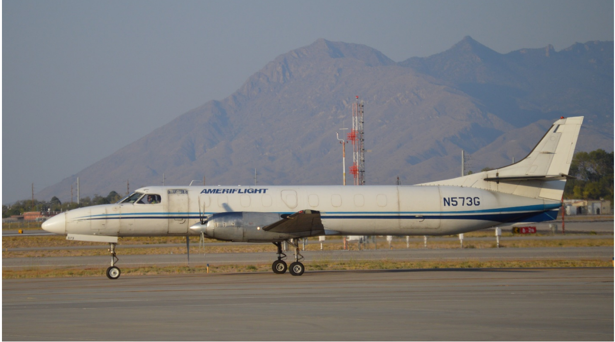
Ameriflight Swearingen Metroliner at the Albuquerque Sunport.