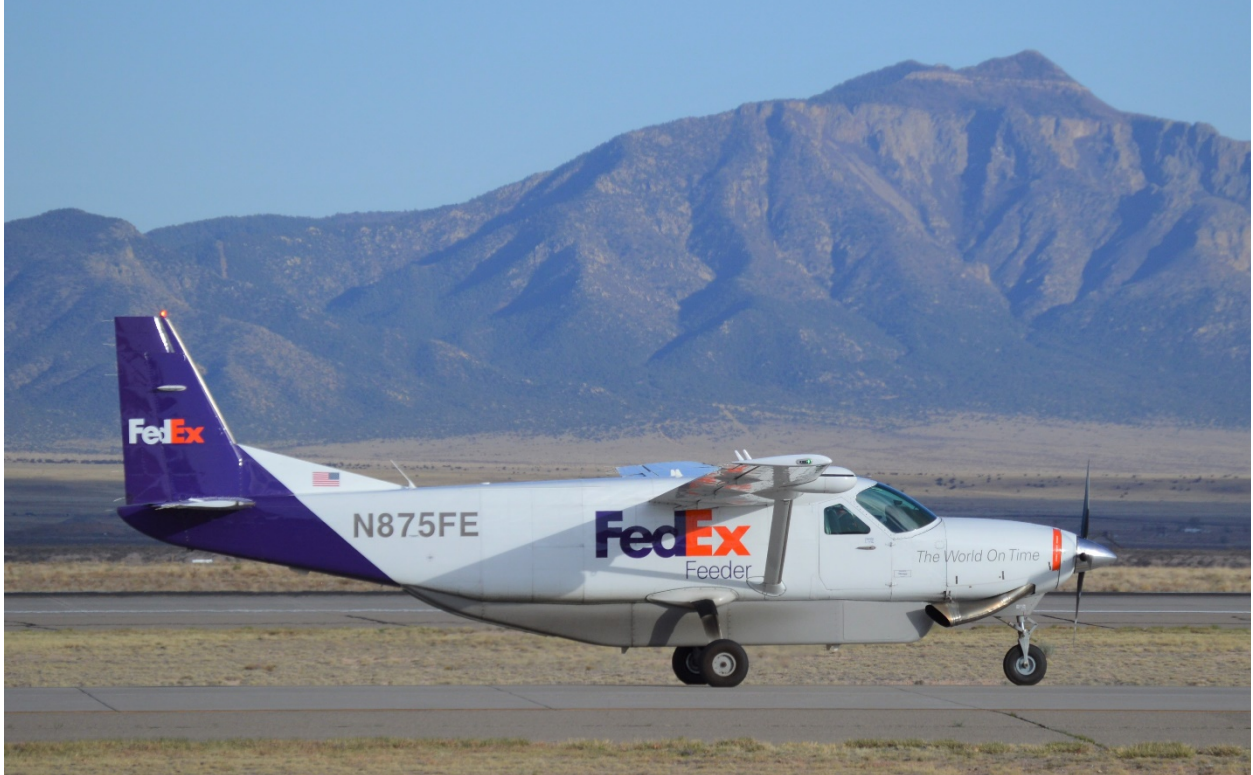
FedEx Feeder Cessna 208B Super Cargomaster operated by Empire Airlines at the Albuquerque Sunport.