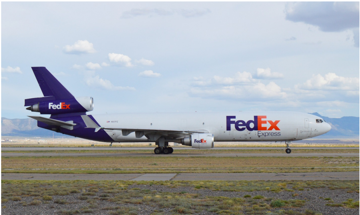
FedEx McDonnell Douglas MD-11 at the Albuquerque Sunport.