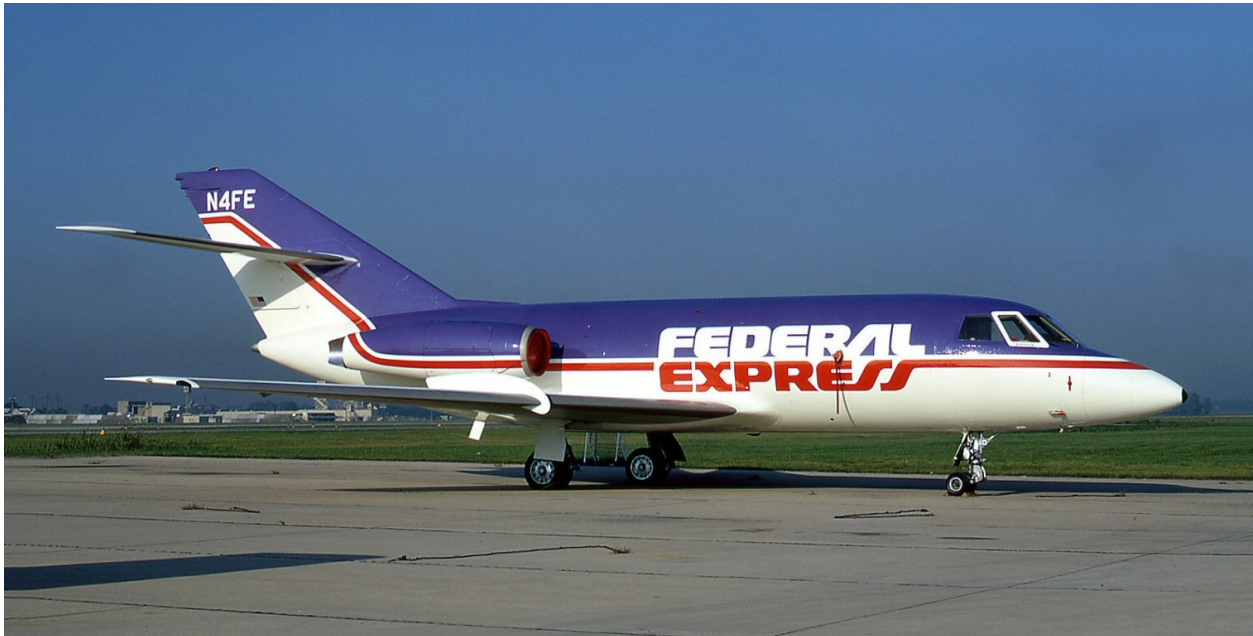
Federal Express original aircraft, the Dassault Falcon 20.