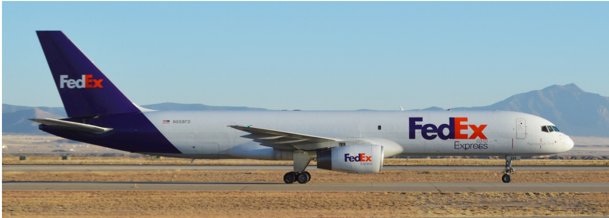
FedEx Boeing 757 at the Albuquerque Sunport displaying the new name and livery in 1994.