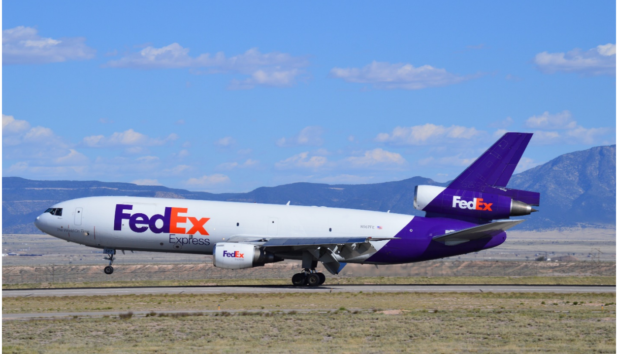
FedEx Douglas DC-10 landing at the Albuquerque Sunport.