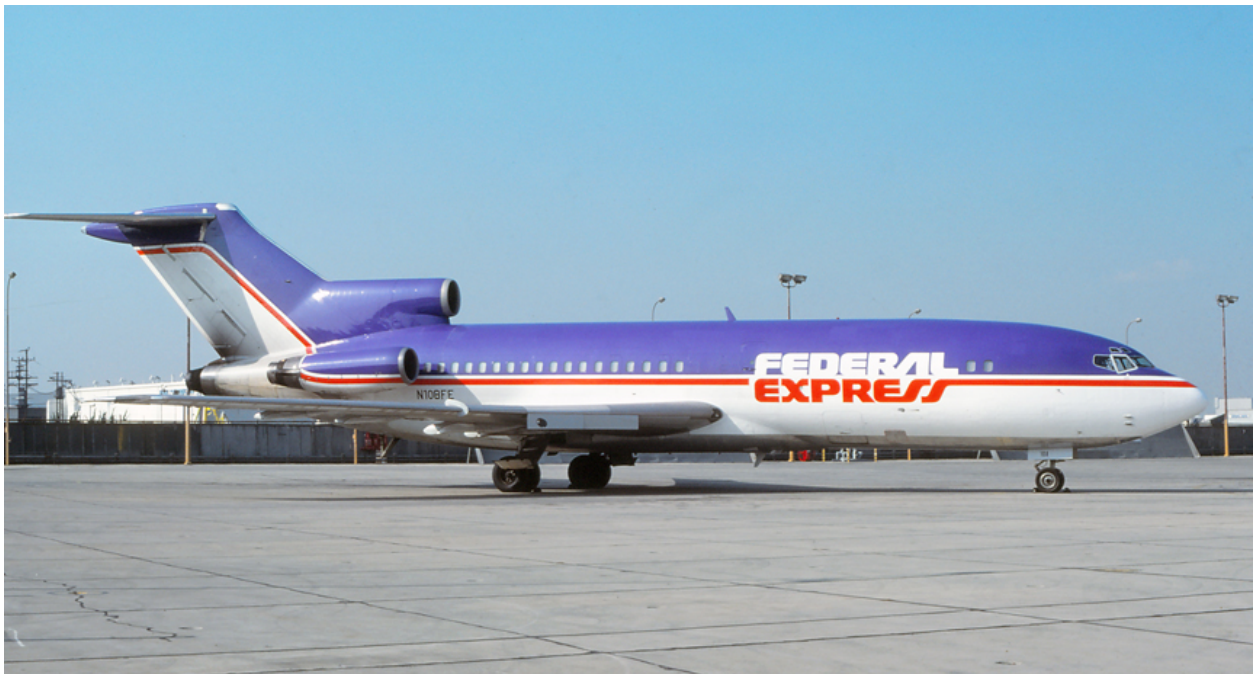
Federal Express Boeing 727-100 used during the 1980's