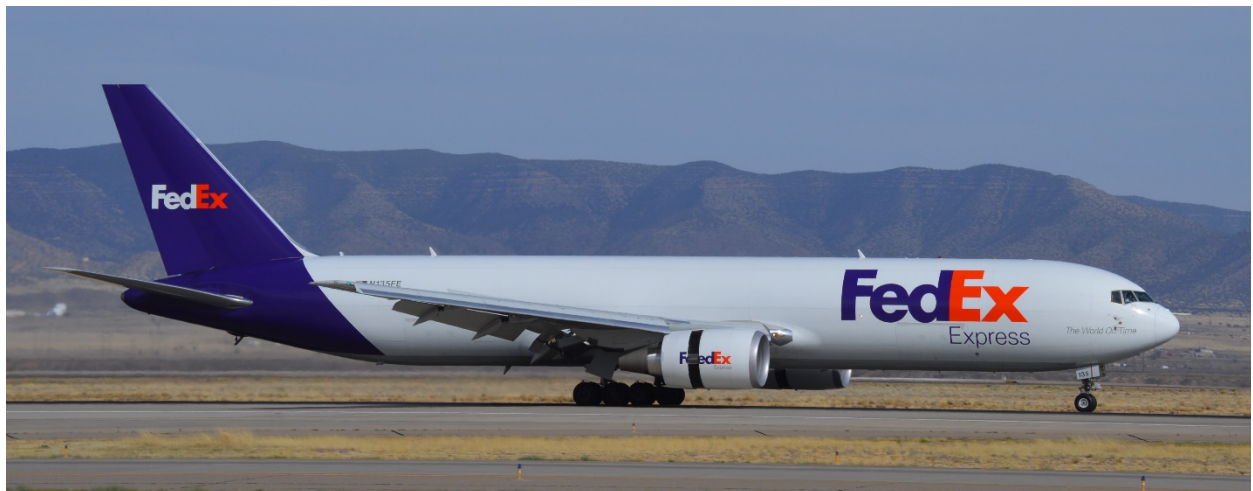
FedEx Boeing 767-300 landing at the Albuquerque Sunport.