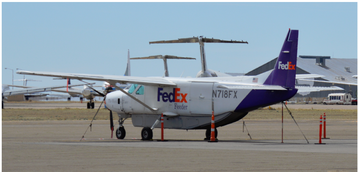
FedEx Feeder Cessna 208B Super Cargomaster operated by Baron Aviation at the Roswell International Air Center prior to discontinuing service in 2022.