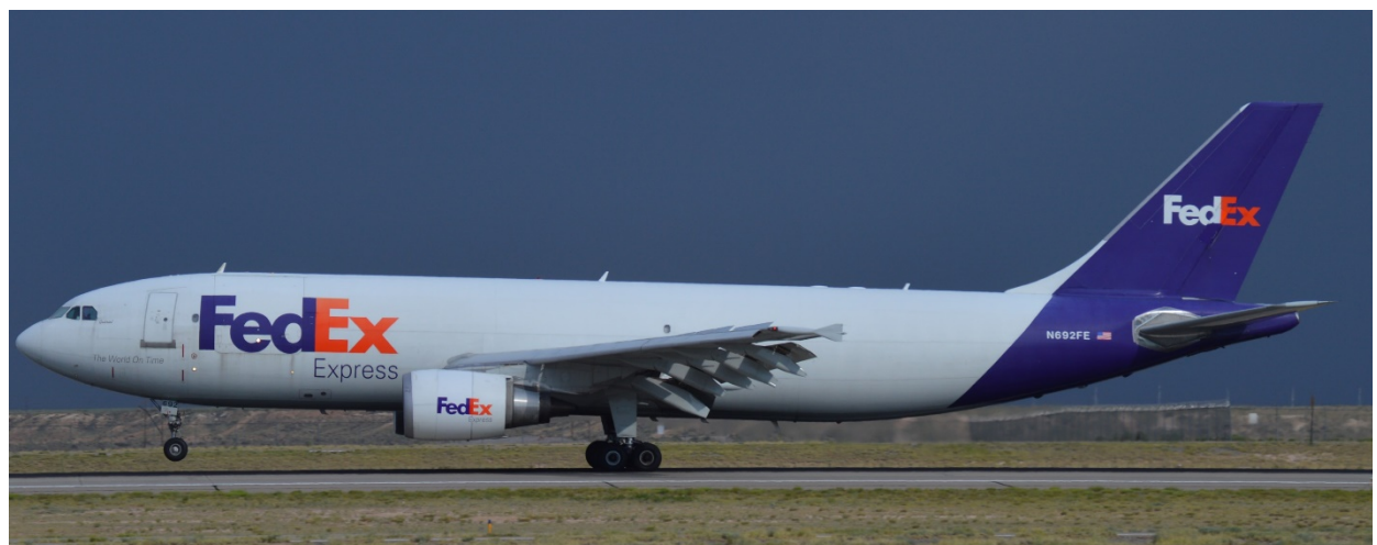
FedEx Airbus A300-600 landing at the Albuquerque Sunport.