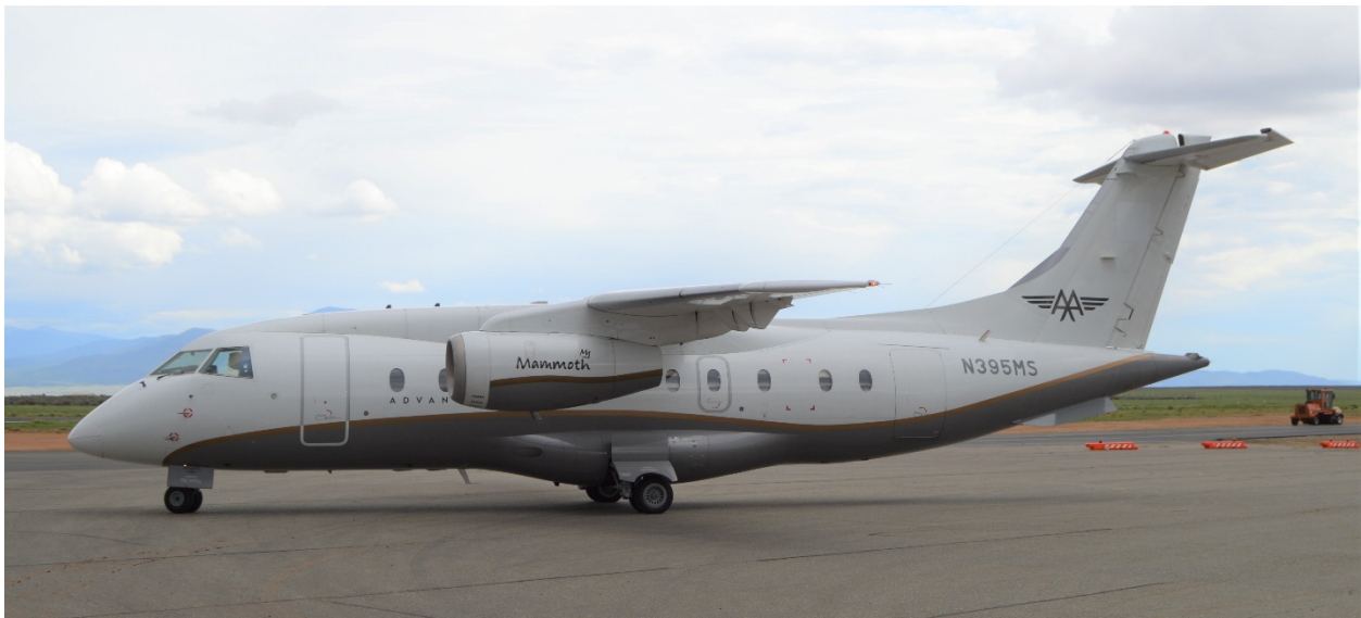
Advanced Air Fairchild Dornier 328Jet at the Taos Regional Airport.

In the fall of 2019, Advanced Air was contracted through the Taos Ski Valley to manage Taos Air, a virtual public charter airline with seasonal service from Taos, New Mexico to Austin and Dallas, Texas as well as to Carlsbad and Hawthorne, California. Taos Air operated two, 30-seat, Fairchild Dornier 328 Regional Jets. When the Taos Air aircraft were unavailable, Advanced Airlines would substitute their own aircraft. This operation ended after the summer 2022 season and was replaced by JSX Air beginning with the winter 2022/2023 ski season. For more information on Taos Air, see the separate column for that carrier under the “Past major and regional airlines” link.