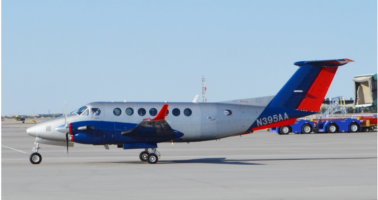
Advanced Air Beechcraft Super King Air 350 at the Albuquerque International Sunport.