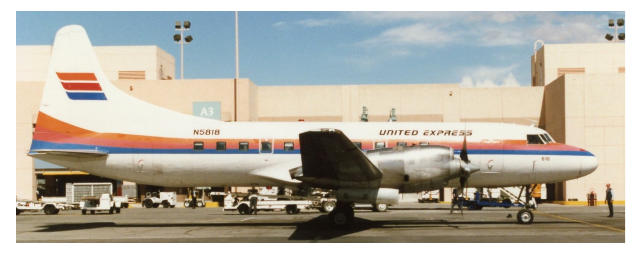
United Express Convair 580 operated by Aspen Airways at Albuquerque.