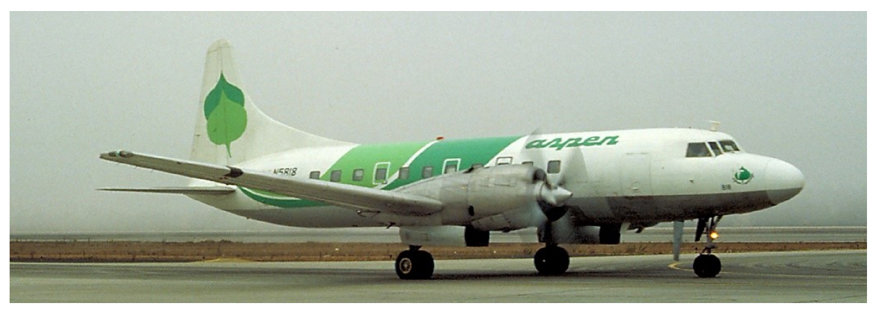
Aspen Airways Convair 580 in a new livery that began in 1985. Other colors were also used including blue, brown and orange.