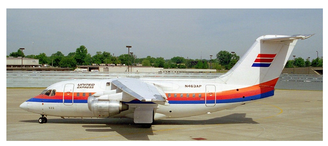
United Express BAe-146 operated by Aspen Airways.