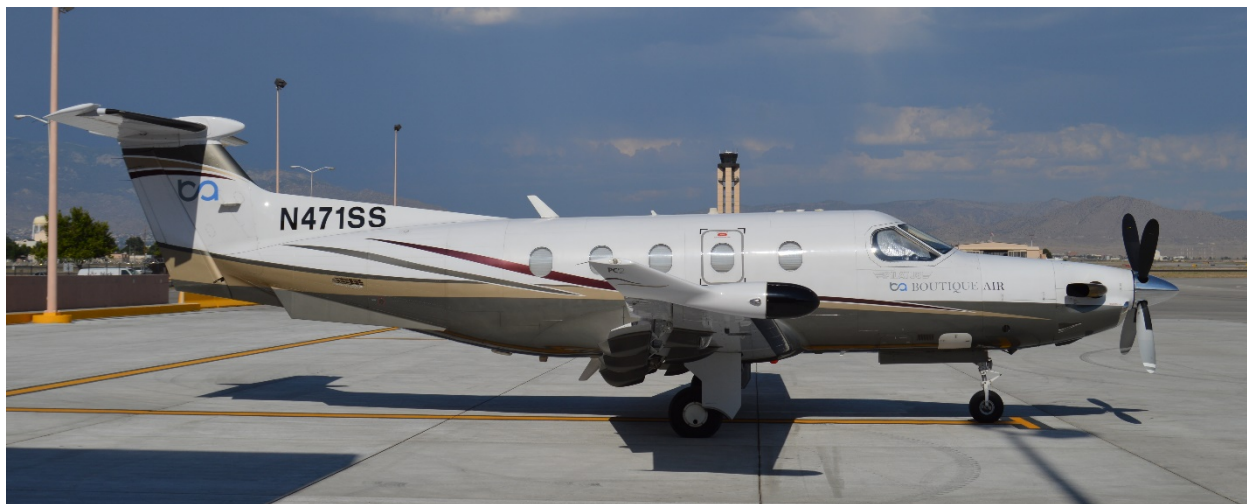
Boutique Air Pilatus PC-12 at the Albuquerque International Sunport commuter gate.