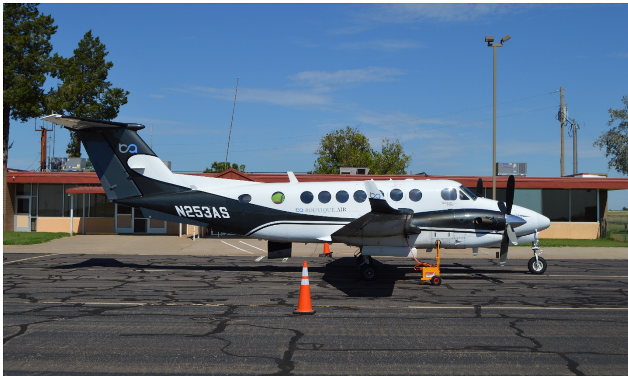
Boutique Air Beechcraft Super King Air 350 at the Clovis Regional Airport terminal.

Service between Clovis and Dallas/Fort Worth was upgraded to a Beechcraft 350 King Air effective August 10, 2018 but often a PC-12 was still used. Boutique began a code-share agreement with United Airlines in 2018 and implemented United code-share flight numbers on the Clovis-DFW flights in early 2019. New service between Clovis and Alamosa was planned to begin on July 1, 2019 however it was later changed to a new route between Clovis and Albuquerque operating three days per week, ending by July 31. Service between Albuquerque and Alamosa also resumed on July 1 but cancelled by July 6 after only four flights.