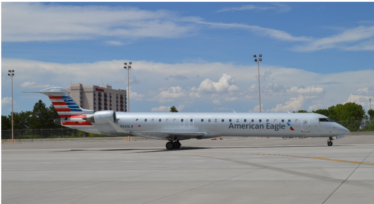
American Eagle Canadair CRJ-900 at Albuquerque, operated by Mesa Airlines and formerly operated as US Airways Express.