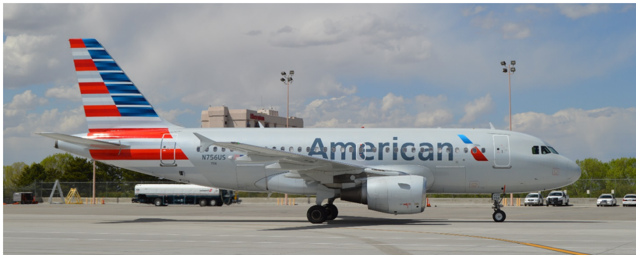
American Airbus A319 at the Albuquerque Sunport, formerly operated by US Airways and now wearing the new livery for American Airlines introduced in 2013.

The Albuquerque International Balloon Fiesta, held during the first week of October of each year, is by far the largest annual event in the city attracting hundreds of thousands of visitors. Beginning In 2017, American adds extra flights and upgrades many of its American mainline and American Eagle flights at Albuquerque with larger jets during this event.