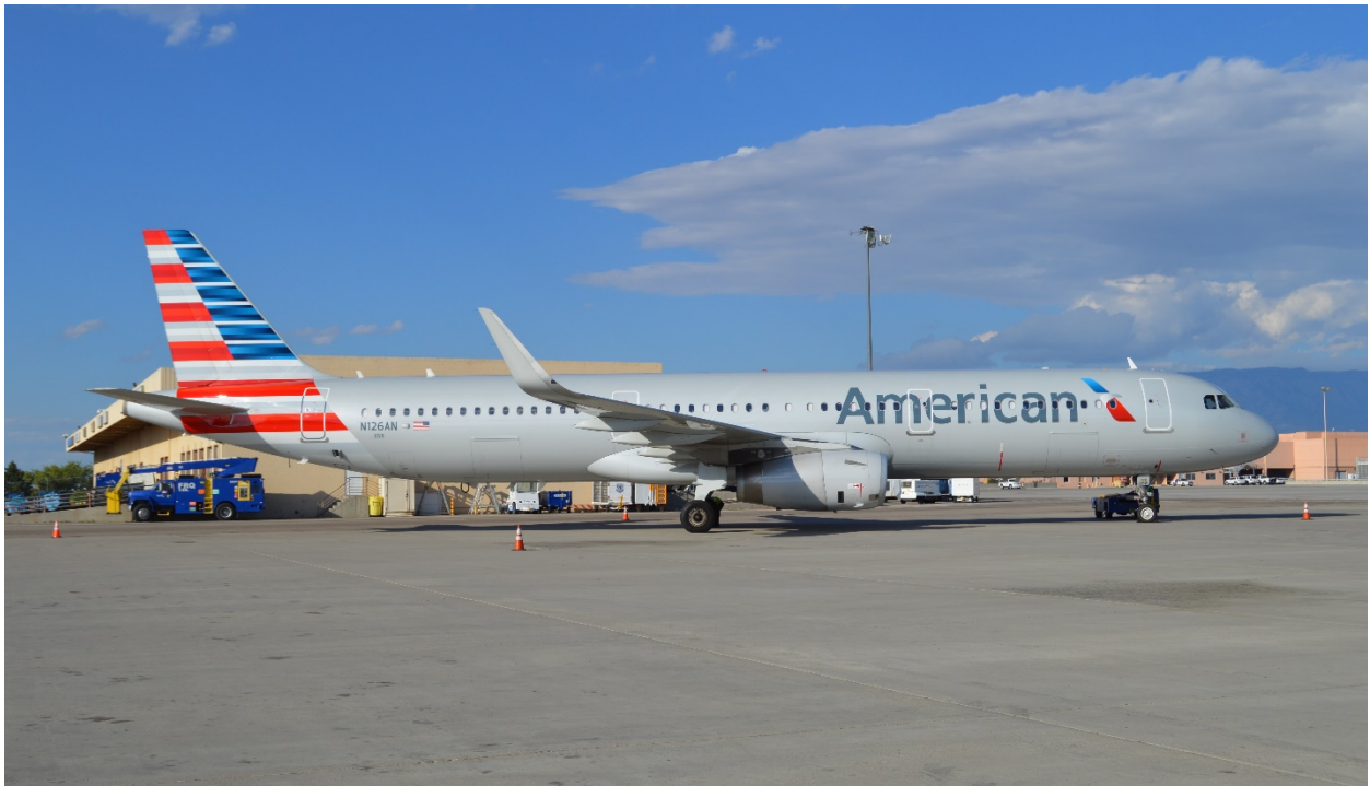
American Airbus A321 at Albuquerque. The A321 was seen at Albuquerque on several isolated occasions in the late 2010's and began regular service to the Sunport in November, 2021.