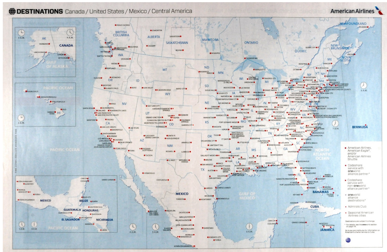
American Airlines and American Eagle destination map of North America in 2015 showing all of the new cities served with the merger of US Airways.

The year 2020 arrived with the COVID-19 virus causing a pandemic that nearly shut down all air travel by seeing a drop in traffic of more than 95 percent by April of that year. Most airline flights at Albuquerque cancelled from late March through April due to very low passenger loads, some flights having no passengers at all. The May schedule for Albuquerque was planned to have 19 daily flights and introduce the larger Airbus A321 but instead a greatly reduced schedule was implemented with only seven flights per day, all using American Eagle regional jets. Service to Chicago and Phoenix was dropped to only one flight per day each while all flights to Los Angeles were discontinued. As traffic improved slightly for the summer months, some American mainline jets returned on the Albuquerque to DFW route by July, 2020. Traffic dropped off again by winter 2020/2021 and all mainline jets were again discontinued from January through May of 2021 except for one flight to DFW during the month of March. Some normalcy resumed on June 3, 2021 when seven mainline jets returned to the Albuquerque schedule including one each to Chicago and Phoenix. A total of 17 flights were operating including the reinstatement of three Eagle flights to Los Angeles. Airbus A321 aircraft finally began appearing on flights to DFW by November, 2021 and in March, 2022, five of the six DFW flights were operated with Airbus A321's. New American Eagle service to Austin, Texas began in January, 2022.