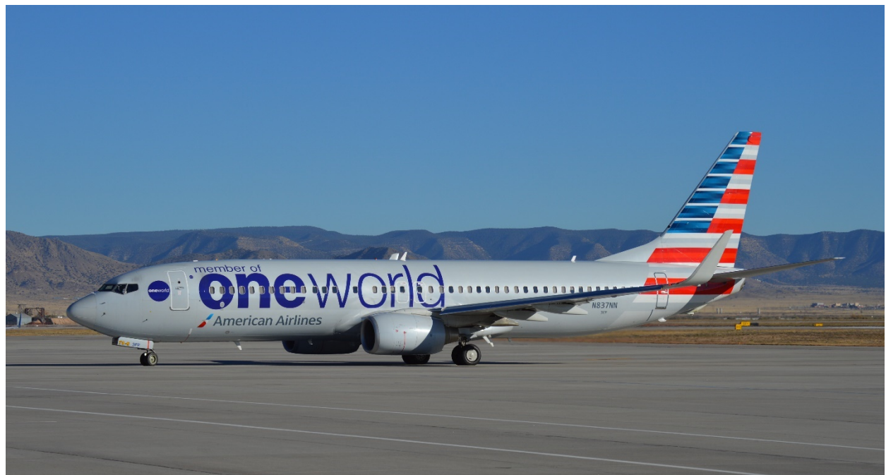
American Boeing 737-800 in the OneWorld Alliance paint scheme at the Albuquerque Sunport.