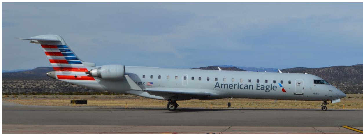
American Eagle Canadair CRJ-700, operated by SkyWest, at the Santa Fe Regional Airport.