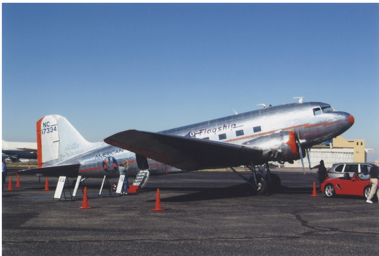
American's vintage Douglas DC-3, "Flagship Detroit", visited Albuquerque and Santa Fe in October, 2007.

American is the second busiest carrier at Albuquerque behind Southwest Airlines and, as of early 2023, has provided 44 years of service with as many as 20 flights per day to the Albuquerque Sunport. American has also adopted a US Airways tradition of painting one aircraft in one of the color schemes of a carrier that each had merged with in the past. US Airways has Airbus A319's in the colors of America West and PSA while American has now painted two Boeing 737-800's in the colors of TWA and Reno Air. (There are also aircraft in the colors of several other carriers that did not serve New Mexico). A former US Airways Airbus A321 retains the colors of that carrier. Other specialty paint schemes American has applied to its aircraft include a 1960's American retro livery and a OneWorld livery as American belongs to the OneWorld Alliance of carriers from around the world that work together to provide world-wide service.