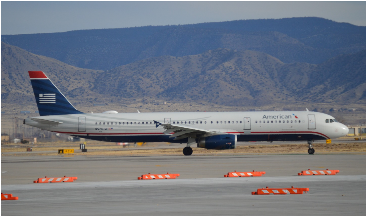
American Airbus A321 in the colors of the former US Airways at the Albuquerque Sunport.