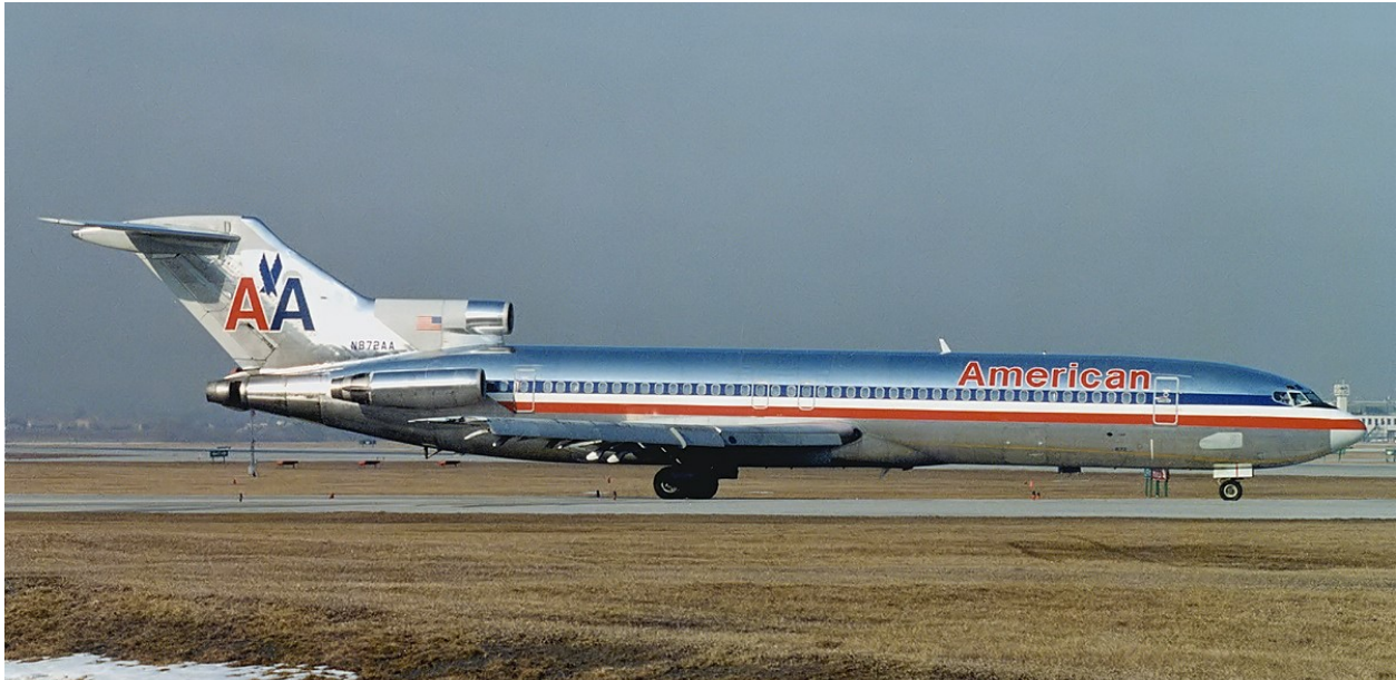
American Boeing 727-200. This aircraft and the shorter 727-100 flew the initial service to Albuquerque in 1979 and continued to serve the city until 1993.