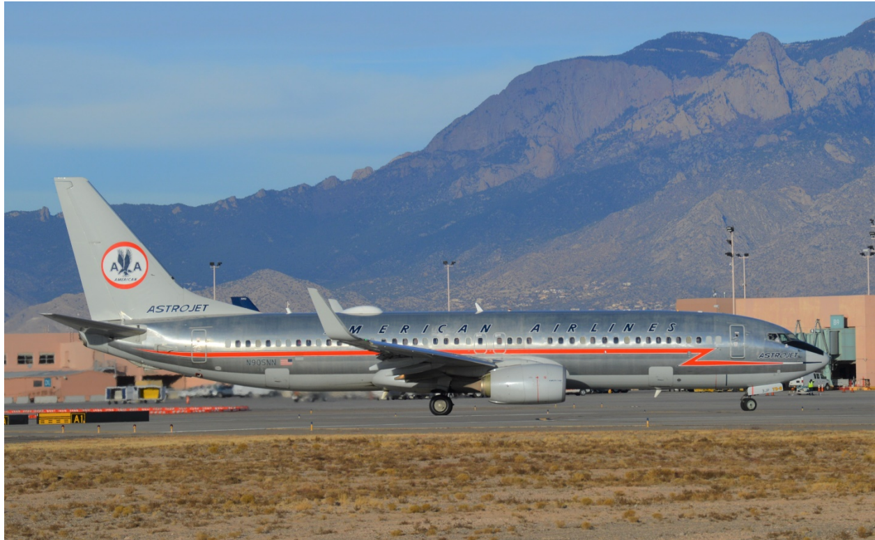
American Boeing 737-800 “AstroJet” in a retro paint scheme from the 1960’s at the Albuquerque Sunport.