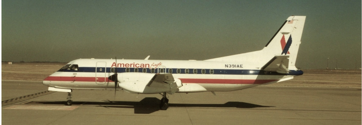
American Eagle Saab-340B, operated by Wings West, served Farmington in 1994 and 1995.