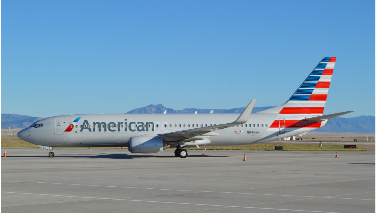
American Boeing 737-800 at Albuquerque was introduced to the city in 2015.