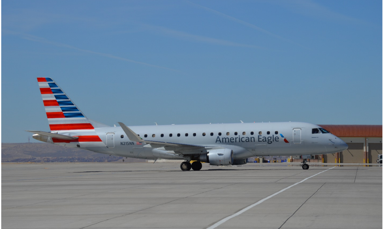
American Eagle Embraer-175 operated by Envoy Air at Albuquerque.