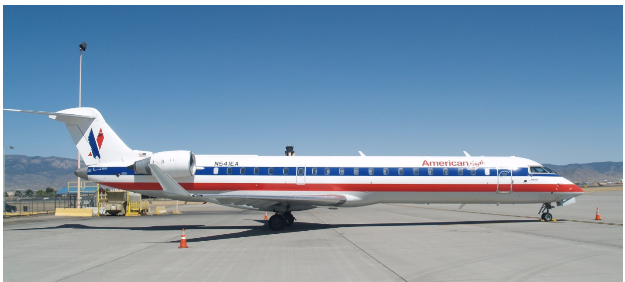
American Eagle Canadair CRJ-700 at the Albuquerque Sunport.