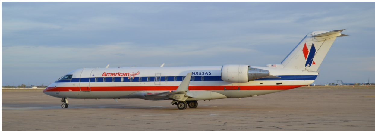
American Eagle Canadair CRJ-200, operated by SkyWest, at the Roswell International Air Center.