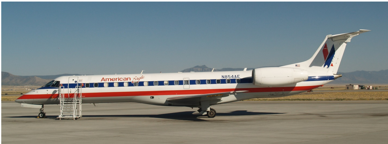
American Eagle Embraer-140 at the Albuquerque Sunport.

American merged with Trans World Airlines (TWA) on December 2, 2001 and four flights per day from Albuquerque to TWA's hub at St. Louis were added with the MD-80. The merger happened right after the events of September 11 that year which created much hardship for American leading to the St. Louis hub being downsized and the ending of the Albuquerque-St. Louis flights by 2003. American Eagle, a consortium of smaller regional airlines operating on behalf of American Airlines, began flights from Albuquerque to Los Angeles and DFW in early 2002 but the flights were discontinued later that same year. In 2008 the Chicago flights began to be replaced by the smaller American Eagle regional jets and Eagle service to Los Angeles returned in 2011. Service to Los Angeles was operated with 44-seat Embraer-140 regional jets and the Chicago flights were operated by 65-seat Canadair CRJ-700 jets.