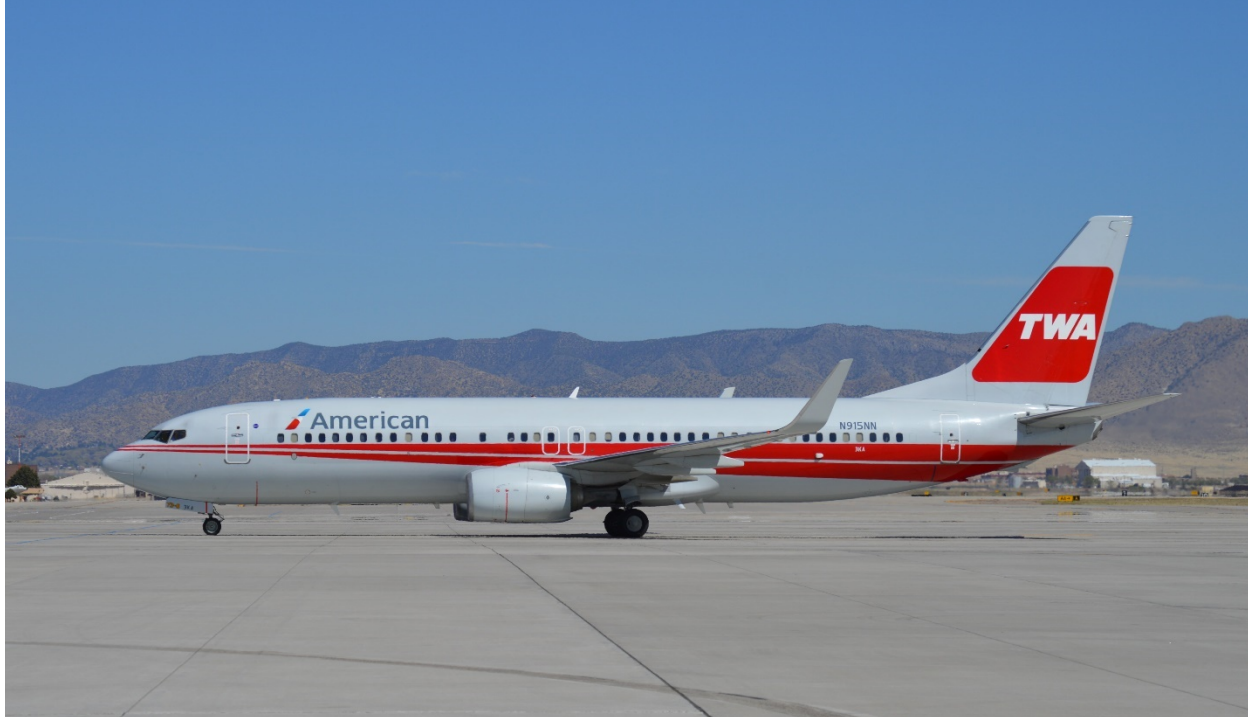
American Boeing 737-800 in the colors of TWA at the Albuquerque Sunport.