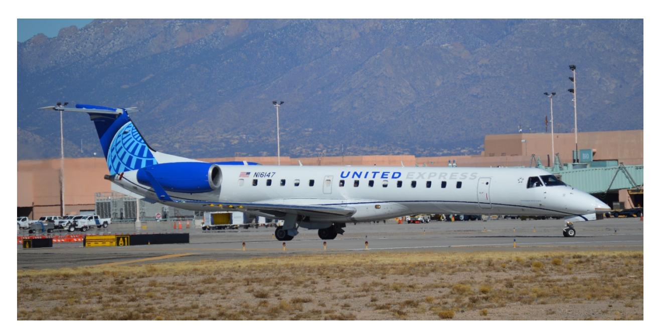
United Express Embraer-145 operated by CommuteAir at the Albuquerque International Sunport.

CommuteAir began operations in 1989 as Champlain Air Enterprises and was based in Plattsburgh, New York. Originally the carrier was a feeder line for USAir operating as USAir Express. By 2000 the carrier was known as CommutAir and changed to become a feeder for Continental Airlines as Continental Connection. Its headquarters were moved to North Olmstead, Ohio near the Cleveland Hopkins Airport. In 2012 they became a United Express feeder carrier after the merger of Continental and United Airlines. CommutAir primarily operated in the Northeast United States but migrated westward in 2020 after ExpressJet, another United Express carrier, was shut down. CommutAir then began operations at United's Houston hub and started service to Albuquerque on December 17, 2020 with flights to Houston. On March 28, 2021 CommutAir began another hub operation at United's Denver hub at which time service from Denver to Albuquerque and Santa Fe was added however the Denver to Albuquerque service ended on March 26, 2022. On June 3, 2022, CommutAir took over all United Express service at Hobbs, replacing SkyWest Airlines. Service ended on the Albuquerque to Houston route on February 10, 2023 leaving only flights from Santa Fe to Denver, Hobbs to Denver, and Hobbs to Houston. The company added an "e" to its name on July 26, 2022 at which time they became CommuteAir. The carrier now only operates Embraer-145 regional jets for United Express.