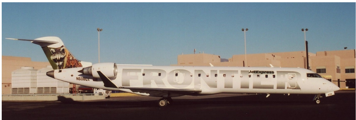
Frontier JetExpress Canadair CRJ-700 featuring a raccoon motif at the Albuquerque Sunport.