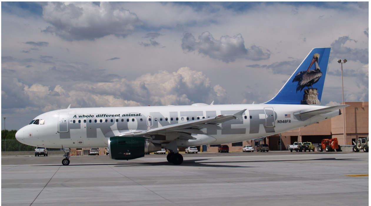
Frontier Airbus A319 featuring "Pete" the pelican and wearing a new billboard livery introduced in 2001 at the Albuquerque Sunport.