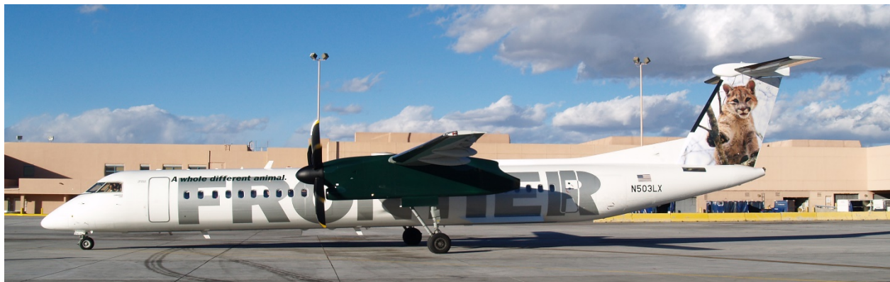
Frontier DeHavilland Dash-8-Q400 featuring a mountain lion motif at the Albuquerque Sunport.