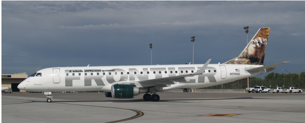
Frontier Embraer 190 featuring “Buddy” the badger at the Albuquerque Sunport.