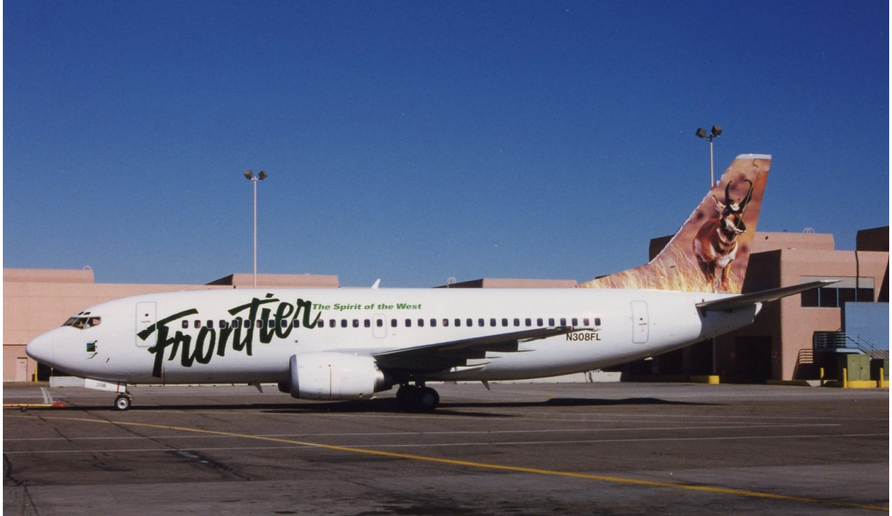
Frontier Boeing 737-300 featuring a pronghorn antelope at the Albuquerque Sunport.