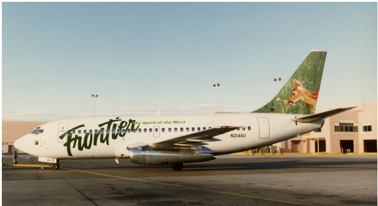
Frontier Boeing 737-200 featuring "Clover" the fawn at the Albuquerque Sunport.

A new Frontier Airlines evolved in 1994 which was molded much like the former Frontier using Boeing 737-200 jets and with its headquarters and hub city at Denver, Colorado. The aircraft however carry a new wildlife theme with decals of animals, birds, and reptiles on the tails of each plane. The first fleet of Boeing 737 aircraft carried different wildlife on each side of the tail. This Frontier began service to Albuquerque on October 13, 1994 with flights to Denver and El Paso. Newer and more modern 737-300 aircraft were added in 1995 and the carrier completely changed over to Airbus family jets beginning in 2001 operating the A318, A319, and A320 versions. The El Paso flights were discontinued in 2004.