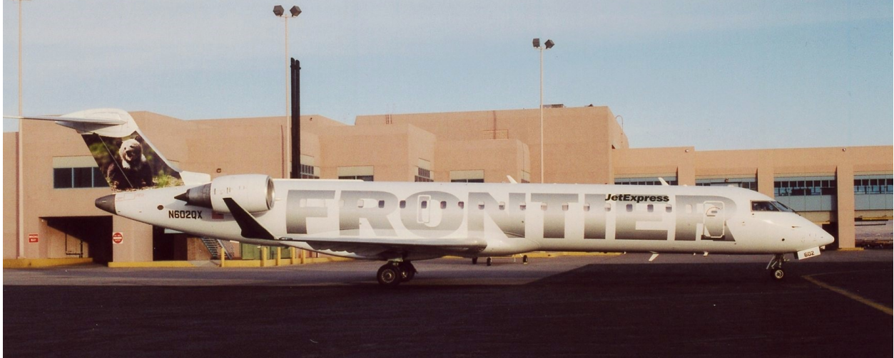
Horizon Air Canadair CRJ-700 in the Frontier Jet Express livery at Albuquerque.