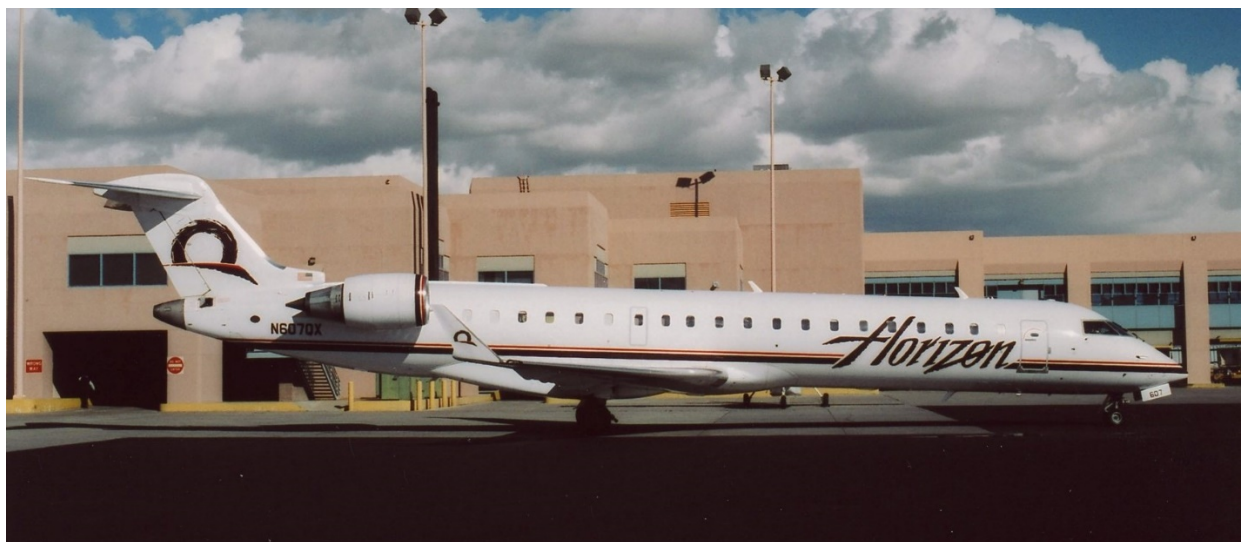
Horizon Air Canadair CRJ-700 at Albuquerque in the carriers' house livery.

Horizon Air was established in 1981 at Seattle/Tacoma, Washington operating routes within the state of Washington. In 1983 Horizon merged with Trans Western Airlines, a commuter airline based in Utah that served Albuquerque and Santa Fe from Denver for a short time in the late 1970's. Horizon was purchased by Alaska Air Group in 1986 and became the primary feeder carrier for Alaska Airlines. In 2004 Horizon began a new feeder contract with Frontier Airlines operating as Frontier Jet Express and initiated service from Albuquerque to Denver on January 5, 2004 using 70 seat Canadair CRJ-700 regional jets. Most aircraft were painted in the standard Frontier Airlines paint scheme with a wildlife emblem on the tail however at times aircraft would serve Albuquerque in the Horizon Air paint scheme. This service continued for nearly four years, ending on November 22, 2007. Frontier had then switched its feeder contract flying to Republic and Lynx Airlines while Horizon returned to flying exclusively for Alaska Airlines.