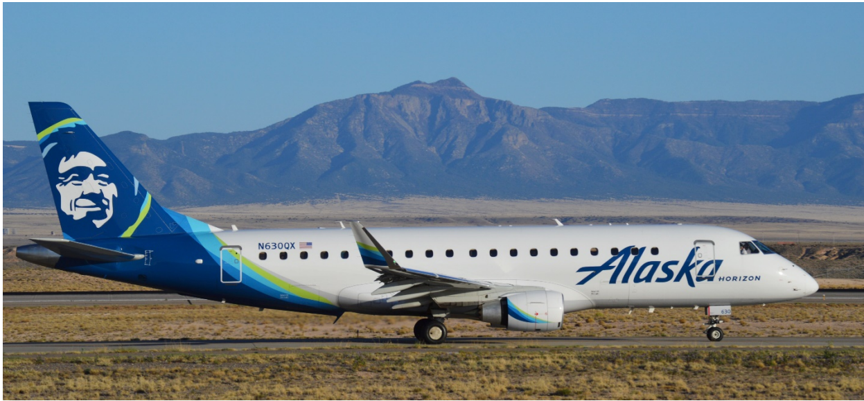
Horizon Air Embraer 175 at Albuquerque operating as Alaska Horizon.