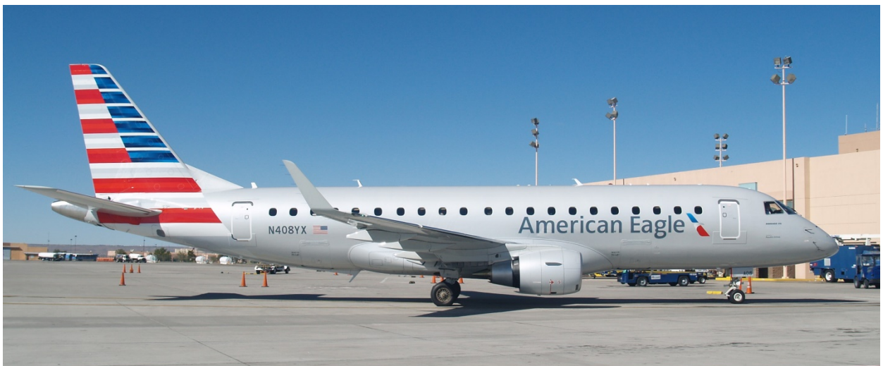
Republic Embraer 175 operated for American Eagle at Albuquerque in 2013.

On August 1, 2013 Republic began another new operation as American Eagle on behalf of American Airlines. New Embraer 175 regional jets are used and flights from Chicago to Albuquerque began on Republic's inaugural day of American Eagle service. Republic replaced American Eagle Airlines (now called Envoy Airlines) on the route but it was switched back to Envoy a year later. Republic and Envoy shifted back and forth several times and also had times where both carriers provided flights on the Albuquerque-Chicago route. Republic's service as American Eagle in Albuquerque was discontinued on April 4, 2016 but returned from April 2 through November 30, 2021, as Republic Airways, again operating to Chicago along with Envoy.