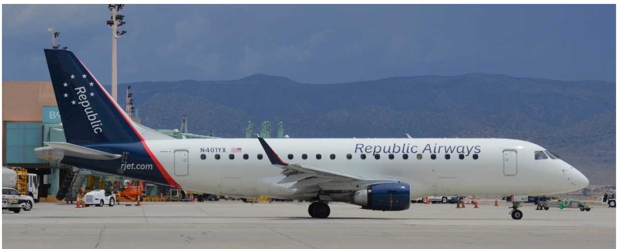
Republic Airways Embraer 175 at Albuquerque in 2021 displaying a new image that began in 2018.