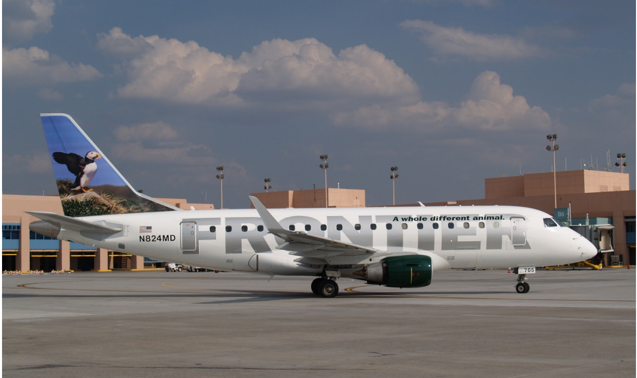
Republic Embraer 170 operated for Frontier Airlines at Albuquerque in 2007.