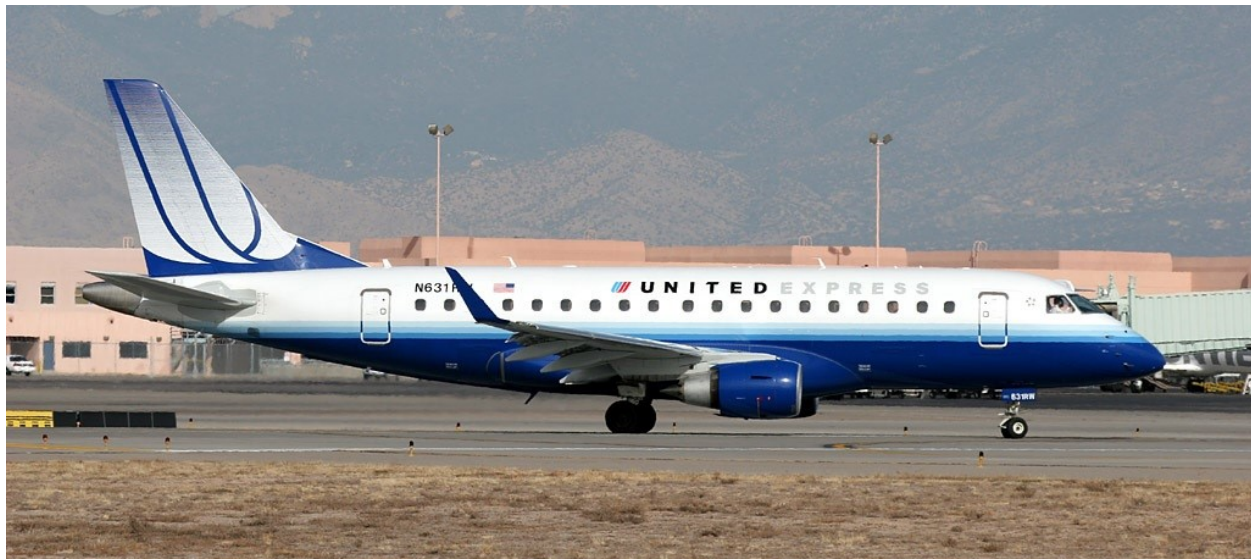
United Express Embraer 170 operated by Chautauqua Airlines at Albuquerque in 2005.

Chautauqua Airlines was founded as a commuter airline in 1973 in Jamestown, New York. The carrier was one of the first airlines to code-share with a major airline when it became an Allegheny Commuter on behalf of Allegheny Airlines in the 1970's. Allegheny became US Air in 1979 and later US Airways in which Chautauqua became a US Airways Express operator. Chautauqua was acquired by Republic Airways Holdings in 1998 and began code-sharing alliances with several other major airlines including a United Express operation on behalf of United Airlines. Chautauqua began serving Albuquerque on January 6, 2005 with United Express flights to Chicago using 70-seat Embraer 170 regional jets. However it was deemed that Chautauqua had violated a pilot scope clause through a code-share agreement they had with another major airline by operating aircraft with more than 50 seats. To resolve the issue, the Embraer 170 jets were transferred to Shuttle America, another subsidiary under Republic Holdings and United Express operator. Service to Albuquerque ended in fall, 2005 and was resumed by Shuttle America using the same aircraft.