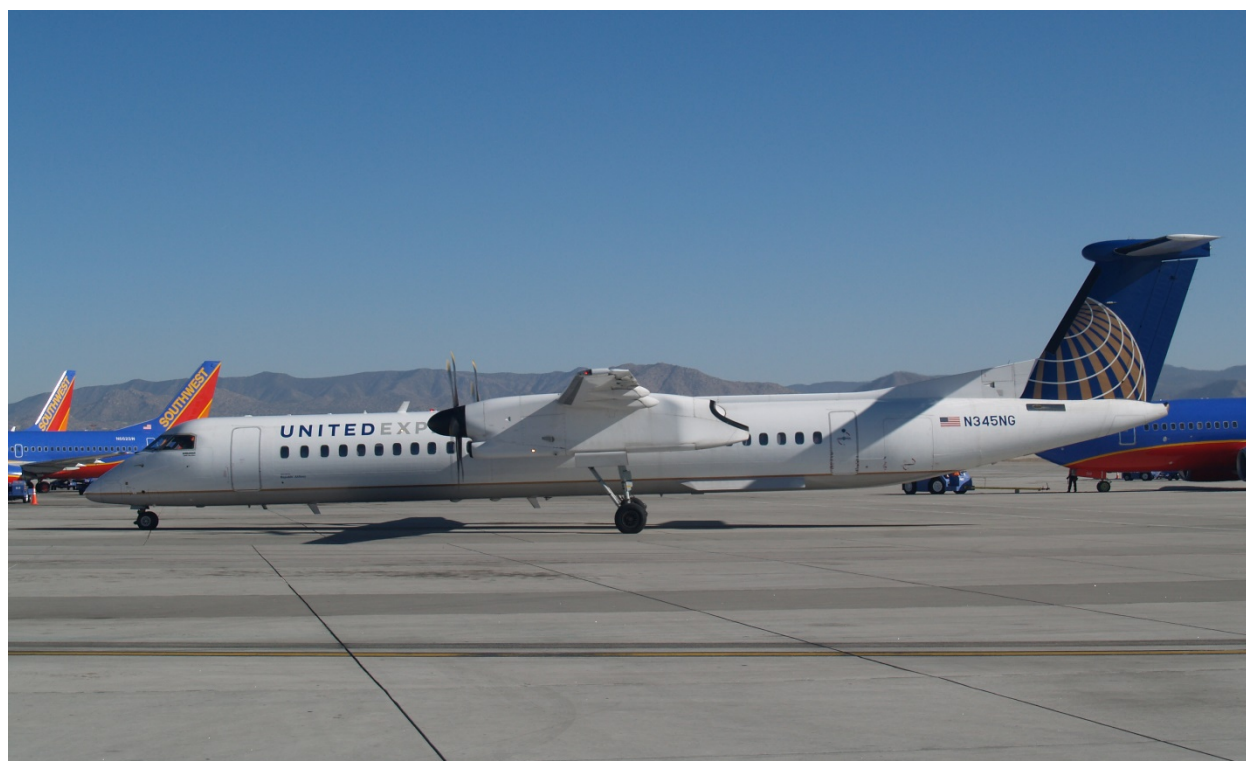
Republic De Havilland Dash-8-Q400 operated for United Express at Albuquerque in 2012. Republic Airlines was renamed to Republic Airways in 2018.

In 2012, Republic acquired a fleet of 74-seat Bombardier De Havilland Dash-8-Q400 turbo props and began a new operation as United Express on behalf of United Airlines with flights from Albuquerque to Denver that started October 3, 2012. The Republic flights to Albuquerque did not operate consistently as they are used to supplement several other United Express carriers as well as United Airlines mainline flights on the Denver route. As the Dash-8-Q400's were retired in 2016, United Express service to Albuquerque ended on February 9 of that year but resumed on June 9, 2016 with flights to Houston using Embraer 170's replacing Shuttle America which was also a subsidiary of Republic Airways Holdings. Since then, flights to Denver and Chicago resumed and new 76-seat Embraer-175 aircraft have been introduced. The flights to Denver were dropped at the beginning of 2020 and the remaining flight to Chicago periodically alternates with SkyWest and United mainline jets. Embraer-170 and -175 regional jets are still used and all service to Albuquerque last operated on March 3, 2022.