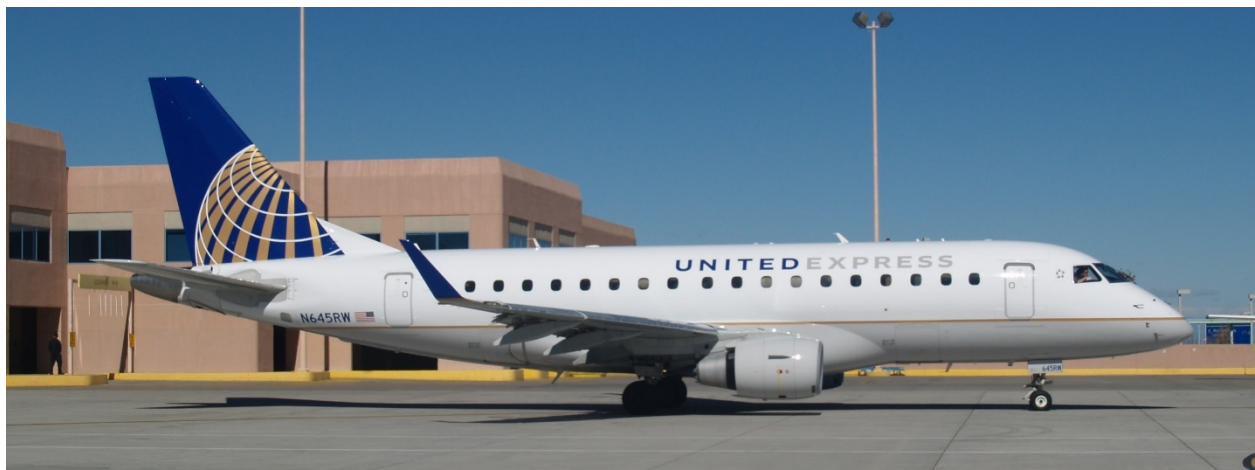
United Express Embraer 170 operated by Shuttle America at Albuquerque in 2013.

Shuttle America also operated as Delta Connection on behalf of Delta Air Lines using Embraer 170 and 175 regional jets. Delta Connection service from Salt Lake City to Albuquerque was planned to begin in April, 2016 but did not materialize.