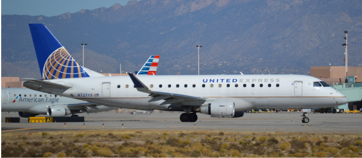
Republic Embraer 175 operated for United Express at Albuquerque in 2019.

On August 1, 2013 Republic began another new operation as American Eagle on behalf of American Airlines. New Embraer 175 regional jets are used and flights from Chicago to Albuquerque began on Republic's inaugural day of American Eagle service. Republic replaced American Eagle Airlines (now called Envoy Airlines) on the route but it was switched back to Envoy a year later. Republic and Envoy shifted back and forth several times and also had times where both carriers provided flights on the Albuquerque-Chicago route. Republic's service as American Eagle in Albuquerque was discontinued on April 4, 2016 but returned from April 2 through November 30, 2021, as Republic Airways, again operating to Chicago along with Envoy.