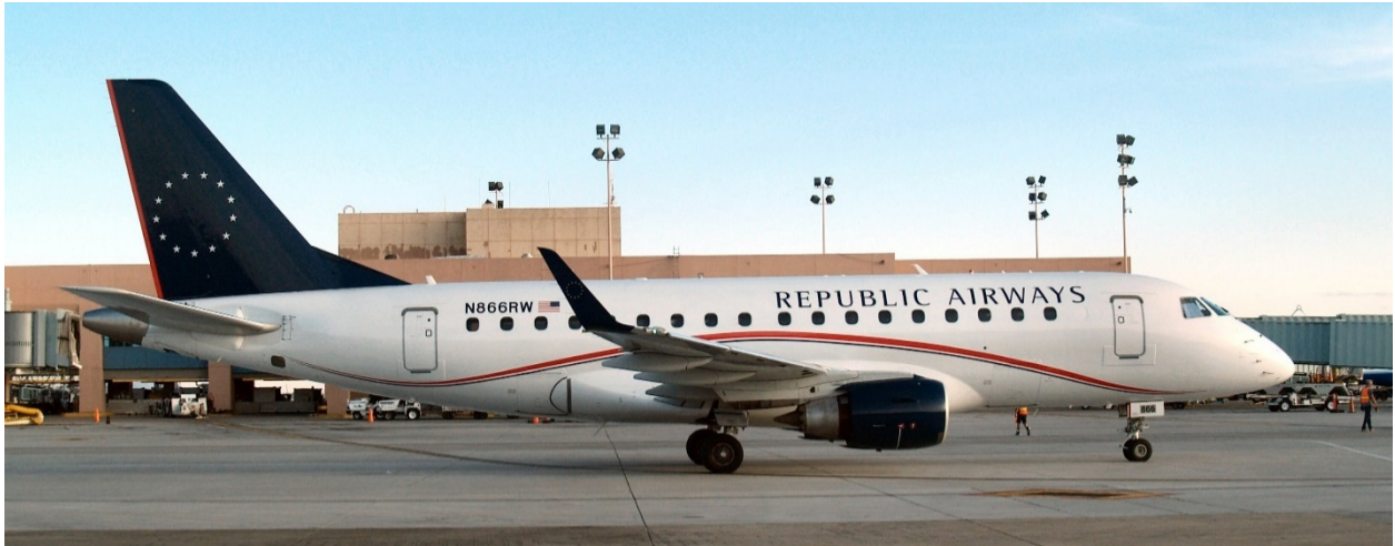
Republic Airways Embraer 170 at Albuquerque in 2007.