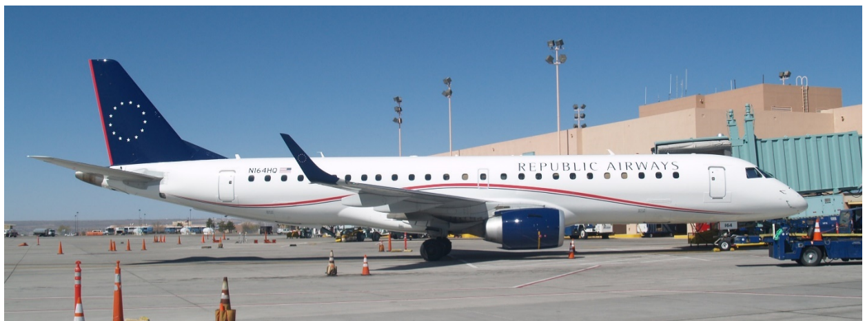
Republic Airways Embraer 190 at Albuquerque in 2014.