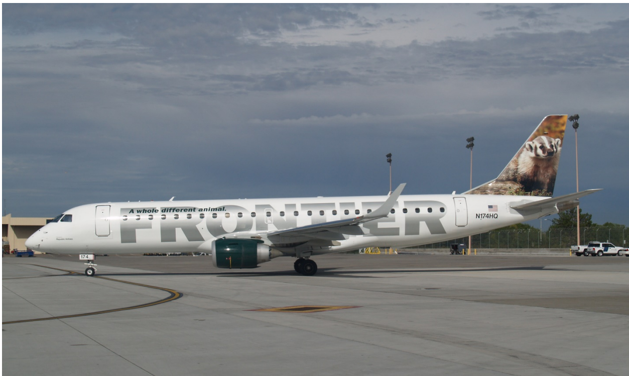
Republic Embraer 190 operated for Frontier Airlines at Albuquerque in 2010.