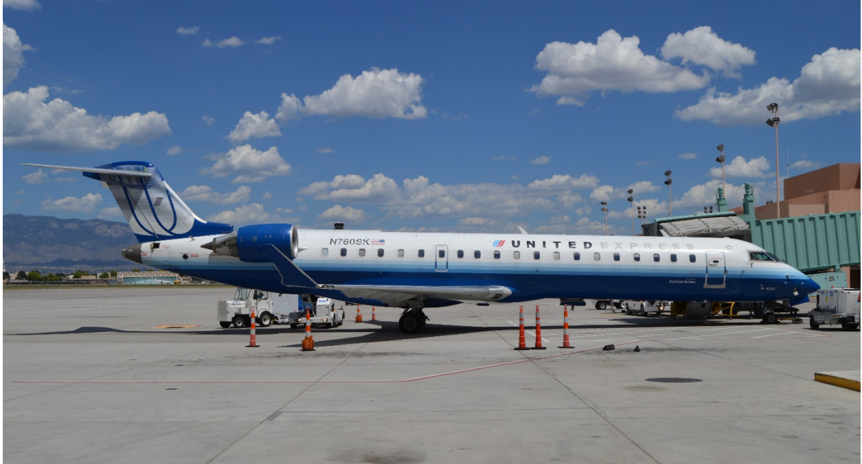
SkyWest/United Express Canadair CRJ-700 in the Rising Blue livery worn from 2004 through 2012.