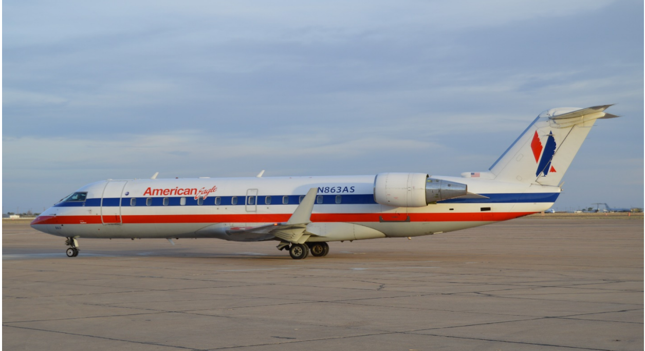
SkyWest/American Eagle CRJ-200 at the Roswell airport wearing the original livery for American Eagle. The SkyWest CRJ-200's ended service with American Eagle in 2019.