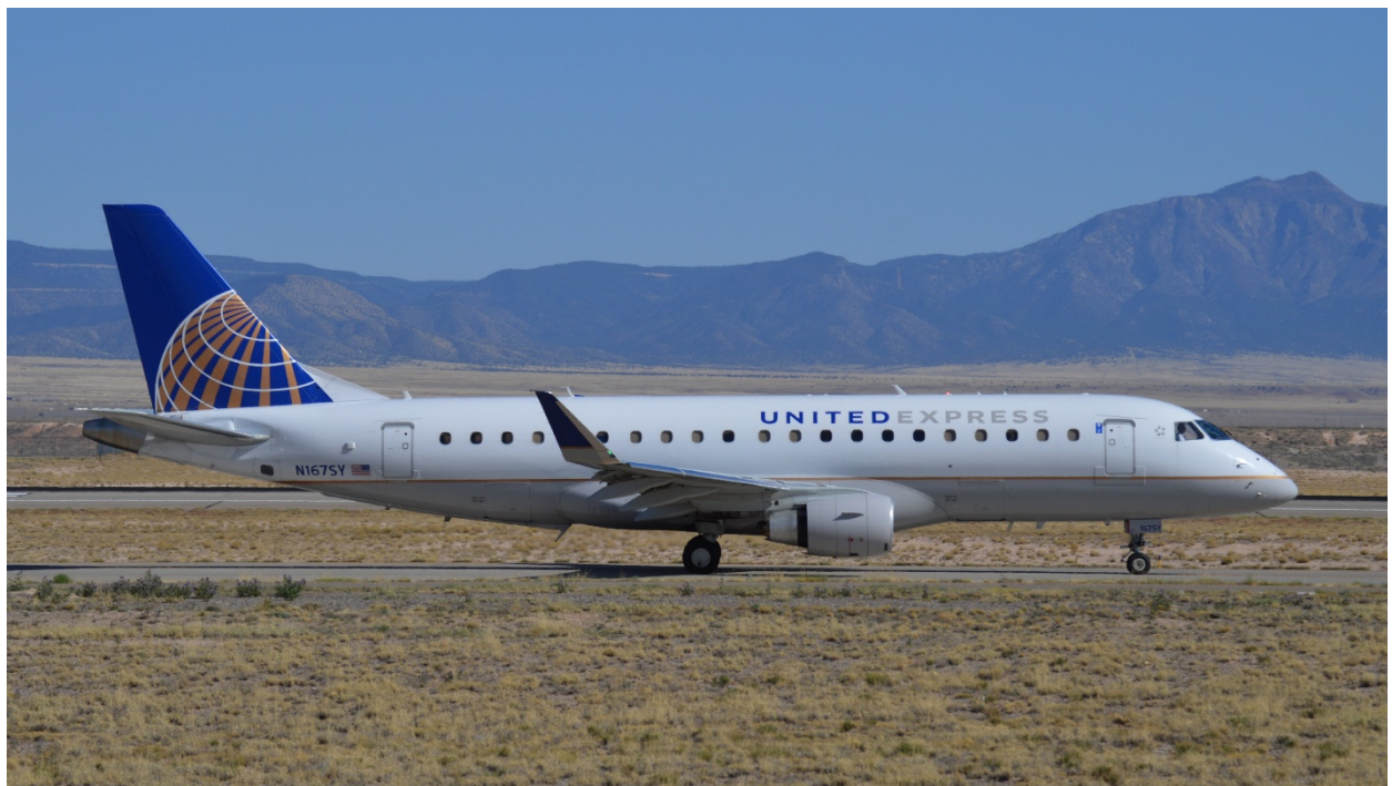
SkyWest introduced the Embraer 175 on United Express flights in 2015 wearing the former Continental Airlines livery after United and Continental merged in 2012.