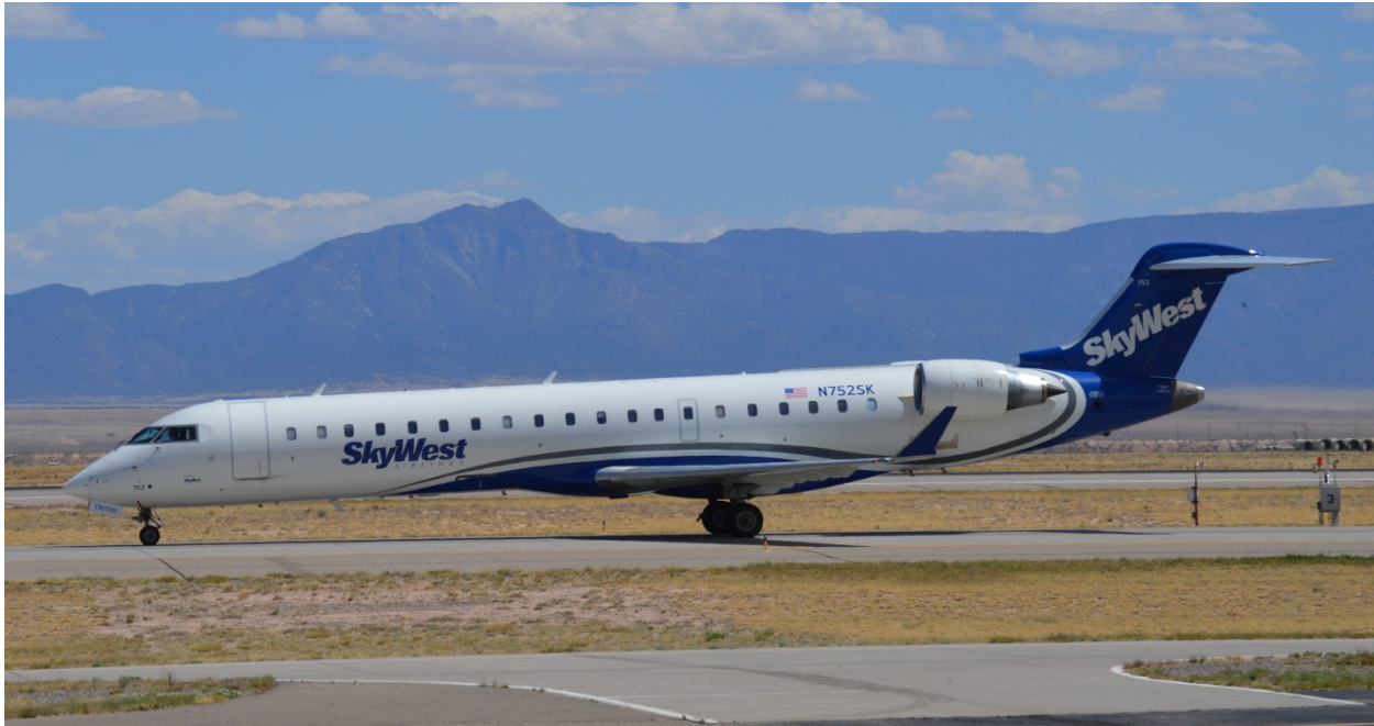
SkyWest CRJ-700 at Albuquerque in the house colors livery.