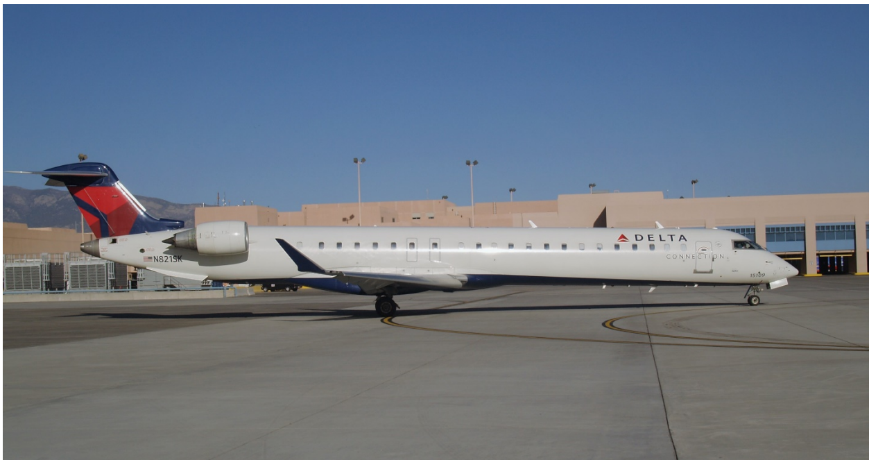
In 2009 SkyWest began flying the longer Canadair CRJ-900 for Delta Connection wearing yet another new livery called “Onward and Upward”.