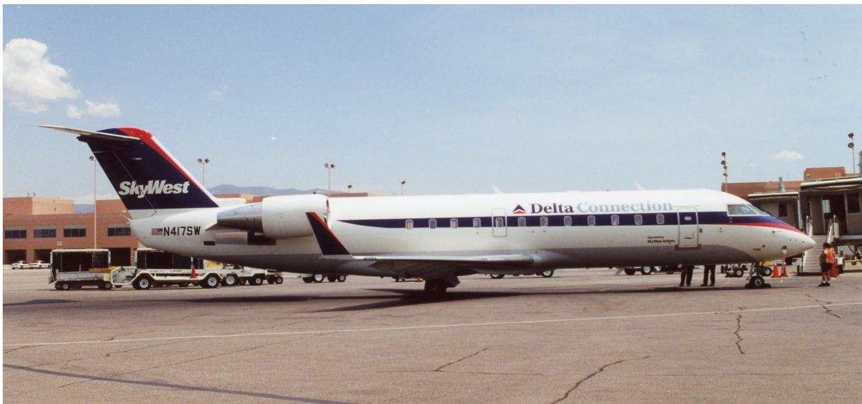
SkyWest/Delta Connection Canadair CRJ-200 in a new livery worn from 1997 through 2000.