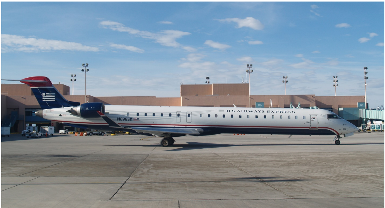
SkyWest introduced the Canadair CRJ-900 on US Airways Express flights at Albuquerque in 2013.