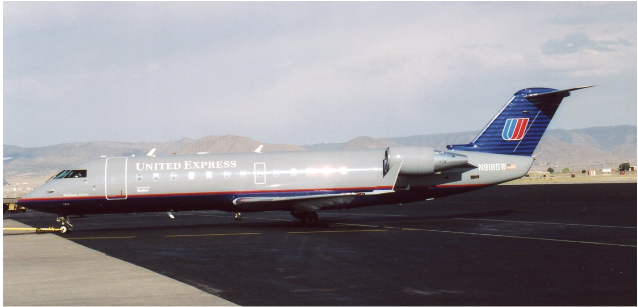
SkyWest/United Express Canadair CRJ-200 at Albuquerque in the United livery worn up until 2004.