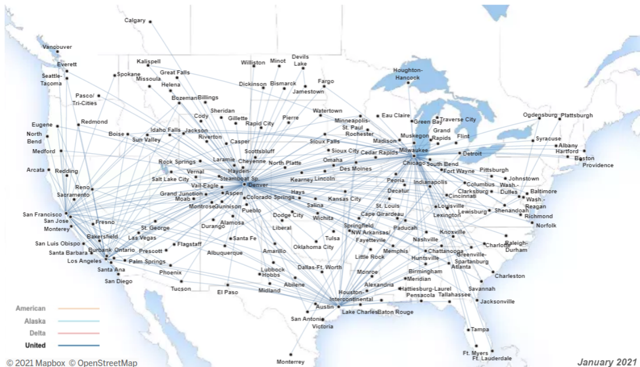
SkyWest/United Express route map from January, 2021 showing United Express routes from Albuquerque, Santa Fe, and Hobbs, New Mexico that were operated at that time.