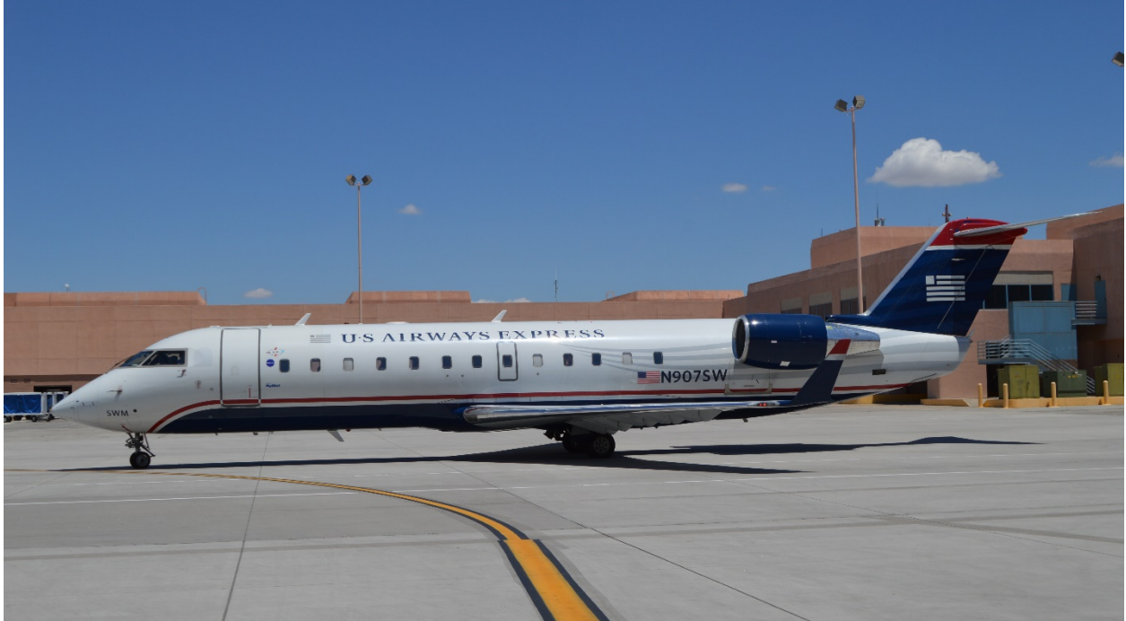
SkyWest/US Airways Express Canadair CRJ-200 at Albuquerque before US Airways merged into American Airlines in 2015.