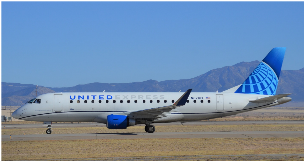
SkyWest/United Express Embraer 175 in the latest United Airlines livery that began in 2019.