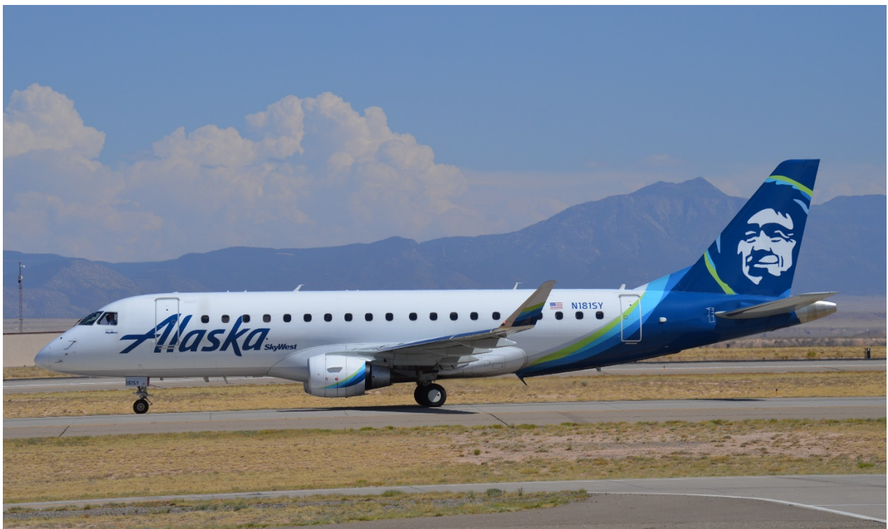
Alaska SkyWest Embraer 175 at the Albuquerque Sunport.

SkyWest added flying for Alaska Airlines to its list in 2011 and began supplementing Horizon Air as Alaska SkyWest at Albuquerque starting on May 20, 2018. Flights were first added to San Francisco then later to Portland, San Diego, and Seattle. Embraer-175 regional jets were used. Flights to San Diego and San Francisco were discontinued in late 2019 and the remaining flights to Portland and Seattle ended in early 2020. Portland service was reinstated in mid-2021 and alternated operations with Horizon Air from month to month until all service was replaced by Alaska Airlines mainline jets on March 17, 2022.