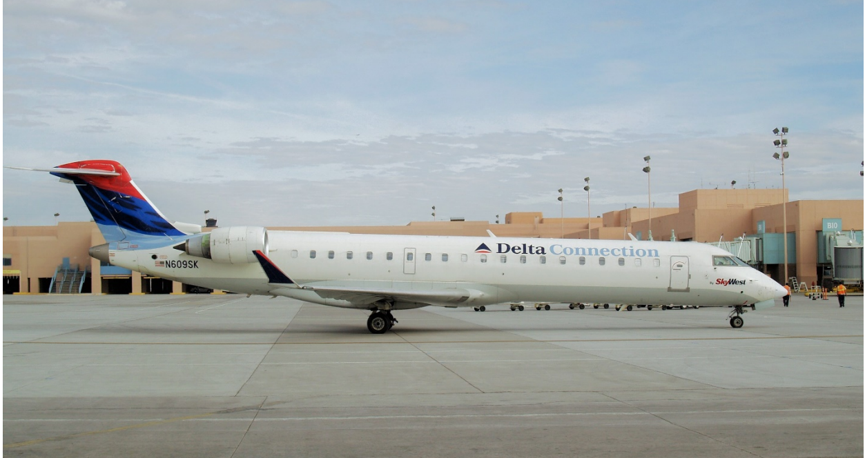
SkyWest began flying the Canadair CRJ-700 for Delta Connection in 2006 wearing a new “Colors in Motion” livery for Delta.