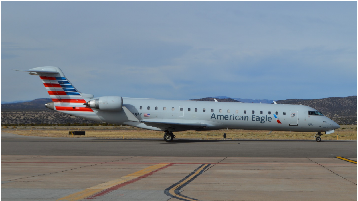
SkyWest introduced the Canadair CRJ-700 on American Eagle flights in 2016. This aircraft is seen at the Santa Fe airport wearing the latest livery for American Airlines.