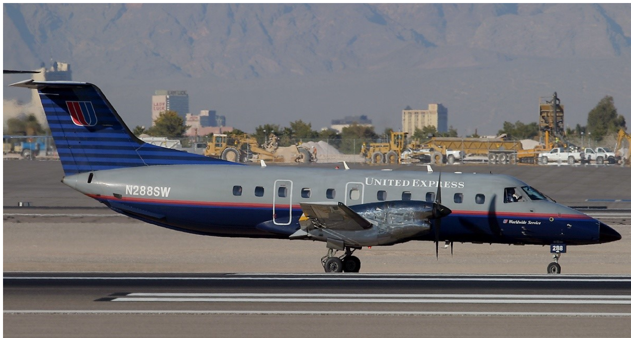
SkyWest/United Express Embraer 120 Brasilia's were briefly flown into Albuquerque in 2003 and 2004.