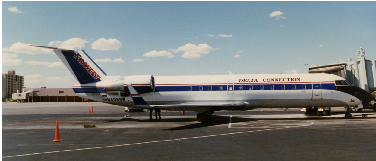
SkyWest/Delta Connection Canadair CRJ-200 at Albuquerque in the original Delta livery.