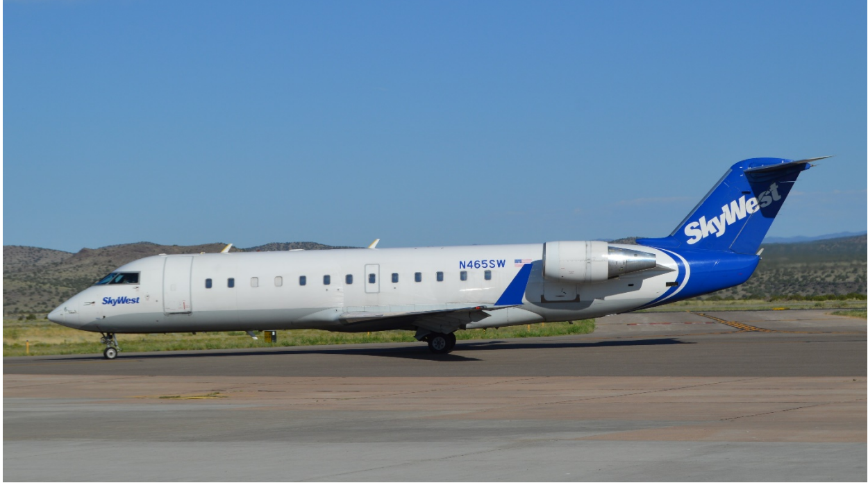
SkyWest CRJ-200 at the Santa Fe airport wearing the companies' house colors livery.