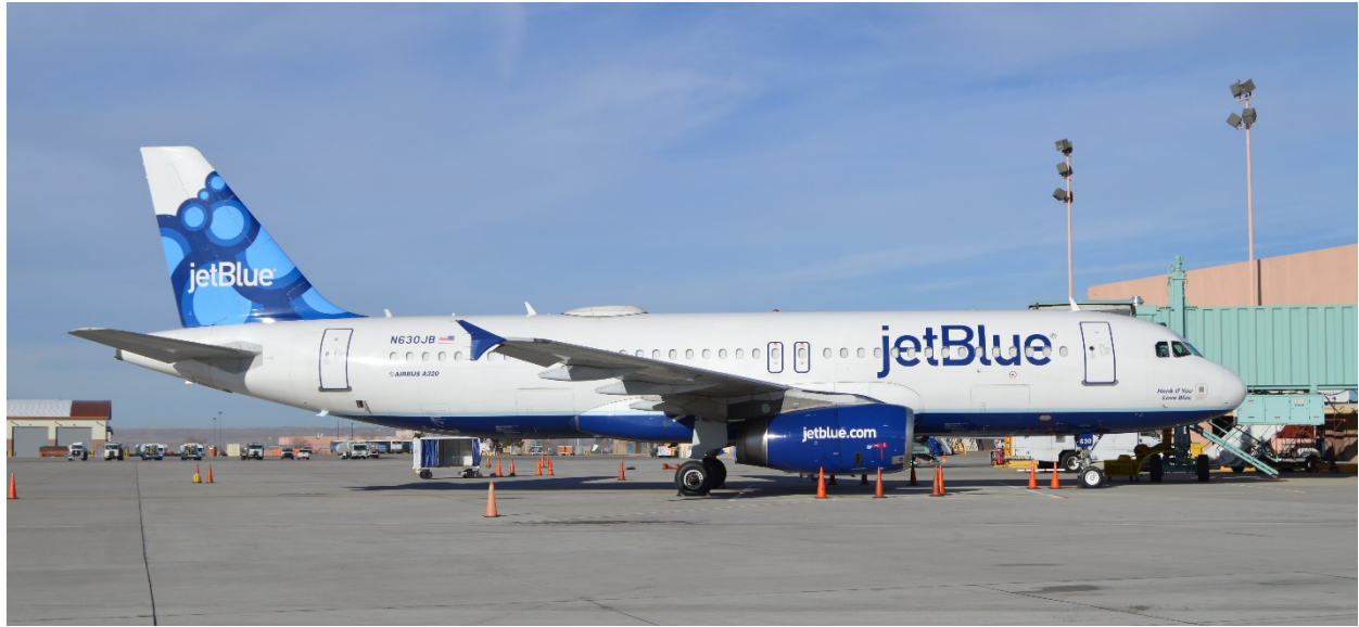
JetBlue Airbus A320 at the Albuquerque Sunport.

JetBlue has many different designs on the tails of its aircraft and each aircraft carry unique slogans such as “Mystic Blue” and “Blue Jean Baby.” The aircraft used on the inaugural flight to ABQ, N821JB, was nicknamed “Blue Yorker”.