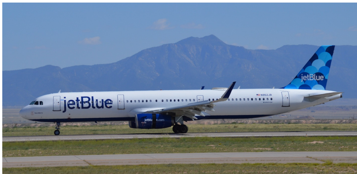
JetBlue Airbus A321 landing at the Albuquerque Sunport.