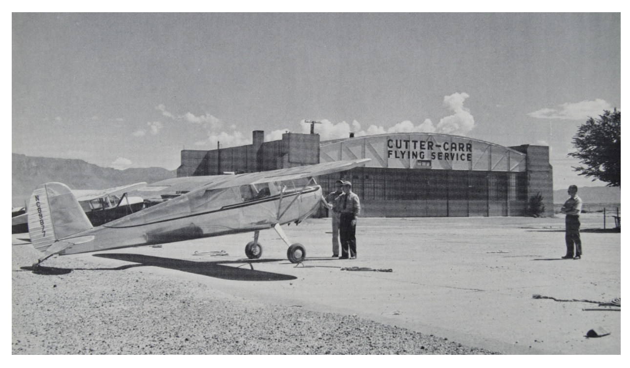
Cutter-Carr Flying Service at Albuquerque's West Mesa Airport 1940's through 1960's