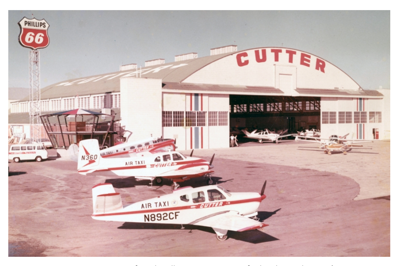
Cutter Air Taxi aircraft at the Albuquerque Sunport facility during the 1960's.