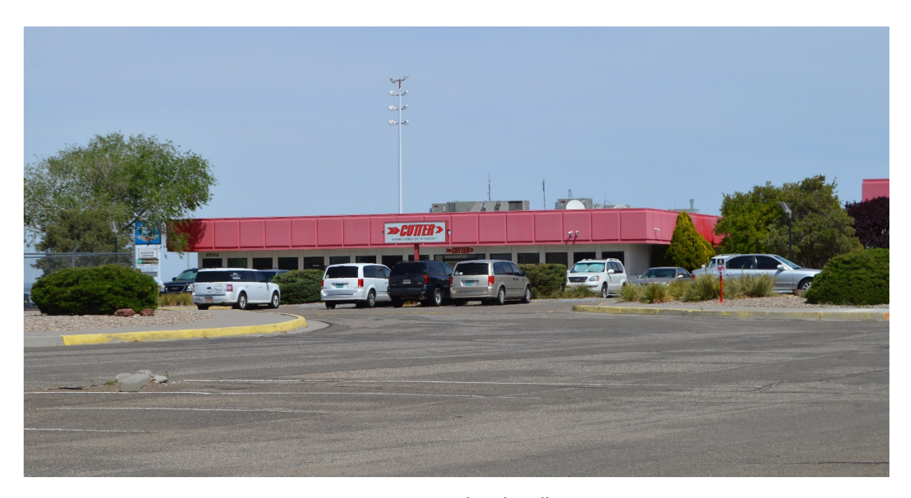
Current Cutter Aviation terminal at the Albuquerque Sunport.