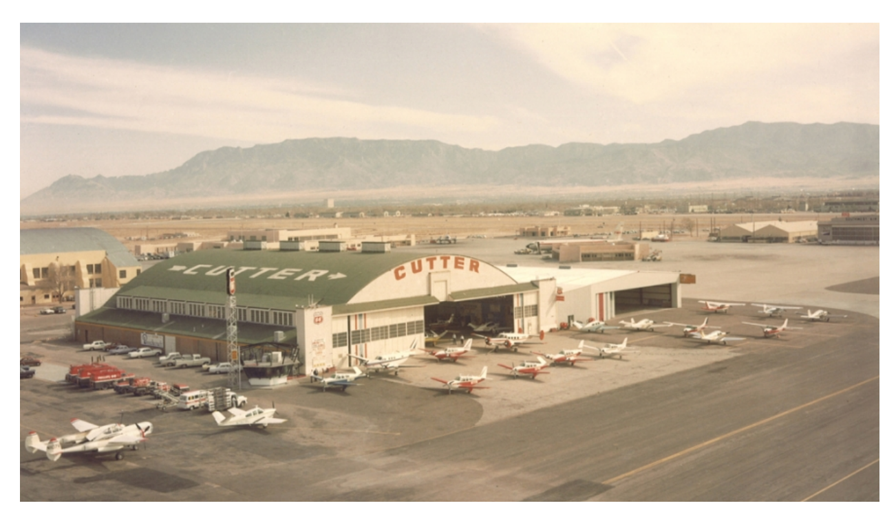
Cutter Aviation facility at the Albuquerque Sunport, 1947 through the mid 1980's.