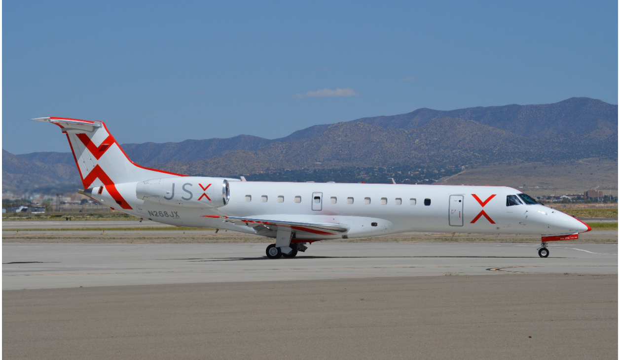
JSX Air Embraer-135 at the Albuquerque Sunport in 2020.