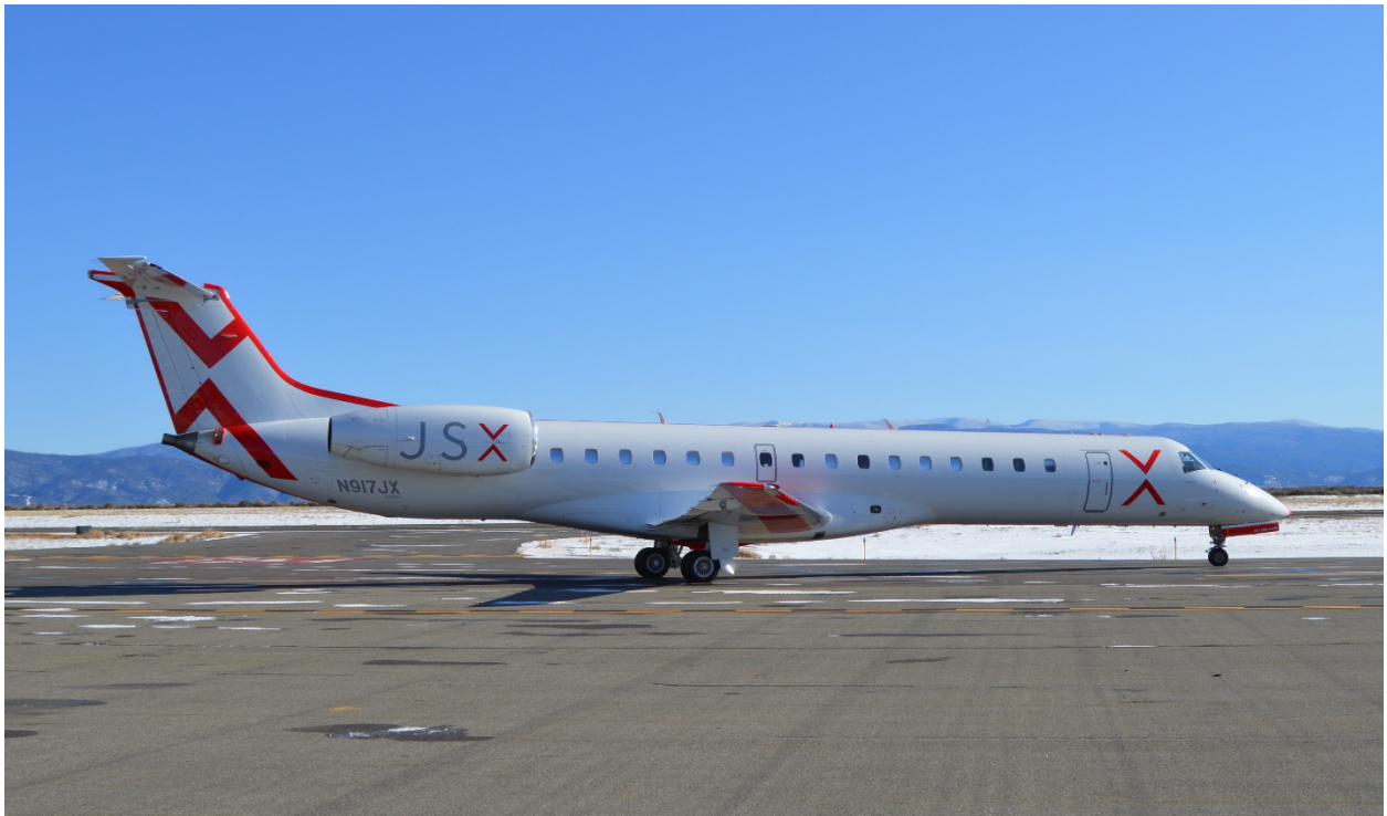
JSX Air Embraer-145 at the Taos Regional Airport upon inauguration of service in December, 2022.