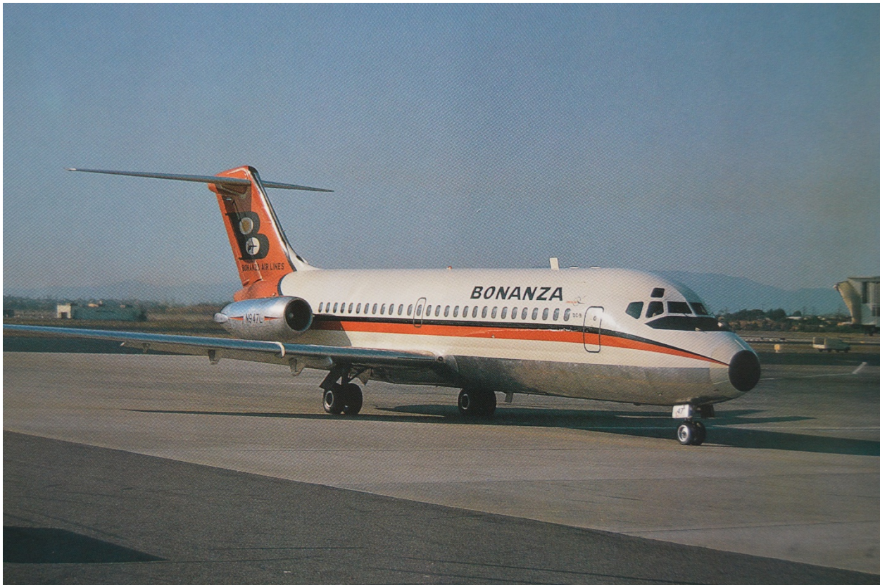
Bonanza Air Lines Douglas DC-9.