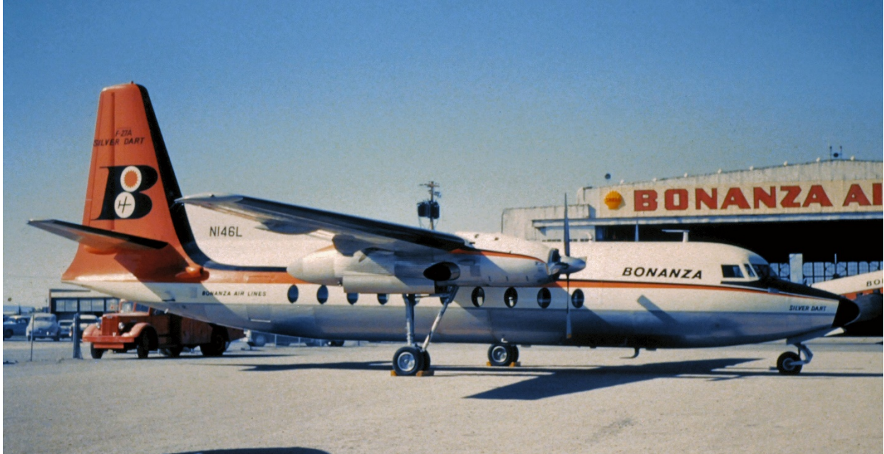
Bonanza Air Lines Fairchild F-27.