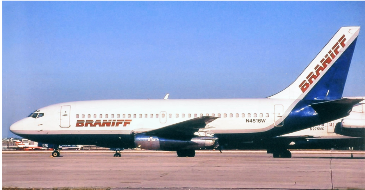
Braniff Boeing 737-200.