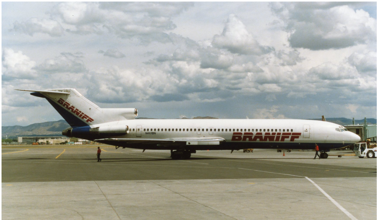
Braniff Boeing 727-200 at the Albuquerque International Sunport.

Braniff Airways was a large U.S. legacy air carrier founded in 1928 and based in Dallas, Texas. The airline, later known as Braniff International, operated routes throughout the United States, Mexico, and South America with major hubs at Dallas/Fort Worth and Miami. For a time in 1947 Braniff proposed to serve Albuquerque and Roswell with an Amarillo-Albuquerque-Los Angeles route and a Lubbock-Roswell-Phoenix-San Diego route. Upon airline deregulation in 1978, Braniff had very aggressive expansion causing it to lose a massive amount of money, declare bankruptcy, and shut down on May 12 of 1982. The airline reorganized and returned to life in 1984, building a new hub at Kansas City where Eastern Air Lines was retreating. Braniff briefly served Albuquerque from May 1, 1988 through September 27, 1989 with two daily roundtrip flights from Kansas City to Albuquerque and continuing onto Tucson using Boeing 727-200 and 737-200 jets. The new Braniff also shut down a short time later.