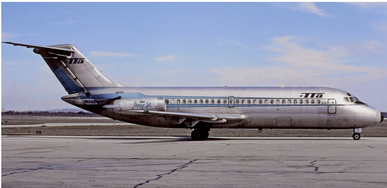
Trans-Texas Airways Douglas DC-9-10 named the Pamper Jet .