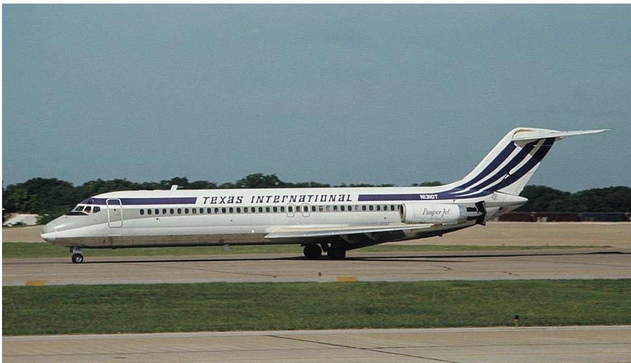
Texas International Douglas DC-9-30 also introduced in 1969.