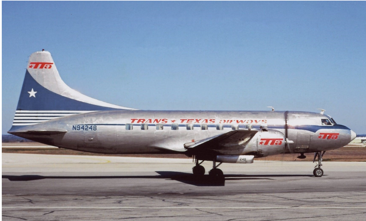
Trans-Texas Airways Convair 240.