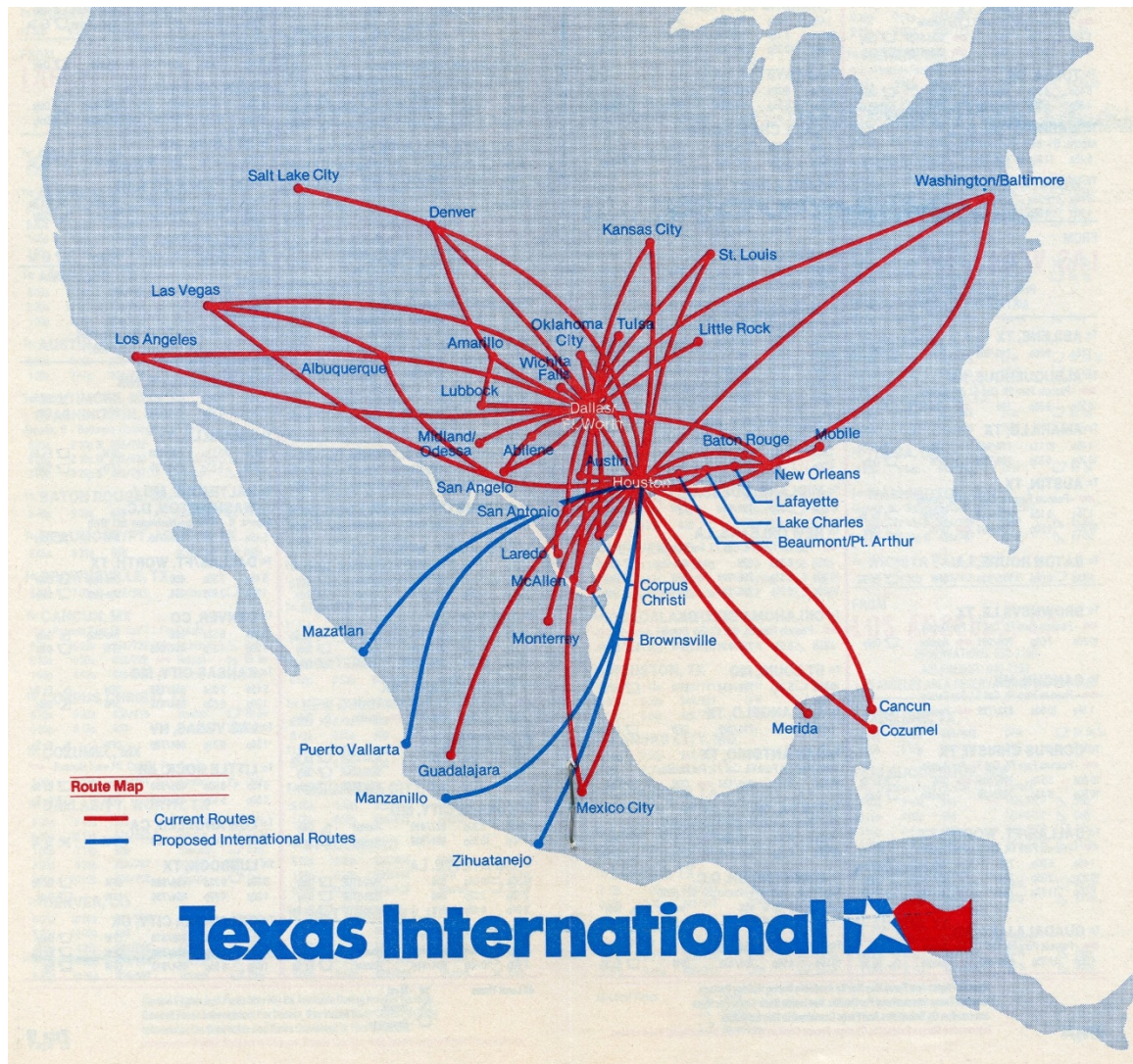
Texas International route map from 1980.

Texas International's parent company, Texas Air, bought out Continental Airlines and the two carriers were merged on October 31, 1982, with the Continental name prevailing and ending 19 years of service for TTA/TI in New Mexico. Continental soon dropped the routes from Albuquerque to Dallas/Fort Worth, Las Vegas, and Los Angeles leaving the Albuquerque-Houston route as the only remnant of Texas International Airlines in New Mexico. In 1987 a commuter carrier, Trans-Colorado Airlines, briefly flew as a Continental Express feeder carrier and operated a former TI route from Albuquerque to Roswell, Carlsbad, and El Paso however the service only lasted for about four months.