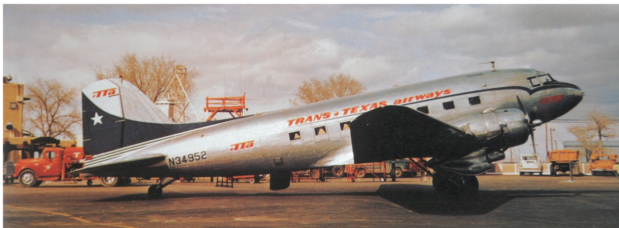
Trans-Texas Airways Douglas DC-3 at the old Albuquerque Municipal Airport terminal.

Trans-Texas Airways began in 1944 as Aviation Enterprises based in Houston, Texas and serving routes within the state of Texas. The name was changed to Trans-Texas Airways (TTA) and operations officially began on October 11, 1947. Service to Albuquerque, Santa Fe, and Clovis, New Mexico began on October 15, 1963 and service to Roswell, Carlsbad, and Hobbs, New Mexico began on November 6, 1963. TTA's service replaced Continental Airlines on the Albuquerque-Roswell-Carlsbad-Hobbs-Midland/Odessa-Dallas route and on the Albuquerque-Santa Fe-Clovis-Lubbock-Abilene-Dallas route which was originally started by Pioneer Airlines. Certain flights would also stop at Big Spring, Brownwood, Fort Worth, and San Angelo, Texas as well. The airline first operated all flights with 21-seat Douglas DC-3 aircraft but soon upgraded with 40-seat Convair 240's which were later modified with turboprop engines into Convair 600's. Occasionally flights were flown from Roswell and Carlsbad to El Paso as well as nonstop flights from Hobbs to Dallas.