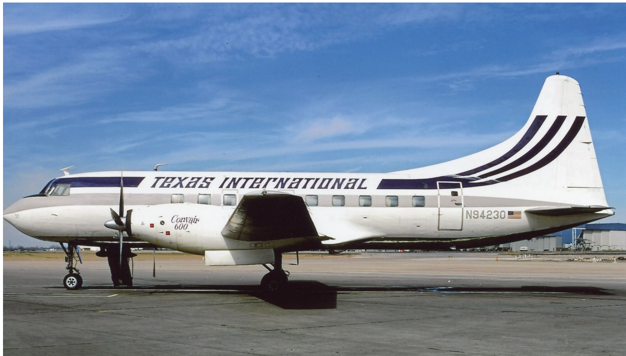
Texas International Convair 600 reflecting the 1969 name change and a new livery.