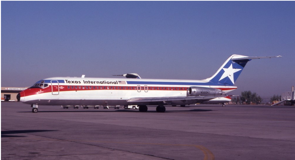
Texas International Douglas DC-9-30 “ City of Albuquerque ” at the Albuquerque Sunport wearing the latest livery introduced in 1973.