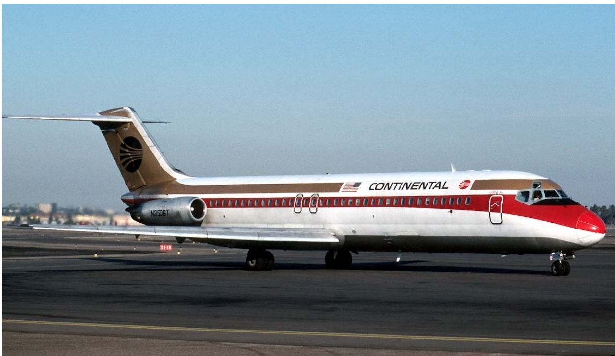
Former Texas International Douglas DC-9-30 in a hybrid livery for Continental Airlines.