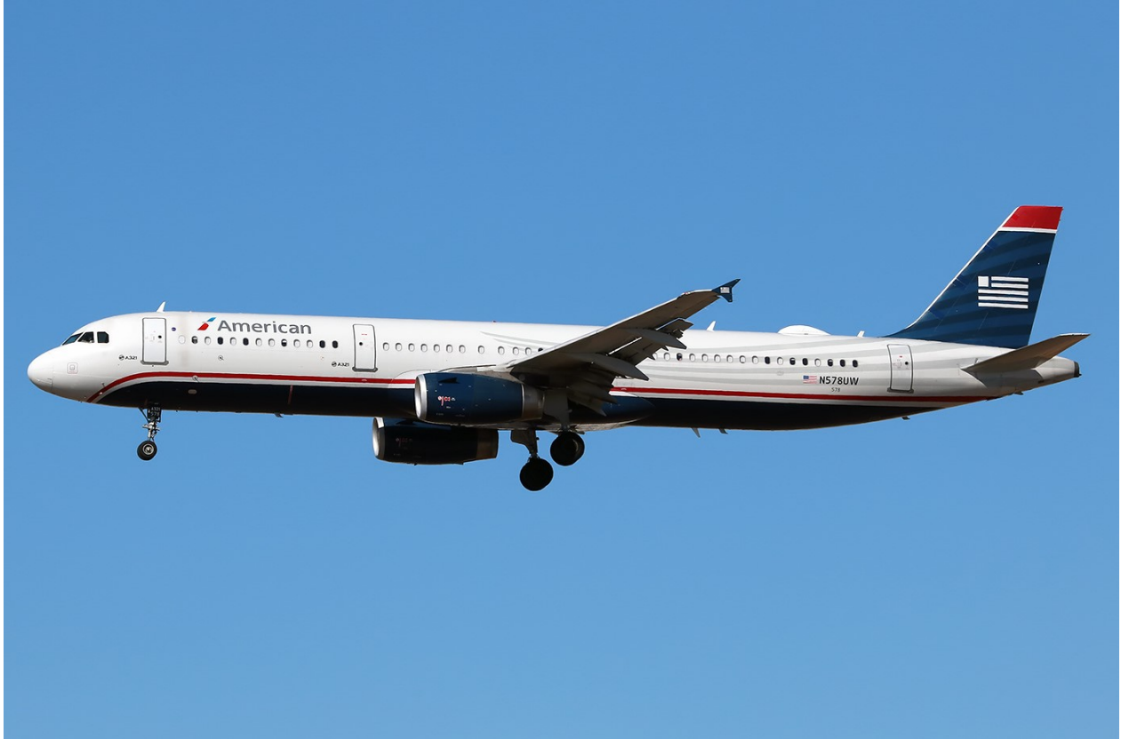
American Airlines Airbus A321 retaining the colors of U-S Airways.

More detail on PSA, America West, and American Airlines, as well as the U-S Airways Express operations by Mesa, Air Midwest, and SkyWest Airlines, has been written in separate links for each of these carriers in the “Major airlines regional partners” section.