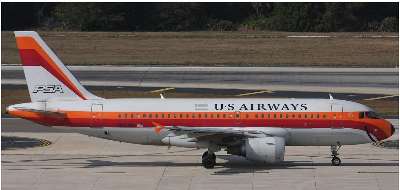
U-S Airways Airbus A319 in the former colors of PSA.