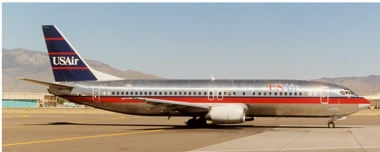
USAir Boeing 737-400 at the Albuquerque Sunport introduced in 1992.