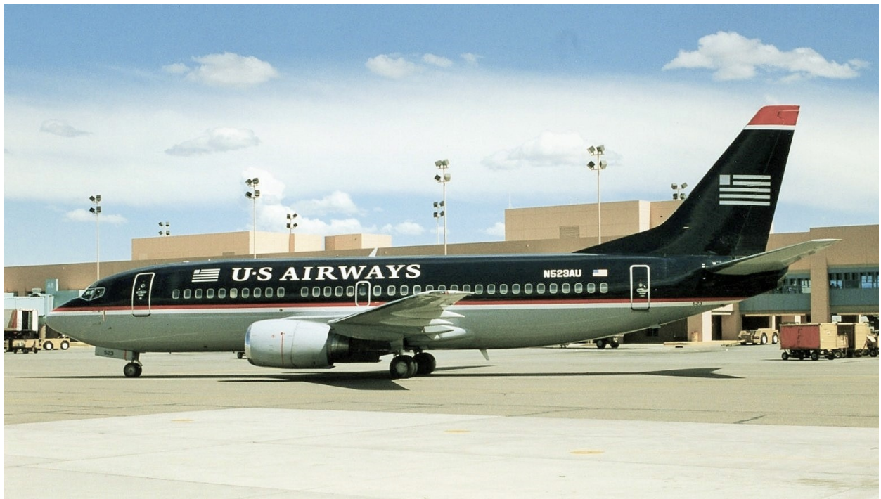
U-S Airways Boeing 737-300 at the Albuquerque Sunport reflecting the name change and a new livery in 1997.