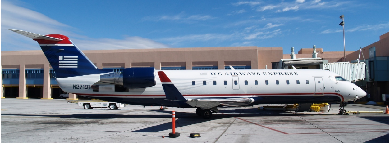
U-S Airways Express Canadair CRJ-200 at the Albuquerque Sunport. Both Mesa and SkyWest Airlines flew this aircraft type.