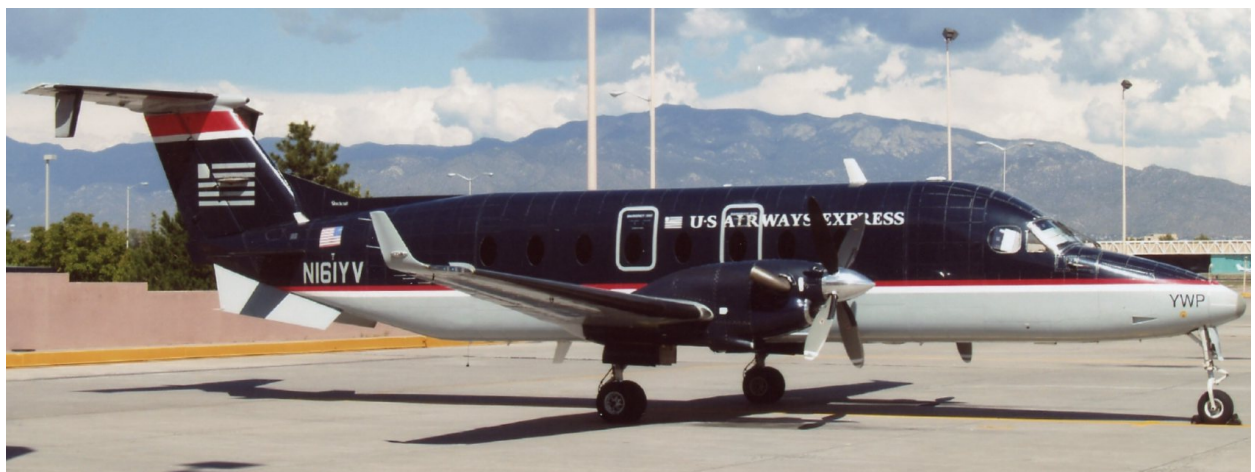
U-S Airways Express Beech 1900D used for service to Farmington, New Mexico in 2007 and 2008.