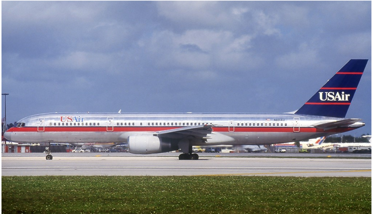
USAir Boeing 757-200 used at Albuquerque in 1995.