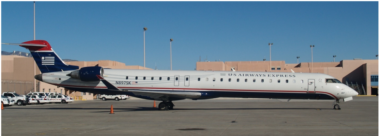
U-S Airways Express Canadair CRJ-900 at the Albuquerque Sunport. Both Mesa and SkyWest Airlines also flew this aircraft type.