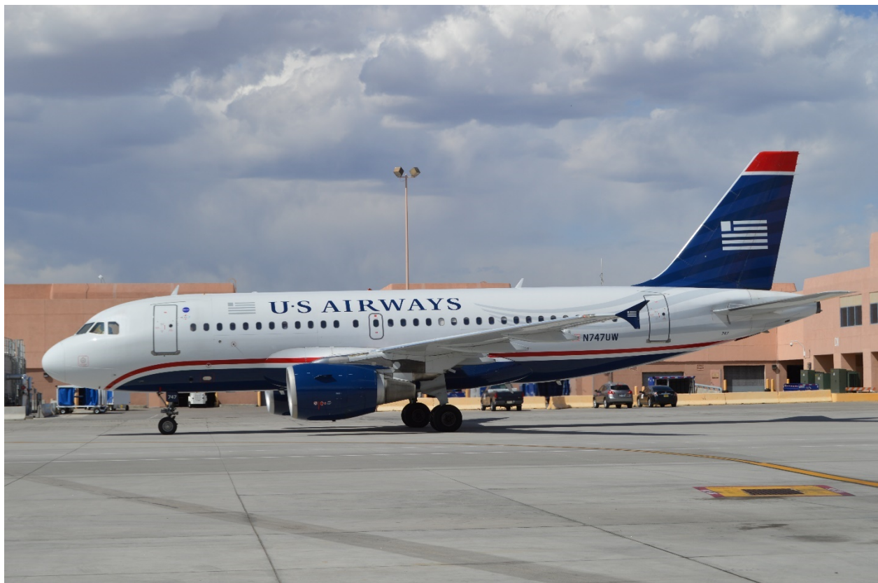
U-S Airways Airbus A319 at the Albuquerque Sunport in the final livery starting in 2007.