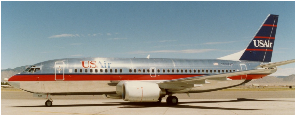
USAir Boeing 737-300 at the Albuquerque Sunport in a new livery starting in 1989.