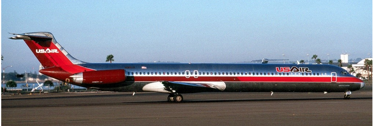
USAir McDonnell Douglas MD-80 originally flown by PSA in 1988.