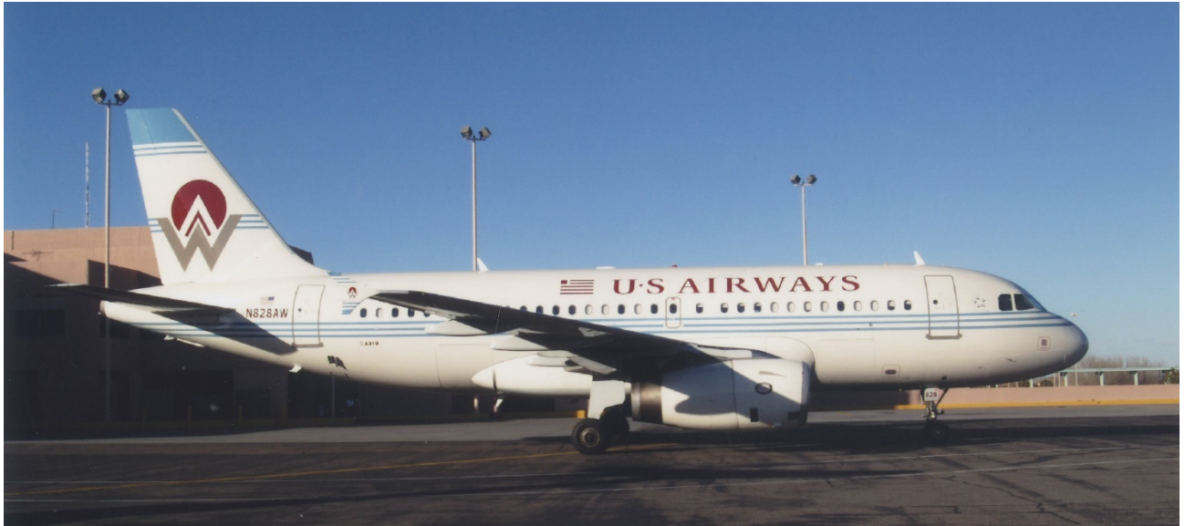
U-S Airways Airbus A319 in the former colors of America West Airlines at the Albuquerque Sunport.

U-S Airways had seen four different paint schemes on its aircraft during the two times it served Albuquerque. The carrier also had several aircraft painted with special schemes honoring sports teams and in the livery of airlines that it has merged with in the past including PSA and America West. American has carried on this tradition and maintained one aircraft in a U-S Airways paint scheme as well.