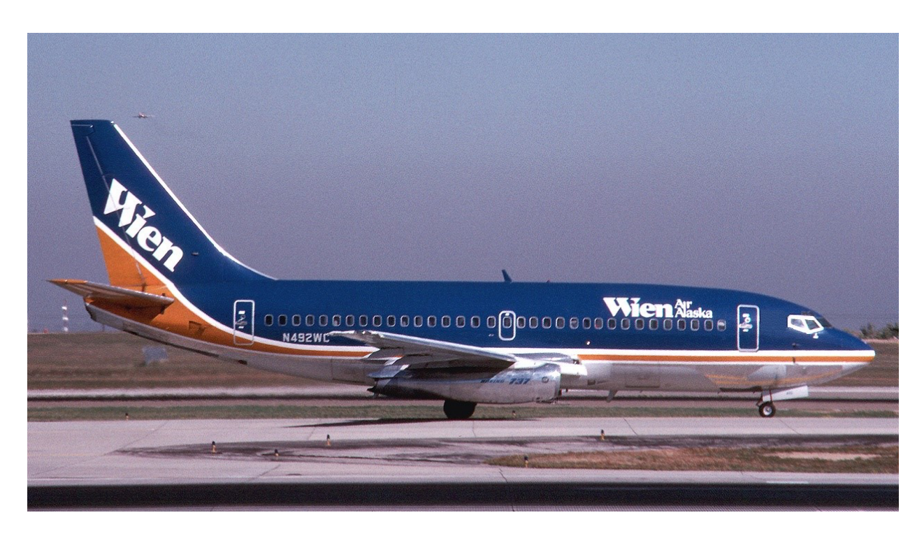
Wien Air Alaska Boeing 737-200.

Wien Alaska Airways was a family owned airline established in 1927 operating within the state of Alaska. The name was changed several times until Wien Air Alaska was adopted in 1974. After airline deregulation in 1978, Wien began expanding into the lower 48 states and introduced service to Albuquerque on March 2, 1984 with a single flight to Oakland, California, continuing on to Portland, Seattle, Anchorage, and ending in Kodiak, Alaska using a Boeing 737-200 aircraft. A second flight was added a month later to Denver, Seattle, and Anchorage using a 727-200 but ended the same month. Wien's service to Albuquerque was very brief as the first flight was then discontinued on May 31, 1984, only three months after it had started. The airline had shut down by November of that year.