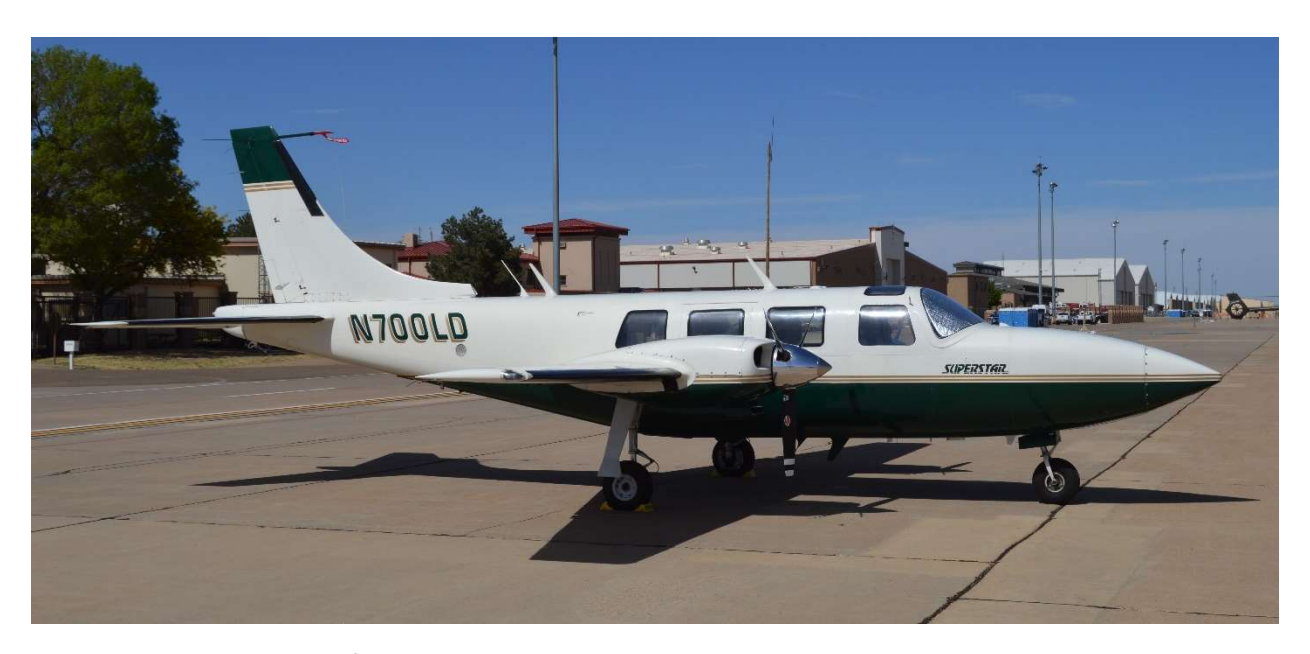
Ted Smith Aerostar, now referred to as a Piper Aerostar, like what was operated by Trans Western Airlines.

Trans Western Airlines was based in Logan, Utah and operated an Albuquerque-Santa Fe-Denver route from about May 15, 1977 through late 1978. The carrier started service with a Ted Smith Aerostar 601 aircraft then switched to a Twin Beech-18. It appears that the once daily round-trip flight was taken over from a previous carrier, Priority Air Transport. In September, 1978 Trans Western added a second round-trip which included stops at Espanola and Taos, New Mexico as well as Alamosa, Colorado along the route between Santa Fe and Denver. All New Mexico service ended by November, 1978 and Trans Western continued serving Utah and surrounding states with a hub in Salt Lake City until it merged into Horizon Air in 1983. Horizon Air, now a subsidiary of Alaska Air Group, then served Albuquerque in the mid-2000s as Frontier Jet Express and again beginning in 2017 as Alaska Horizon providing feeder service on behalf of Alaska Airlines.