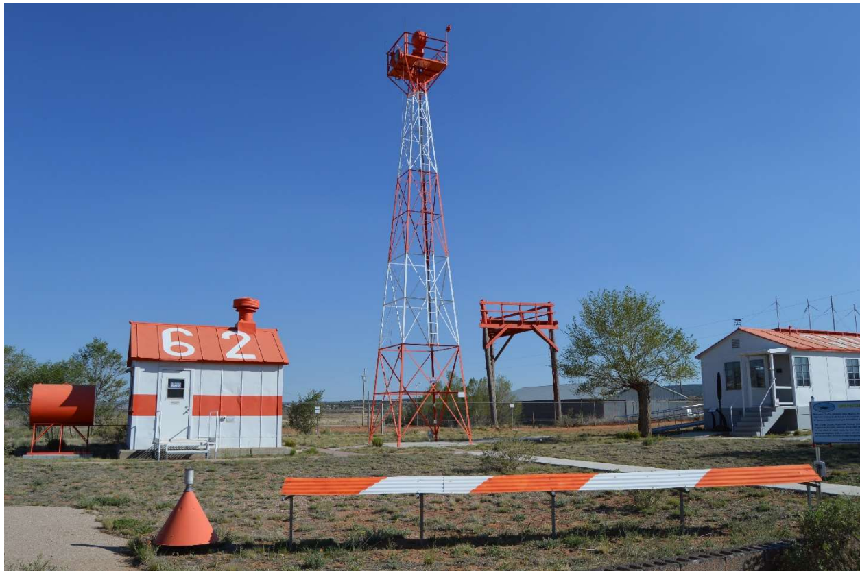
The Western New Mexico Aviation Heritage Museum at the Grants-Milan airport.