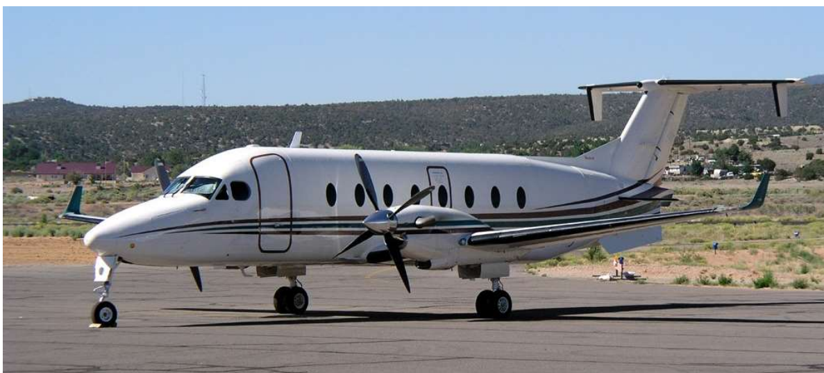
A privately owned Beechcraft 1900D airliner at the Grants-Milan airport in 2003.