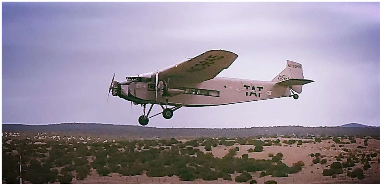
A restored Transcontinental Air Transport Ford Tri-motor aircraft that would fly near Grants on the segment between Winslow, Arizona and Albuquerque along the Los Angeles to Amarillo airway from 1929 through the early 1930's.