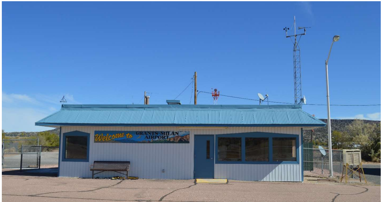
Terminal building at the Grants-Milan Municipal Airport.

On the grounds of the Grants-Milan Airport is the Western New Mexico Aviation Heritage Museum operated by the Cibola County Historical Society. This museum exhibits the equipment and facilities used for early air navigation beginning in 1929 along the Los Angeles to Amarillo airway.