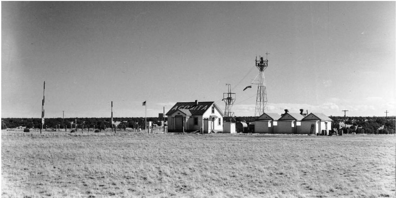
The Acomita airfield used from 1929 through 1953.

Prior to the opening of the Grants-Milan airport, an airfield near Acomita was used, built in 1929 on McCarty's Mesa, 12 miles southeast of Grants. This airfield had three dirt runways and was constructed as an emergency landing strip along a newly created airway from Los Angeles to Amarillo. By 1931 Acomita airfield was equipped with boundary and approach lights as well as an airway beacon and by 1933 the airfield housed a Civil Aeronautical Administration (CAA) radio, weather, and flight services site. Acomita airfield was in operation until the Grants airport opened in 1953.