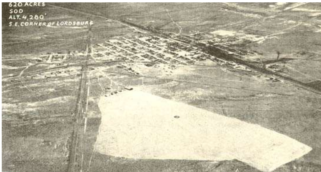
The Lordsburg airport in 1933 as a cleared parcel of land.

The Lordsburg airport was constructed in the mid-1920's and is reportedly the first airport in New Mexico. Initially the airfield consisted of a cleared parcel of land so that pilots could take off and land in any direction. Famous aviator Charles Lindbergh made a stop in Lordsburg in 1927 during his Spirit of Saint Louis air tour of the United States after he was the first to fly solo across the Atlantic Ocean. Two dirt runways were later constructed. The airport briefly saw commercial air service in the early 1950's when the original Frontier Airlines made a stop at Lordsburg, one of many stops along a route between Phoenix and El Paso. The airline flew Douglas DC-3 aircraft at the time. In the mid-1970's as Interstate Highway 10 was constructed around Lordsburg, one runway had to be relocated and a new, paved runway was built.