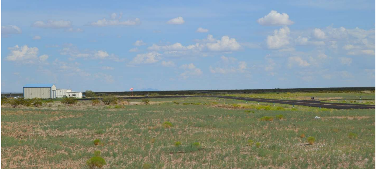
Lordsburg Municipal Airport in 2017.