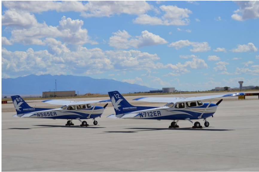
September 26, 2022 - A pair of Cessna 172's from Embry-Riddle Aeronautical University sit on the tarmac outside of Atlantic Aviation in Albuquerque on September 21, 2022.