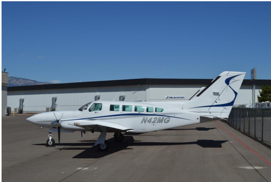
December 12, 2022 - South Aero's Cessna 402, N42MG, is parked at the General Aviation facility at the Albuquerque Sunport on May 16, 2020.