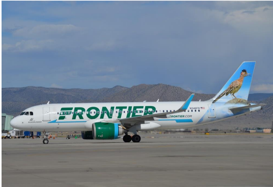
October 11, 2022 - This Frontier Airlines Airbus A320neo, N346FR, featuring “Al” the roadrunner, New Mexico’s state bird, taxis to the gate at the Albuquerque Sunport on June 1, 2021.