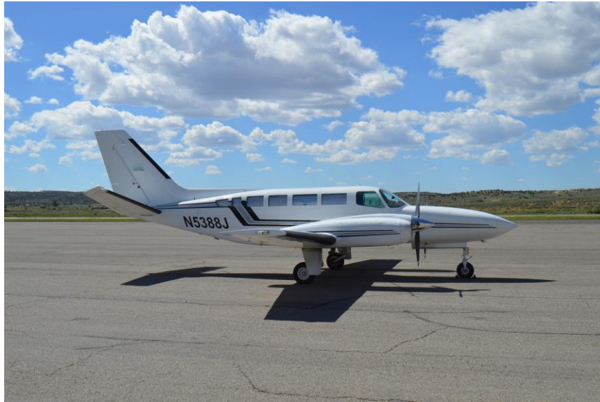
December 12, 2022 - This South Aero Cessna 404 Titan, N5388J, is seen parked on the ramp at the Gallup Municipal Airport in New Mexico on June 22, 2019.