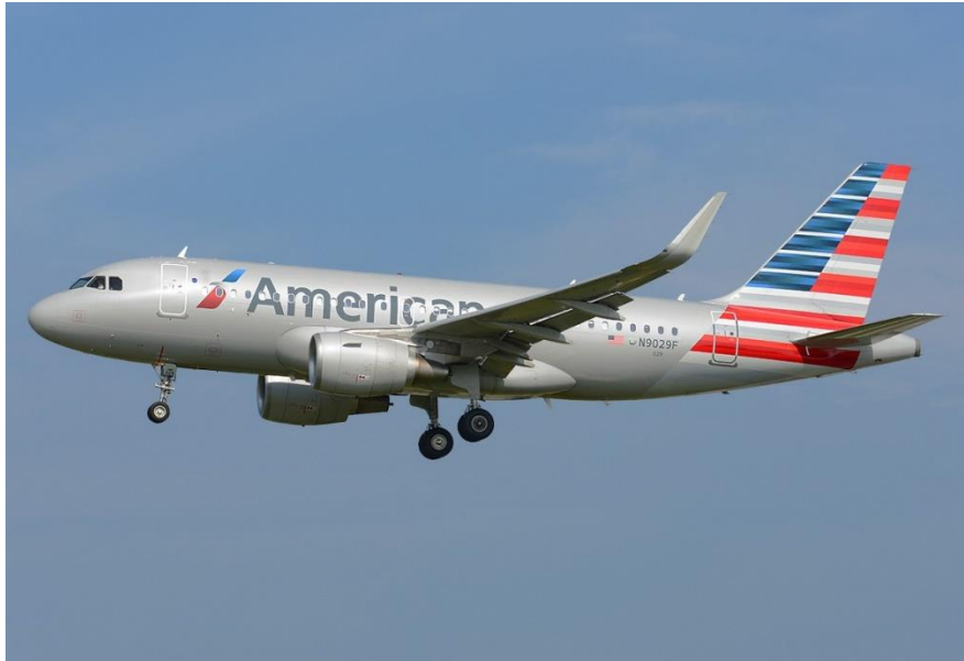
October 10, 2022 - American Airlines Airbus A-319 N9029F arrives at the Albuquerque Sunport on November 20, 2017.