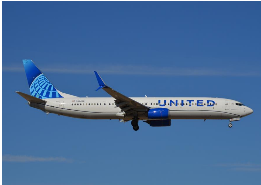
November 30, 2022 - United Airlines Boeing 737-900, N38458, comes in to land on runway 08 at the Albuquerque Sunport on November 15, 2022.