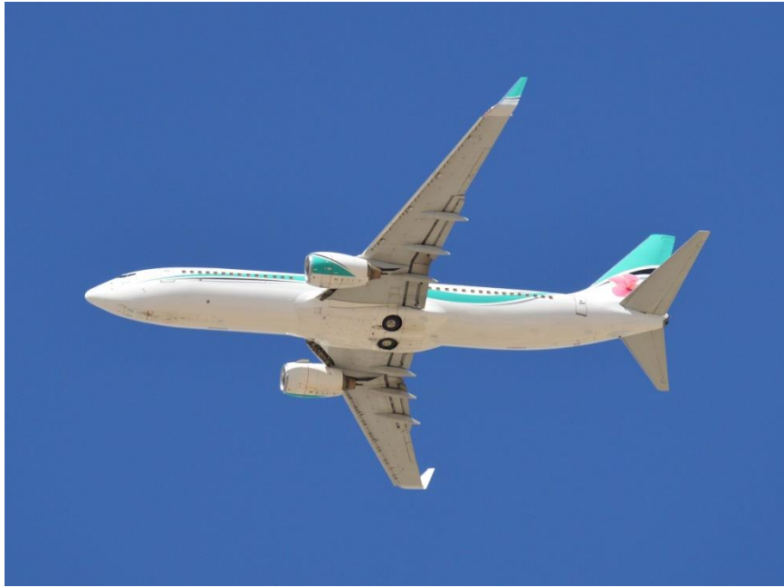
September 23, 2022 - Kaiser Air Boeing 737-800 departs Albuquerque on the way back to Oakland California September 21, 2022.