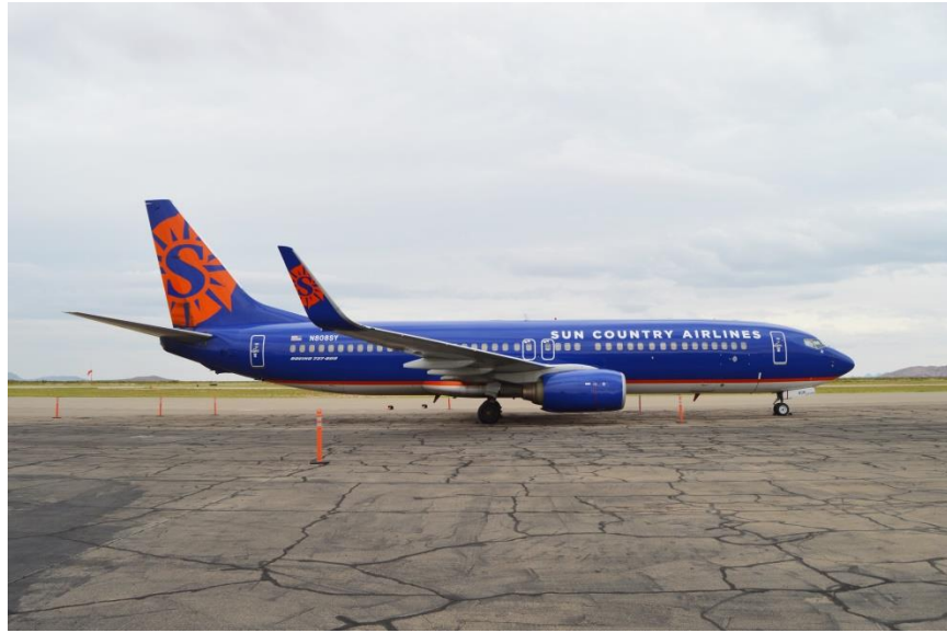
October 4, 2022 - This Sun Country Airlines Boeing 737-800 is parked at the Las Cruces Airport on September 14, 2019 after bringing the San Diego State football team to play against the New Mexico State Aggies.