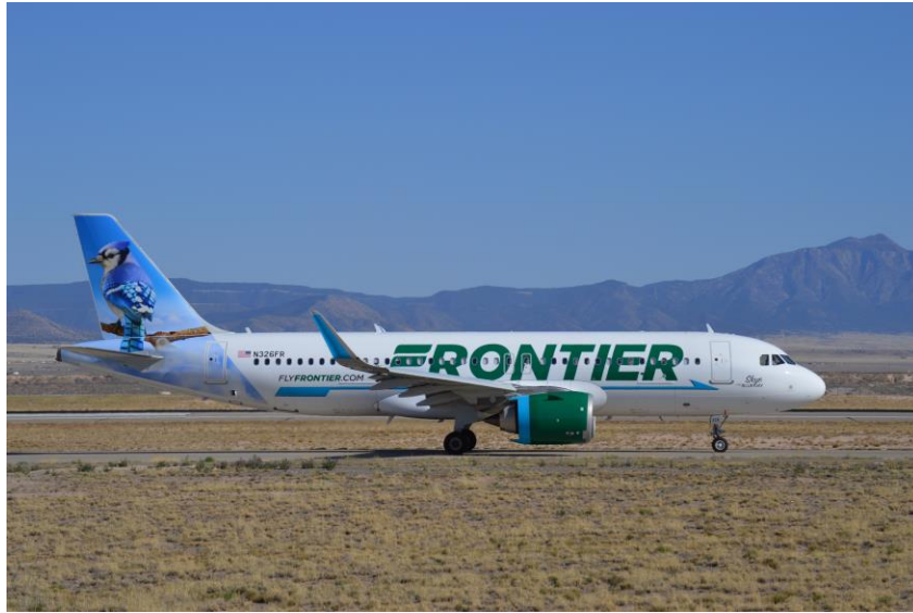
December 5, 2022 - Frontier Airlines Airbus A320neo, N326FR, featuring “Skye” the Blue Jay, taxis to runway 03 for immediate takeoff from the Albuquerque Sunport on its way to Denver, Colorado on April 9, 2018.