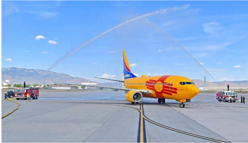
October 10, 2022 - Southwest Airlines New Mexico One receives a water cannon salute on arrival to the Albuquerque Sunport on June 7, 2019.