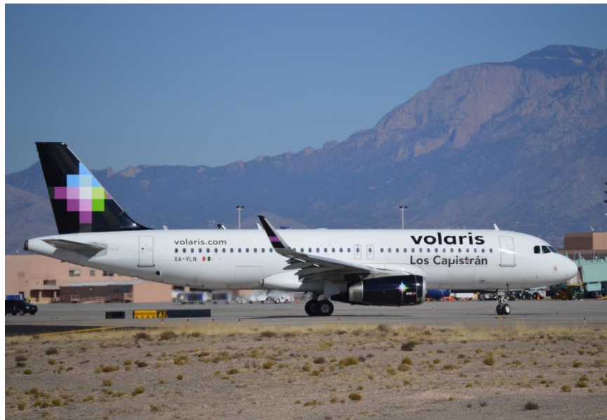
October 11, 2022 - Volaris Airbus A-320 XA-VLN arrives at the Albuquerque Sunport on its inaugural flight November 17, 2018.