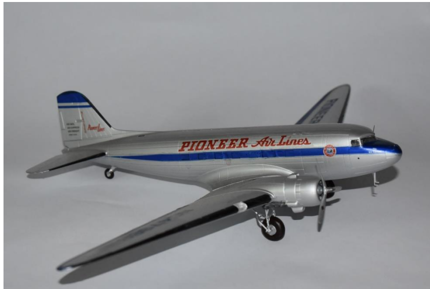
August 22, 2022 - This Pioneer Airlines DC-3 model was donated to CoW and placed in the display on July 29, 2022. This plane serviced Albuquerque beginning in 1948 at the original Albuquerque airport.