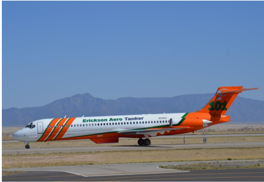
August 22, 2022 - This Erickson Aero Tanker MD-87 was photographed April 28, 2022. It was soon followed by three other air tanker companies to fight record fires in the state of New Mexico.