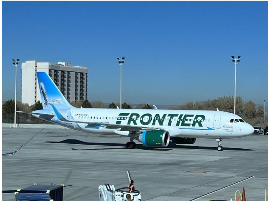
December 1, 2022 - Frontier Airlines Airbus A320neo, N373FR, featuring “Francie” the Piping Plover, taxis to gate B6 at the Albuquerque Sunport after arriving from Las Vegas Nevada on December 1, 2022.