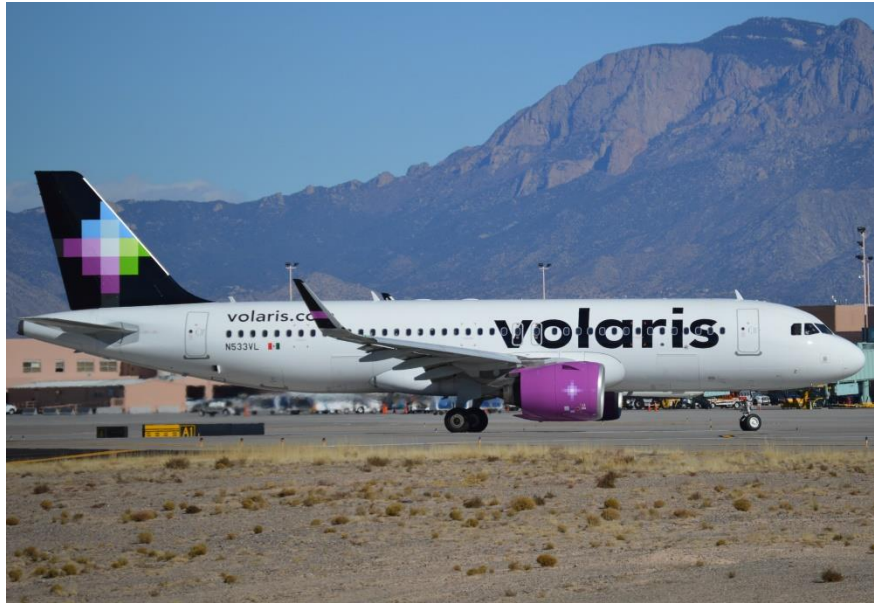
October 11, 2022 - Volaris Airbus A-320 neo taxis after arrival to the Albuquerque Sunport on December 22, 2018.