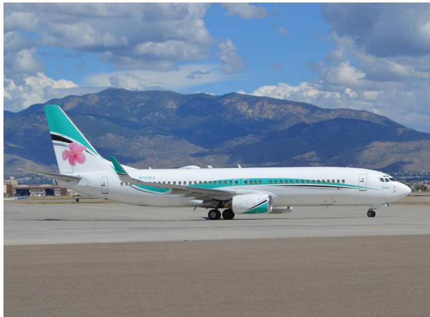
September 23, 2022 - Kaiser Air Boeing 737-800 taxiing to the runway to depart Albuquerque September 21, 2022.