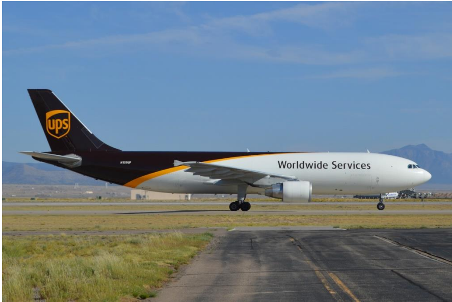
October 21, 2022 - This UPS Airbus A300-600, N159UP, is taxiing to the airfreight terminal at the Albuquerque Sunport on September 5, 2019.