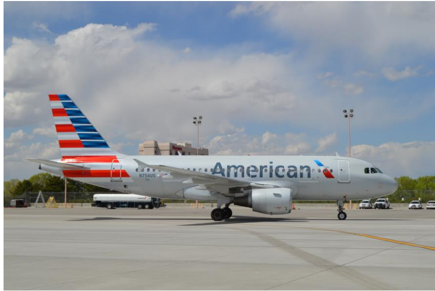
November 4, 2022 - This American Airlines Airbus A319, N756US, taxis to the gate at the Albuquerque Sunport on April 22, 2015. This aircraft was acquired in the merger with US Airways.