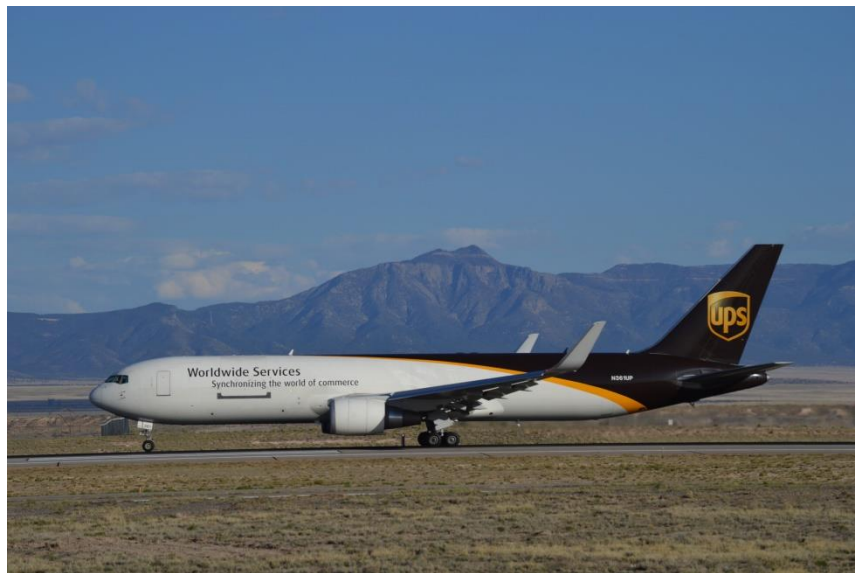
October 21, 2022 - This UPS Boeing 767-300, N361UP, is taxiing off runway 03 at the Albuquerque Sunport on April 21, 2016 heading to the airfreight terminal.