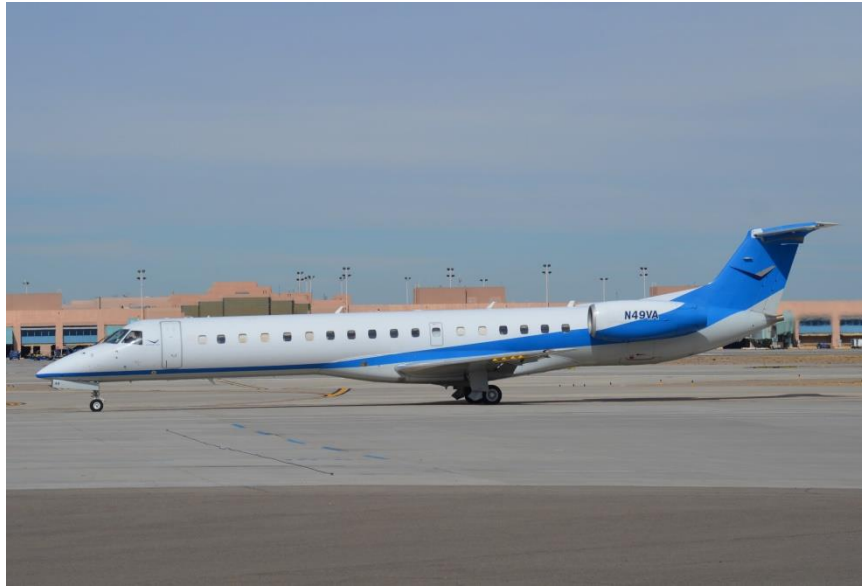
October 13, 2022 - This Victory Air Embraer-145 arrived at Cutter Aviation, just south of the Albuquerque Sunport, on February 25, 2022 for a charter flight.