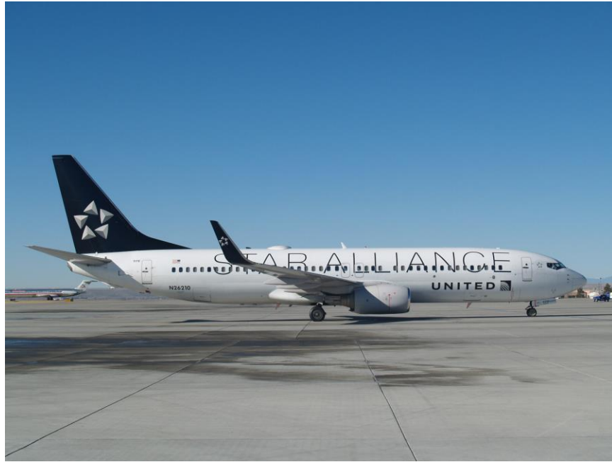
November 18, 2022 - United Airlines Boeing 737-800, N26210, in the Star Alliance livery, is ready to taxi after pushback from the gate at the Albuquerque Sunport on December 27, 2013.