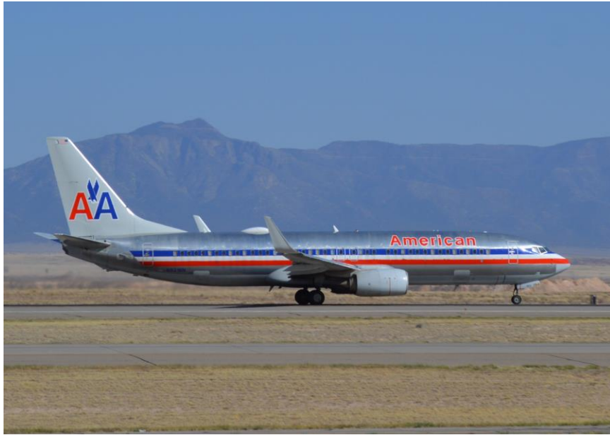
December 20, 2022 - This Boeing 737-800, N921NN, currently wears the retro livery that was used by American Airlines from 1968 through 2013. It was captured departing on runway 21 at the Albuquerque Sunport on April 28, 2022.