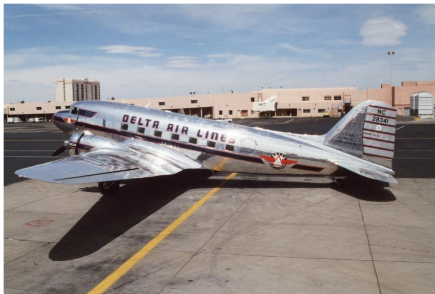
October 11, 2022 - Delta Airlines vintage Douglas DC-3 stops at the Albuquerque Sunport in 2002.