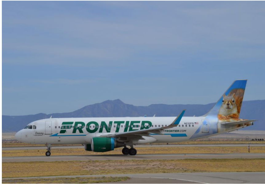
November 8, 2022 - This Frontier Airlines A320, N232FR, featuring “Sammy” the squirrel, is seen taxiing to the ramp at the Albuquerque Sunport on April 11, 2018.