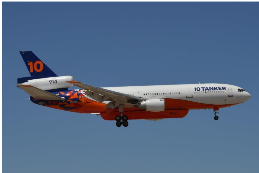
August 22, 2022 - 10 Tanker Air's DC-10 comes in for a landing at the Sunport on May 13, 2022.