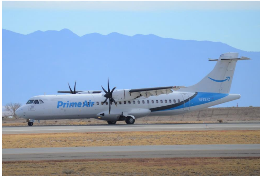
August 22, 2022 - This Amazon Prime Air ATR-72-500 is also a frequent visitor to Albuquerque. This plane was photographed on Dec. 23, 2021.