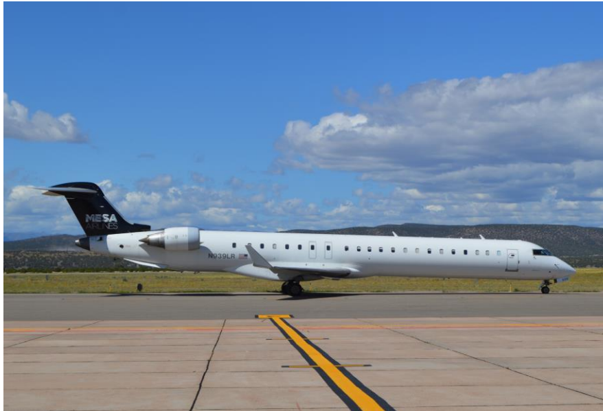
November 12, 2022 - This Mesa Airlines Canadair CRJ-900, N939LR, operating for American Eagle, taxis to the gate after arriving at the Santa Fe County Regional Airport on September 27, 2019.