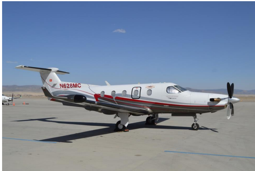
August 22, 2022 - This Native Air Ambulance Pilatus PC-12 was photographed May 20, 2022 at Atlantic Aviation south of the Sunport.