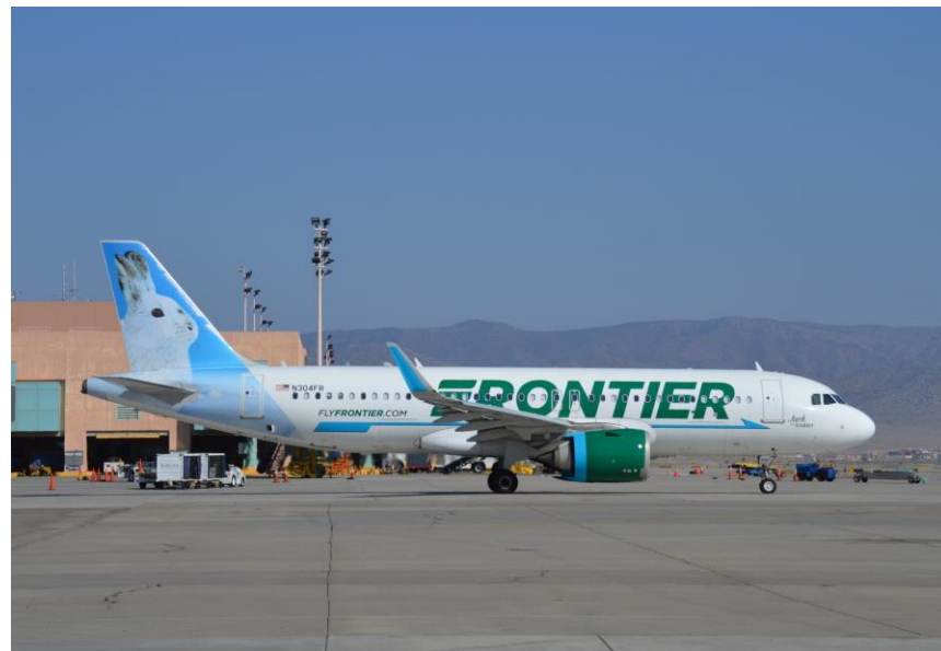
November 8, 2022 - This Frontier Airlines Airbus A320neo, N304FR, featuring “Jack” the rabbit is seen taxiing for takeoff at the Albuquerque Sunport on October 4, 2020.