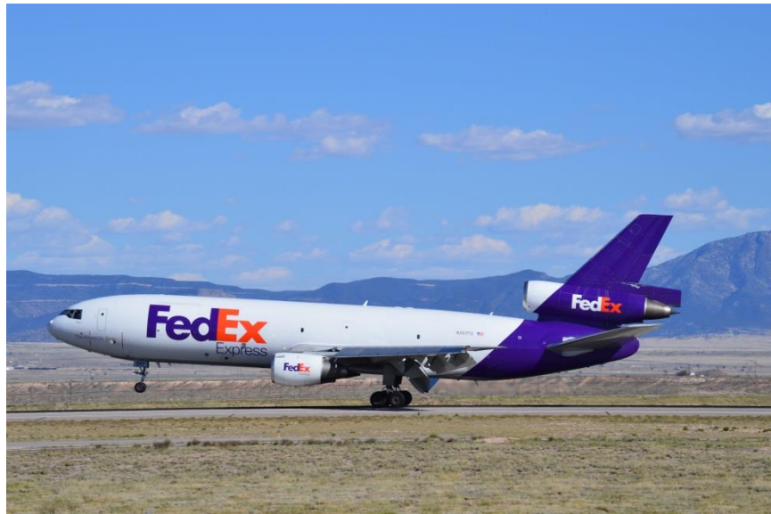
October 21, 2022 - This FedEx McDonnell Douglas DC-10-10, N567FE, lands on runway 03 at the Albuquerque Sunport on April 30, 2015.