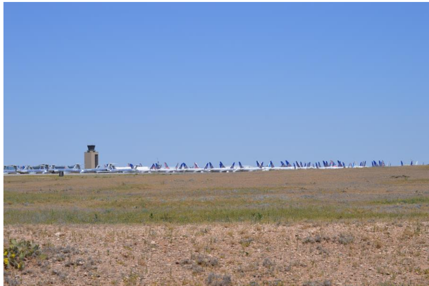
November 21, 2022 - A mix of American and United Airlines aircraft that were ferried to the Roswell International Air Center are in storage because of the COVID-19 Pandemic. Approximately 350 planes from United, American, and Frontier Airlines were stored at Roswell New Mexico from March 2020 until the year 2021 when they were called back into service.