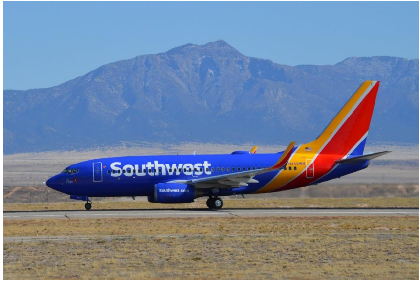
October 27, 2022 - This Southwest Airlines Boeing 737-700, N443WN, is taking off on runway 03 at the Albuquerque Sunport on March 30, 2018.