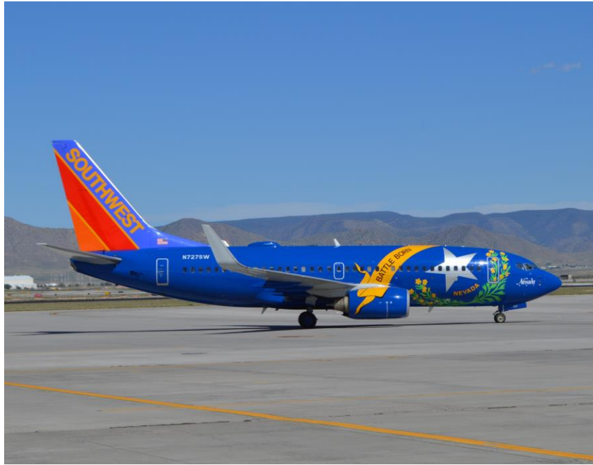
December 8, 2022 - This Southwest Airlines Boeing 737-700, N727SW, the “Nevada One,” wearing the special livery commemorating the great State of Nevada, is taxiing for immediate departure from the Albuquerque Sunport on May 28, 2015.