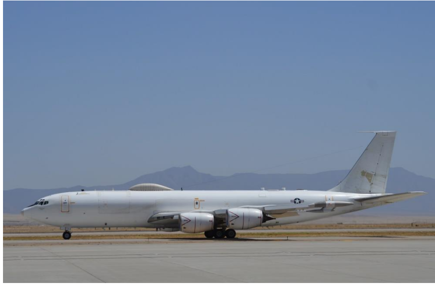
September 29, 2022 - This US Navy E-6B Mercury taxis after arriving at Kirtland Air Force Base in Albuquerque on May 1, 2022.