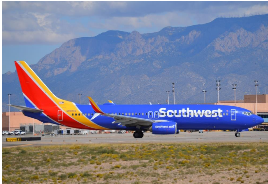
October 27, 2022 - This Southwest Airlines Boeing 737-800, N8504G, is taxiing into position for takeoff on runway 08 at the Albuquerque Sunport on October 3, 2021.