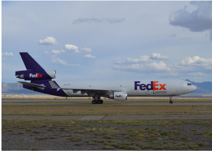
October 21, 2022 - This FedEx McDonnell Douglas MD-11, N617FE, taxis to the airfreight terminal at the Albuquerque Sunport after landing on runway 03 on July 26, 2017.