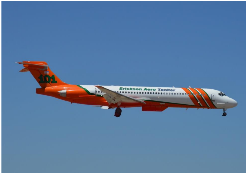
August 22, 2022 - This Erickson Aero Tanker MD-87 comes in for a landing on May 13, 2022. This aircraft was based at the Sunport for several weeks.