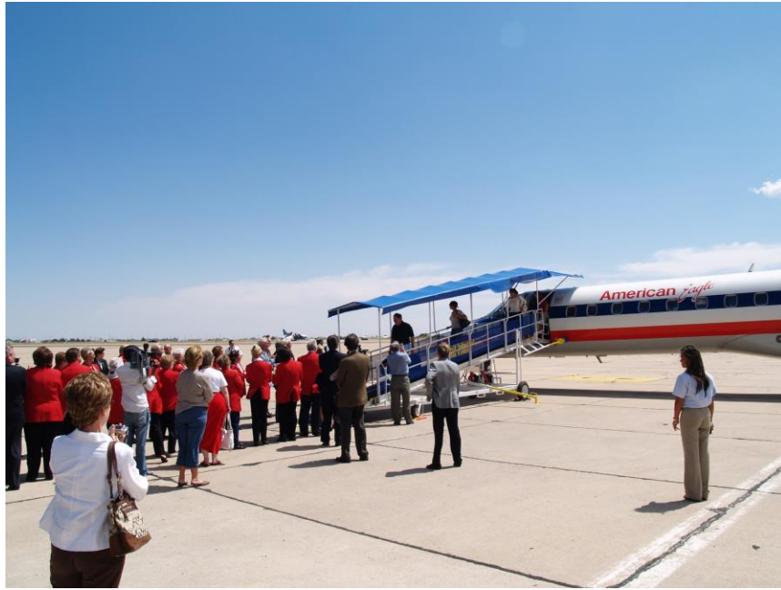
November 19, 2022 - Passengers arriving on American Eagle's inaugural flight into Roswell New Mexico received a warm welcome on September 5, 2007.