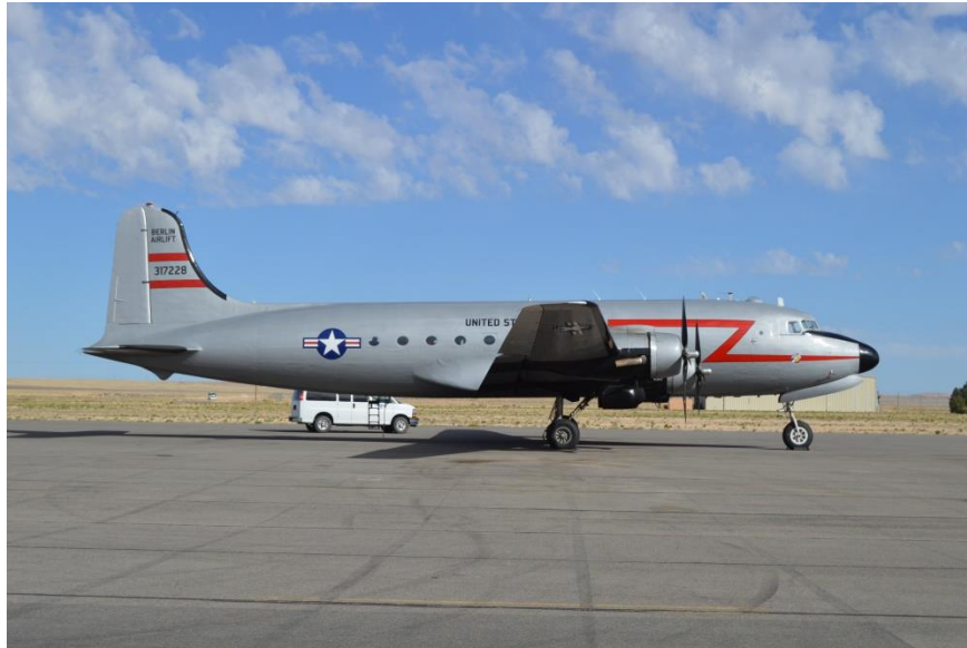
August 22, 2022 - This Berlin Airlift Historical Foundation's C-54 was photographed May 24, 2022 at the Albuquerque west side's Double Eagle II Airport.