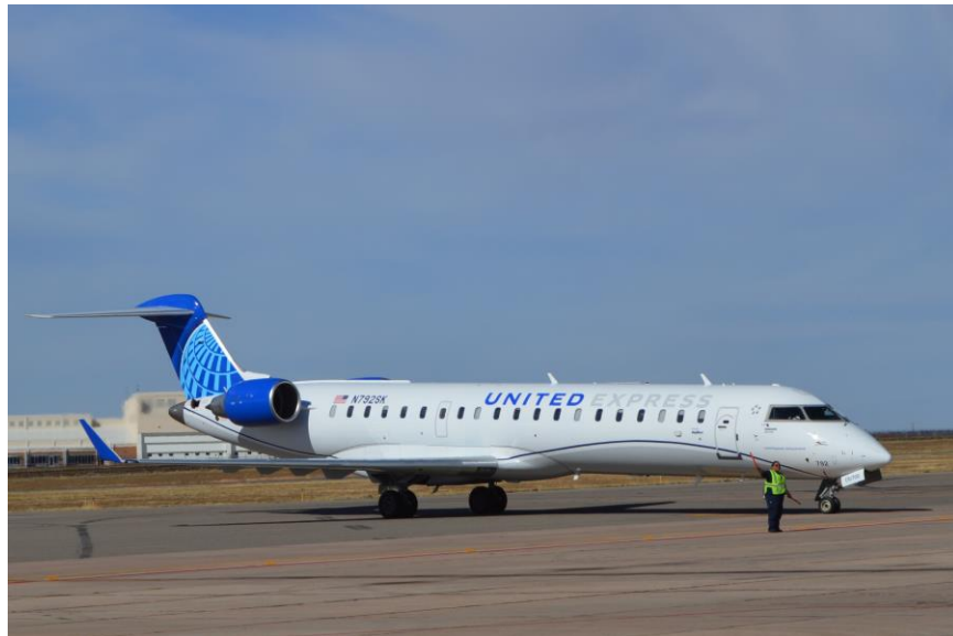
November 12, 2022 - This United Express Canadair CRJ-700, N792SK, operated by SkyWest, displays the latest livery for United Airlines as it taxis to the gate at the Santa Fe County Regional Airport on October 21, 2021.