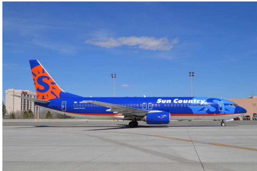
October 4, 2022 - This Sun Country Airlines Boeing 737-800 approaches the gate at the Albuquerque Sunport on March 14, 2016 to pick up passengers for a charter flight to Laughlin Nevada.