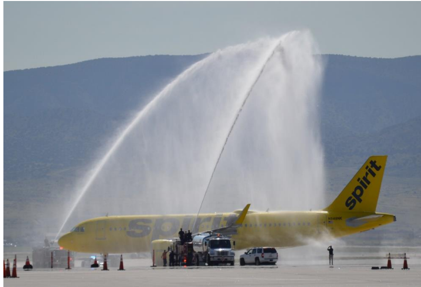
August 22, 2022 - The arrival of Spirit Airlines Airbus A320neo, N948NK, getting a customary “water cannon salute” while pulling up to the gate at the Albuquerque Sunport on August 3, 2022. This begins daily round trip service to Las Vegas, Nevada.