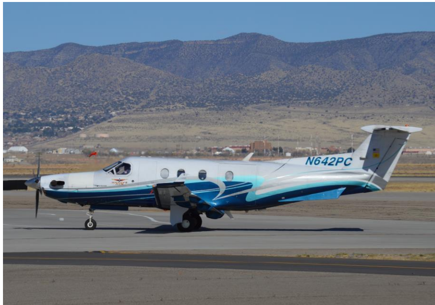
November 27, 2022 - This Pilatus PC-12, N642PC, operated by Air Methods for Native Air, an air ambulance company serving New Mexico and surrounding states, is seen arriving at the Albuquerque Sunport on April 2, 2022.