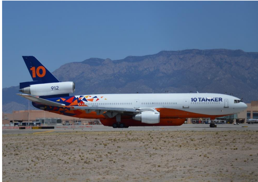
August 22, 2022 - 10 Tanker Air's DC-10 taxis at the Sunport on May 13, 2022. 10 Tanker Air and four out of state air tanker companies spent several weeks fighting New Mexico's Calf Canyon/Hermits Peak forest fires among others.