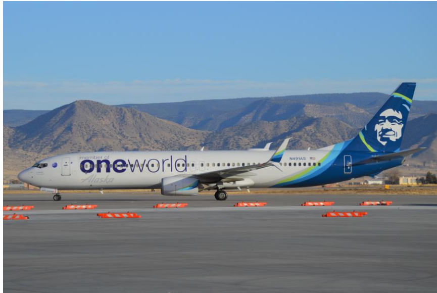
November 25, 2022 - This Alaska Airlines Boeing 737-900ER, N491AS, with a special livery indicating that Alaska is also a member of the OneWorld global alliance along with American Airlines, was captured taxiing to the gate at the Albuquerque Sunport on November 23, 2022.