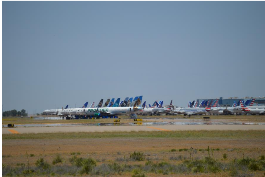
November 21, 2022 - A group of Frontier Airlines Airbus A320 and 321XLR planes on the left and a mix of American and United Airlines planes on the right in COVID-19 storage at the Roswell International Air Center on May 5, 2020.