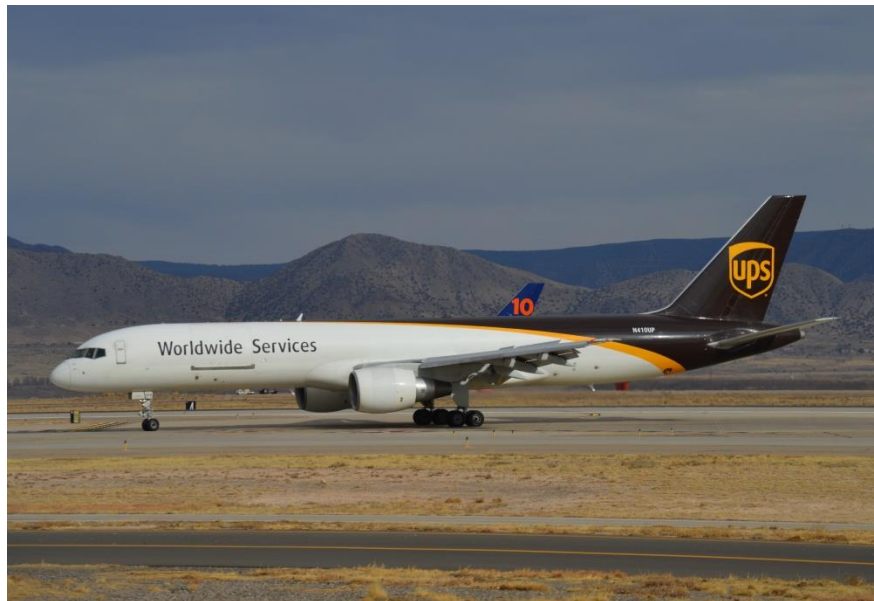
October 21, 2022 - This UPS Boeing 757-200, N410UP, is exiting runway 03 after landing at the Albuquerque Sunport on March 3, 2022. UPS currently operates seven departures per day from the Albuquerque Sunport on weekdays to cities such as Louisville, Kentucky, San Bernardino, California, and El Paso, Texas.