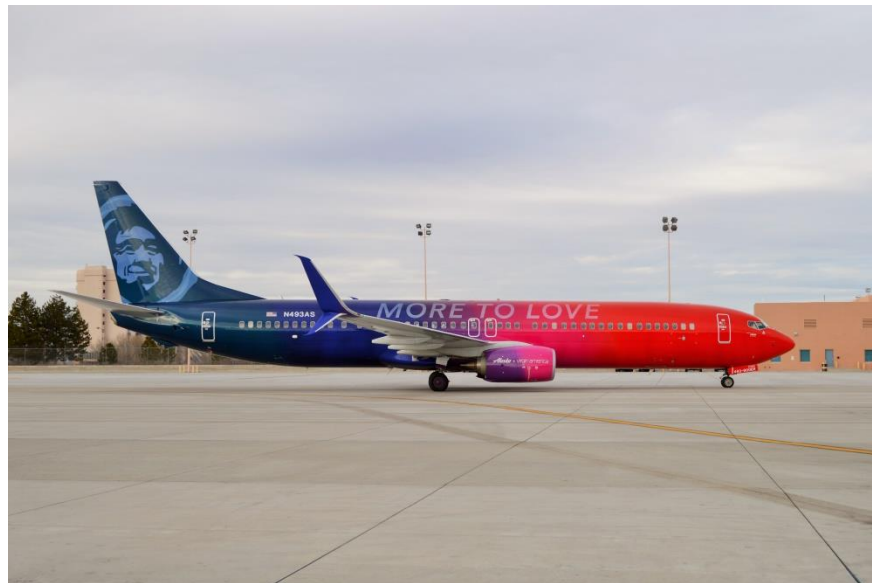
October 11, 2022 - Alaska Airlines Boeing 737-900 with a special livery commemorating the merger between Alaska and Virgin America, taxis to the gate at the Albuquerque Sunport on January 22, 2017.