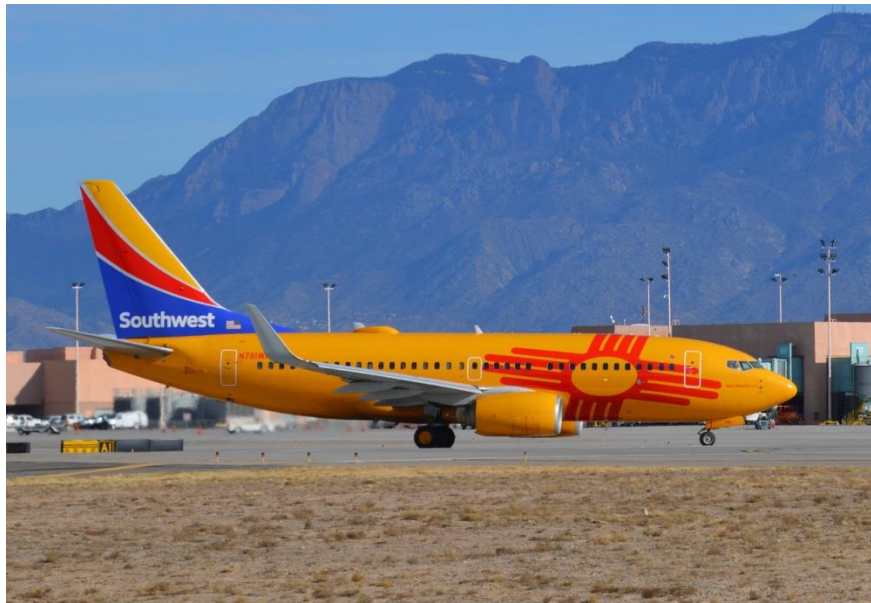
October 11, 2022 - This Southwest Airlines Boeing 737-700 N781WN “New Mexico One “ displays the newest tail livery for Southwest as it prepares to depart on runway 08 at the Albuquerque Sunport on January 3, 2022.