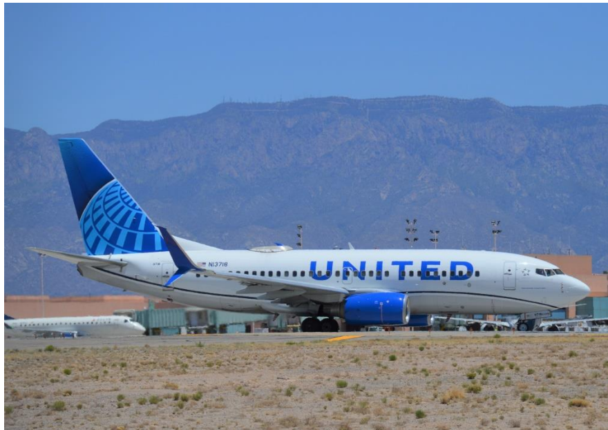
October 29, 2022 - This United Airlines Boeing 737-700, N13718, moves into position for takeoff on runway 08 at the Albuquerque Sunport on May 25, 2022.