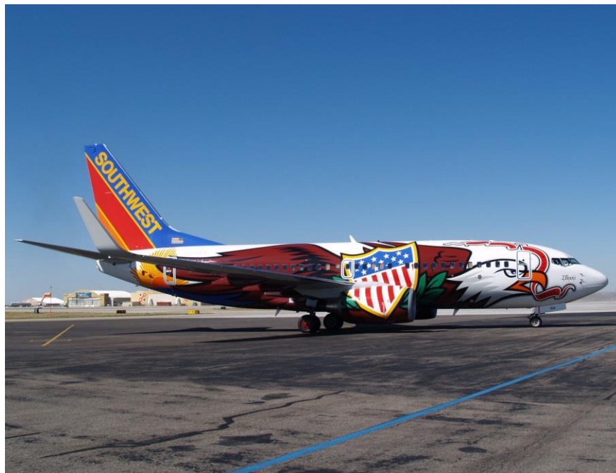
December 8, 2022 - This Southwest Airlines Boeing 737-700, N918WN, the “Illinois One,” in a livery commemorating the great State of Illinois, is seen taxiing for immediate takeoff from the Albuquerque Sunport on September 4, 2008.