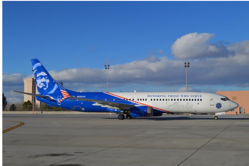
October 23, 2022 - This Alaska Airlines Boeing 737-900ER, N265AK, painted in tribute to "Honoring Those Who Served", taxis to the gate after arriving at the Albuquerque Sunport on Christmas Day, December 25, 2016.