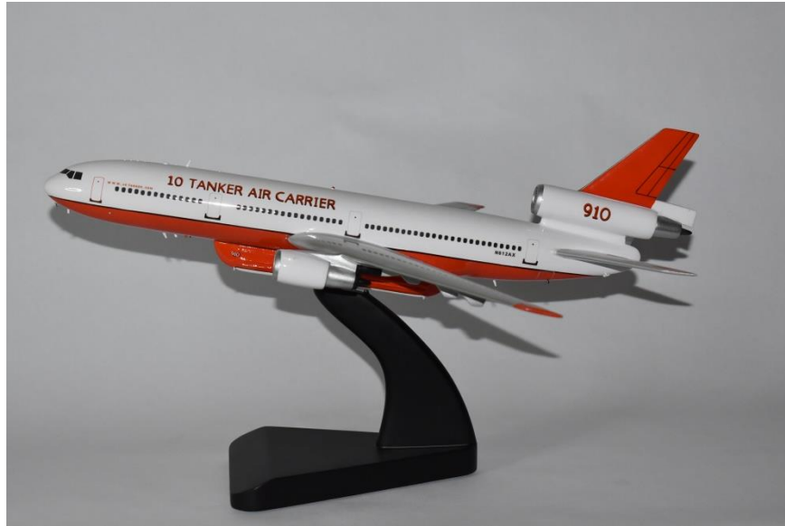
August 22, 2022 - Another view of the 10 Tanker Air donated model with original livery.