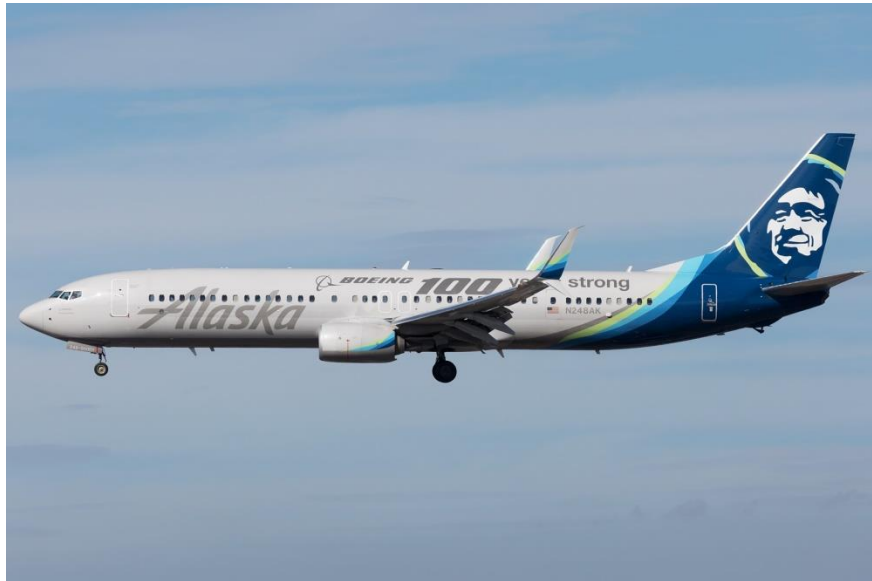
October 10, 2022 - Alaska Airlines Boeing 737-900ER Boeing 100 Years livery arrives at the Albuquerque Sunport on May 30, 2018.