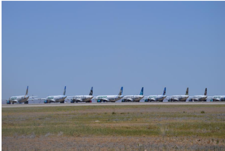
November 21, 2022 - A row of Frontier Airlines Airbus A320 and 321 Zoo planes being stored at the Roswell International Air Center during the COVID-19 shutdown are seen on May 5, 2020.