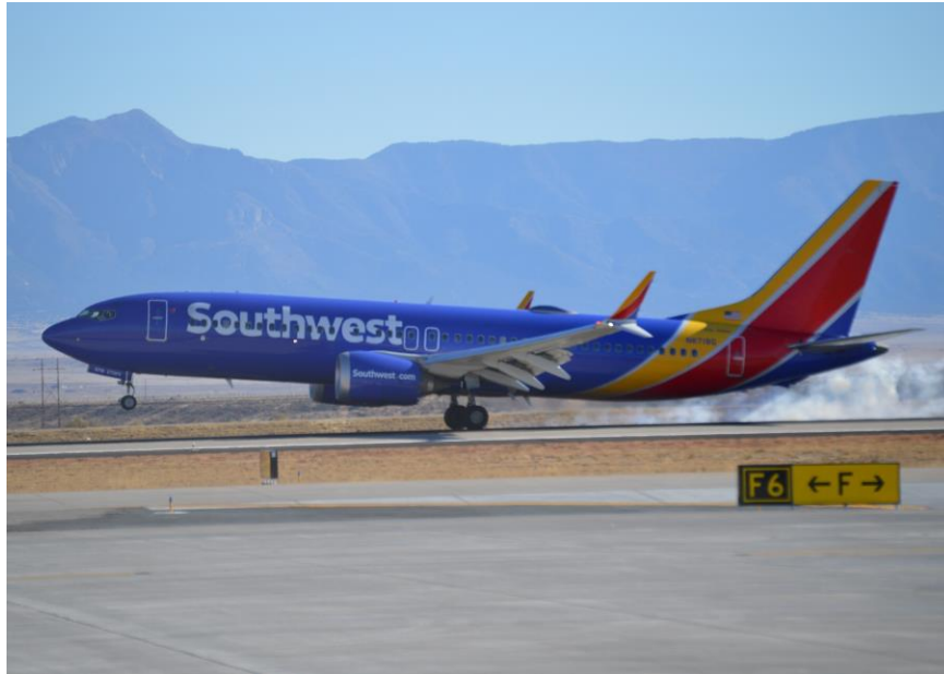
December 9, 2022 - Southwest Airlines Boeing 737-8 MAX, N8718Q, smokes its tires after touching down on runway 03 at the Albuquerque Sunport after a flight from Las Vegas, Nevada on December 8, 2022.