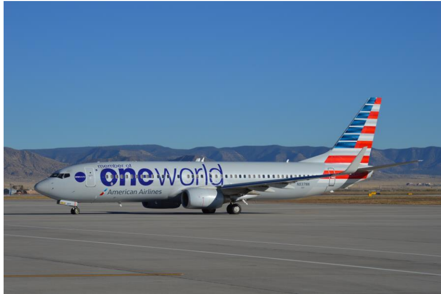
November 18, 2022 - American Airlines Boeing 737-800, N837NN, in a special Oneworld alliance livery departing the gate after pushback at the Albuquerque Sunport on November 14, 2016.