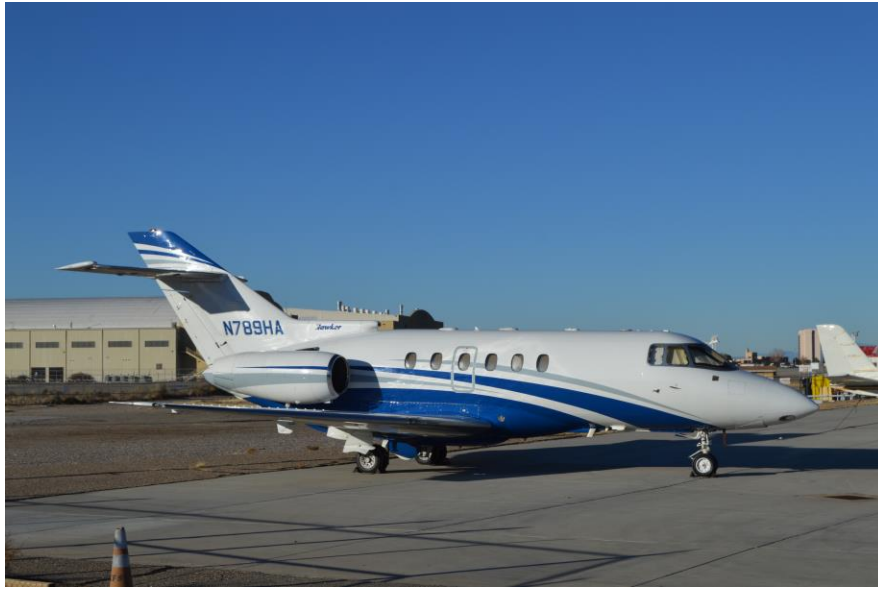
December 28, 2022 - This Hawker 800XP, N789HA, is owned by LMN Aircraft Leasing and is seen parked on the General Aviation ramp at the Albuquerque Sunport on December 17, 2022.