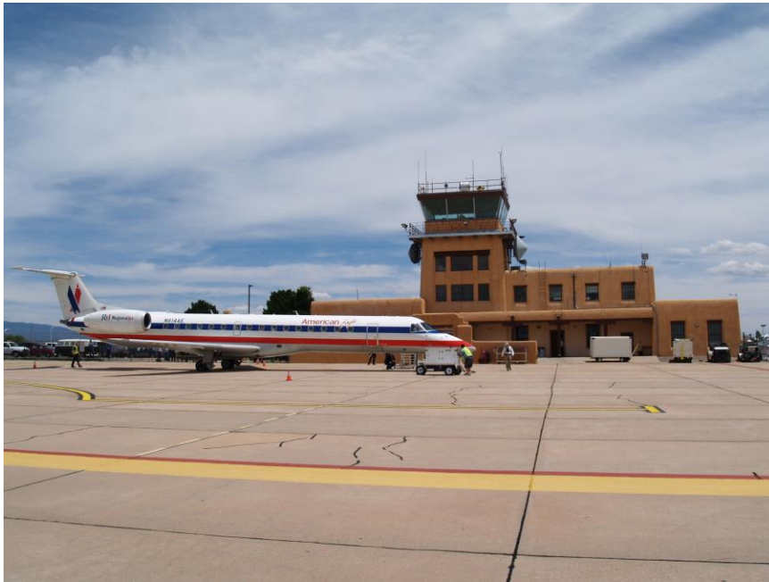
November 10, 2022 - The inaugural American Eagle flight to Santa Fe New Mexico began on June 11, 2009 with an Embraer-145, N614AE. It is seen here parked at the gate at the Santa Fe County Regional Airport after arriving from Dallas/Fort Worth, Texas. Cavalcade of Wings documents the aviation history at all New Mexico regional airports in addition to the Albuquerque International Sunport.