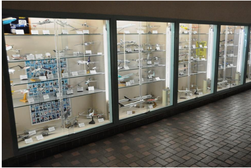
August 21, 2022 - Current display of aircraft models at the Albuquerque International Sunport