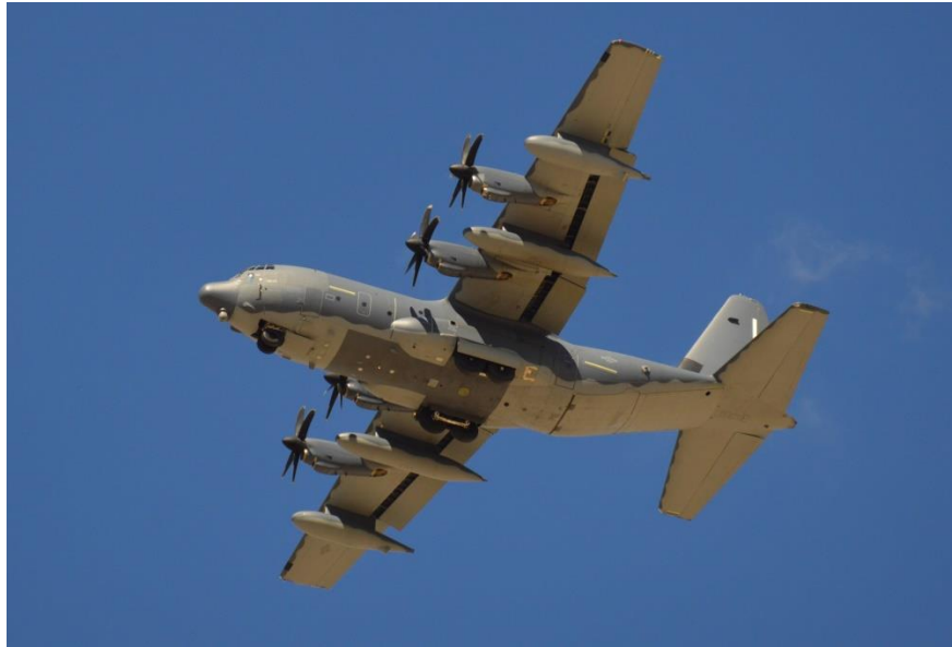
October 31, 2022 - This USAF MC-130J, Commando II, 16-5839, is seen departing from Kirtland Air Force Base on September 21, 2022. This aircraft is assigned to the 415th Special Operations Squadron as part of the 58th Special Operations Wing at Kirtland AFB.