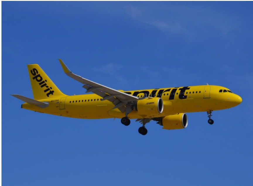
September 23, 2022 - Spirit Airlines Airbus A320neo on arrival to the Albuquerque Sunport on August 12, 2022.