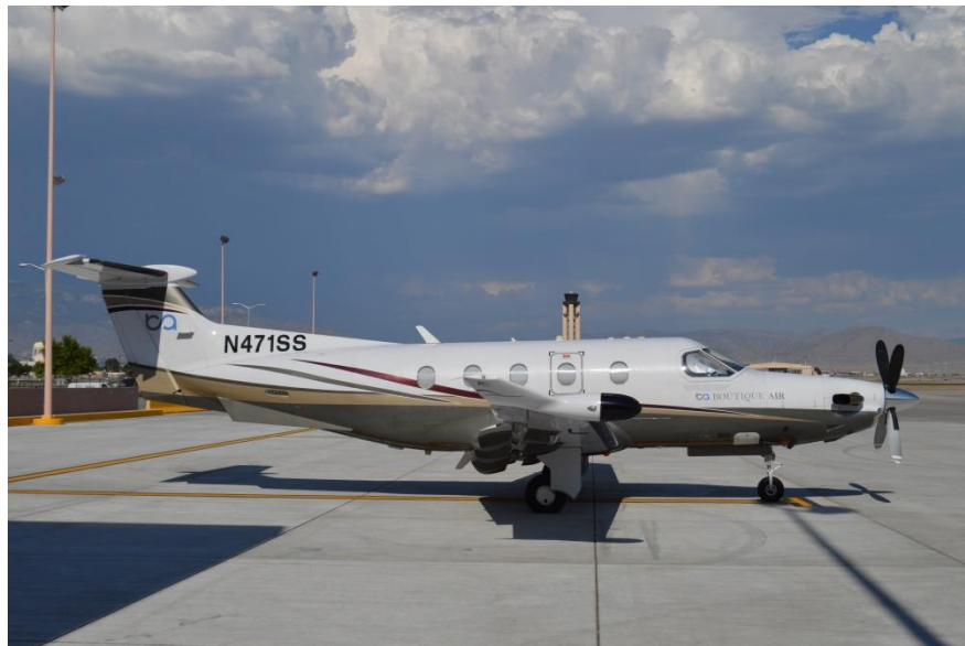
October 18, 2022 - Boutique Air Pilatus PC-12, N471SS, at the Albuquerque Sunport commuter gate before departing to Carlsbad, New Mexico on June 22, 2016. Boutique Air has a government contract to provide regular service for Carlsbad under the Essential Air Service (EAS) program.