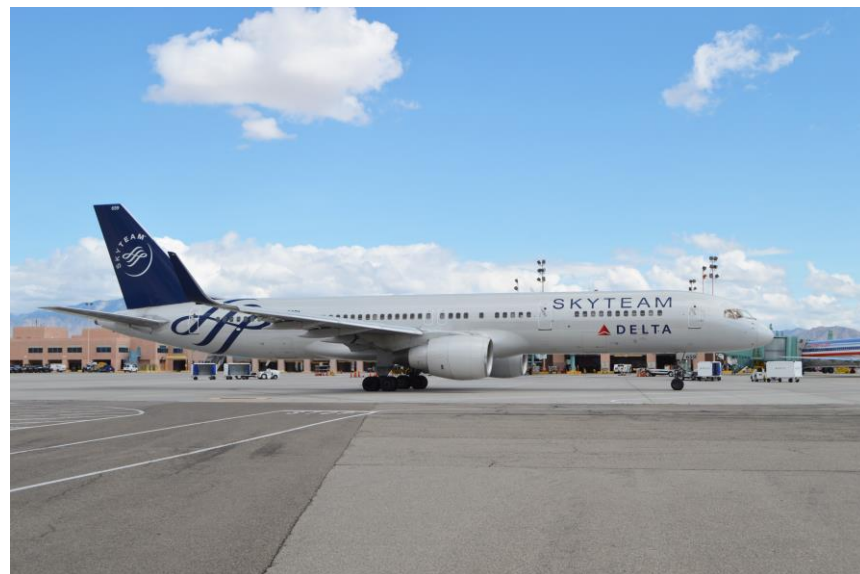
November 18, 2022 - Delta Airlines Boeing 757-200, N659DL, in the SkyTeam alliance livery, departs the gate at the Albuquerque Sunport on October 9, 2015. This aircraft has since been painted over in the standard Delta livery.