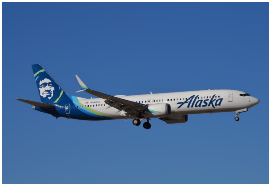
November 30, 2022 - This Alaska Airlines Boeing 737-9 Max, N949AK, is seen landing on runway 08 at the Albuquerque Sunport on November 12, 2022.