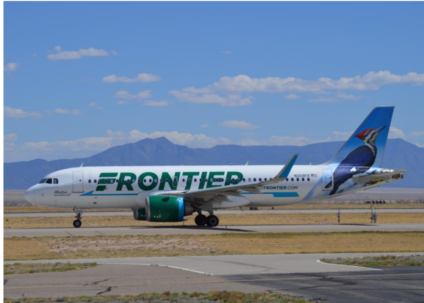
November 8, 2022 - This Frontier Airlines Airbus A320neo, N309FR featuring “Weston” the woodpecker is seen taxiing to the ramp at the Albuquerque Sunport on April 23, 2018.