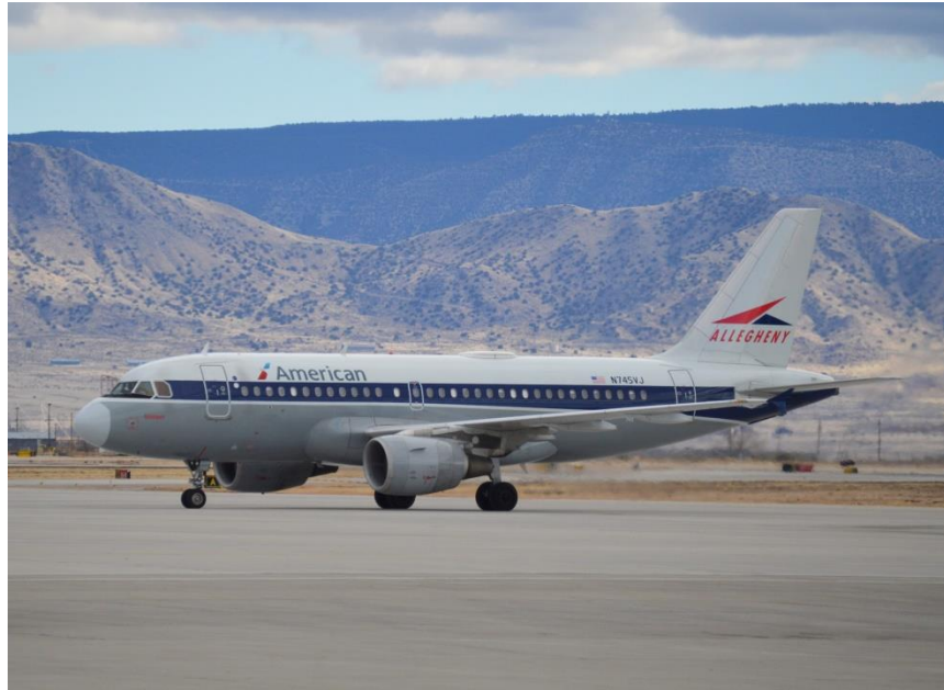
October 11, 2022 - American Airlines Airbus A319 with a special Allegheny Airlines livery. American merged with US Airways in 2015 which was formally Allegheny Airlines. This aircraft was taxiing to the gate at the Albuquerque Sunport on December 14, 2019.