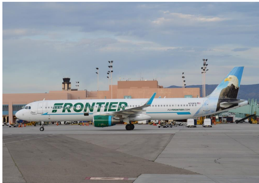
October 11, 2022 - This Frontier Airlines Airbus A321, N709FR, featuring “Steve” the eagle, taxis to the gate after arriving at the Albuquerque Sunport on June 7, 2019.