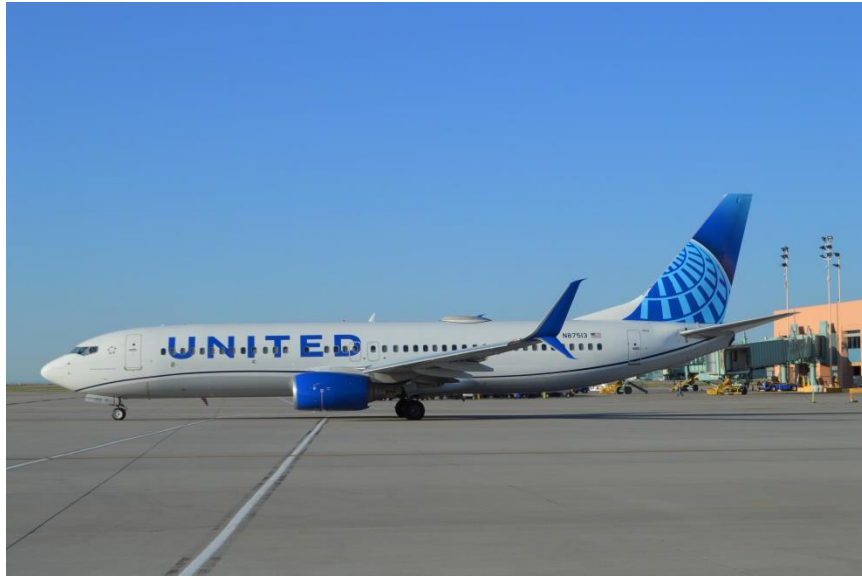
October 29, 2022 - This United Airlines Boeing 737-800, N87513, departs from the gate at the Albuquerque Sunport on July 17, 2022.