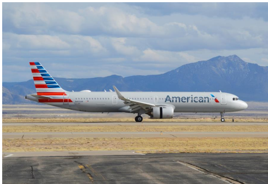
November 4, 2022 - This American Airlines Airbus A321neo, N400AN, is landing on runway 21 at the Albuquerque Sunport on March 10, 2019. This aircraft was the first A321neo to land at the Sunport.