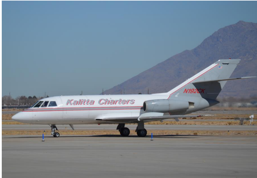
November 4, 2022 - This Kalitta Charters Dassault Falcon Mystere 20D, N192CK, is seen taxiing to the ramp at the Albuquerque Sunport on February 14, 2022.