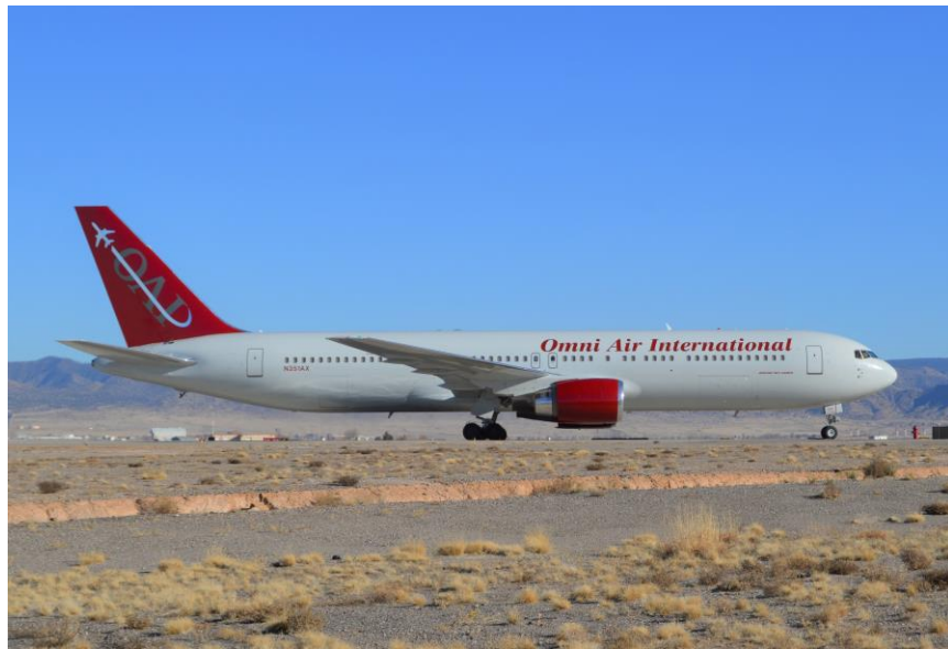
November 4, 2022 - This Omni Air International Boeing 767-300, N351AX, is taxiing to the ramp at the Albuquerque Sunport on December 21, 2019.