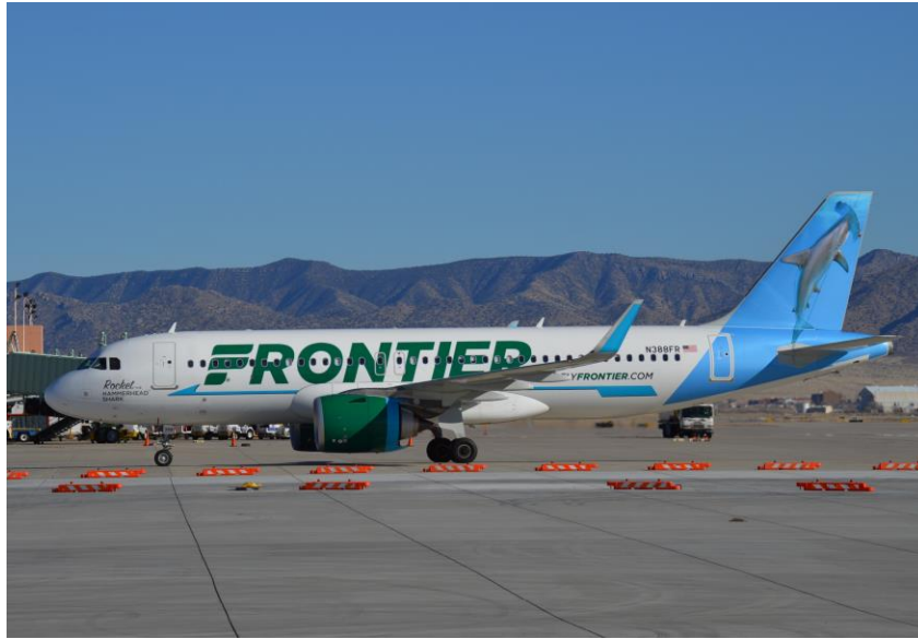
December 9, 2022 - Frontier Airlines Airbus A320neo, N388FR, featuring “Rocket” the Hammerhead Shark, is seen taxiing to the gate at the Albuquerque Sunport after arriving from Las Vegas, Nevada on December 8, 2022.