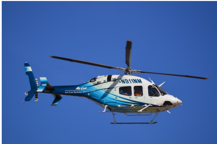
November 27, 2022 - This Bell 429 helicopter, N911NM, operated by Air Methods for the San Juan Regional Medical Center in Farmington, New Mexico, is seen lifting off from the Albuquerque Sunport on November 20, 2020.