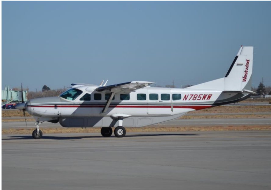
December 12, 2022 - This Westwind Air Service Cessna 208B Grand Caravan, N785WW, is seen taxiing in after landing at the Albuquerque Sunport on November 25, 2020. Westwind Air Service, based in Phoenix Arizona, provided extra lift to Las Cruces New Mexico for South Aero during the holiday rush of 2020.