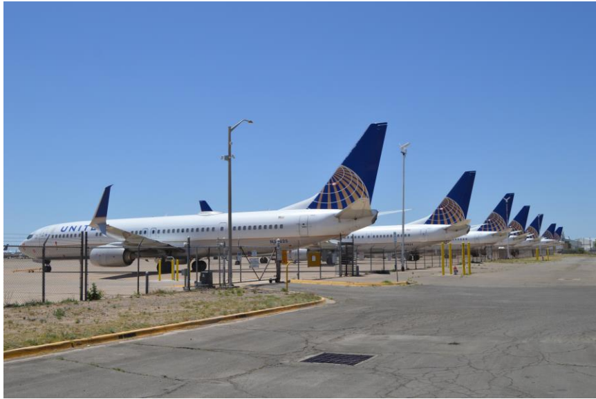
November 21, 2022 - A row of United Airlines Boeing 737-900's and Airbus A320's are in COVID-19 storage at the Roswell International Air Center on May 5, 2020.