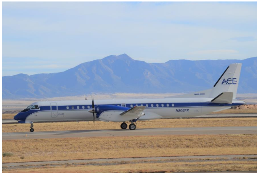
December 28, 2022 - This Air Charter Express (ACE) Saab 2000, N508FR, is seen taxiing to the Cutter ramp at the Albuquerque Sunport after landing on runway 21 on December 27, 2022.