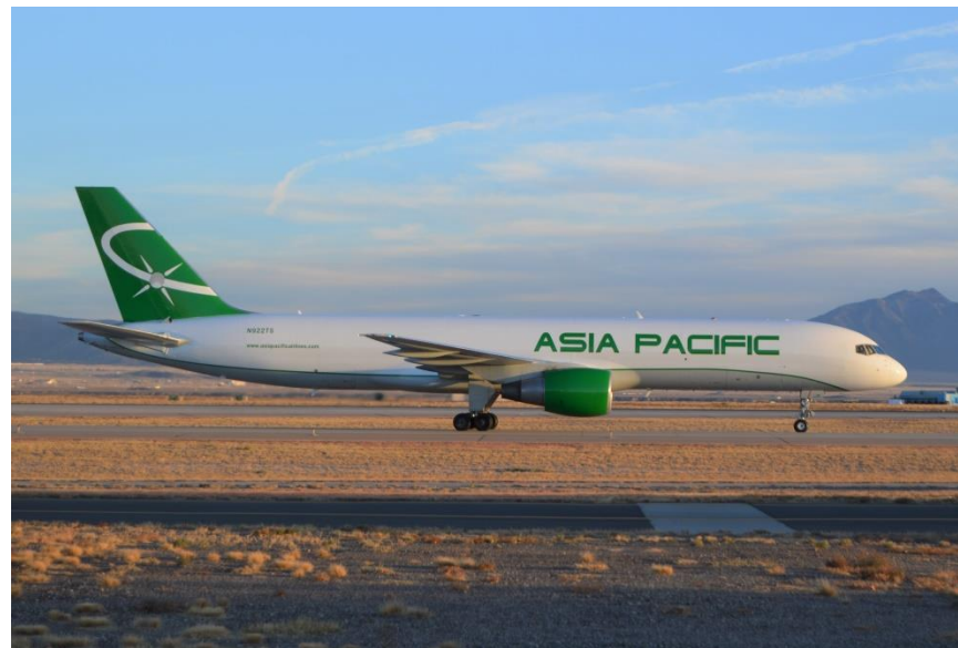
August 22, 2022 - This Asia Pacific Boeing 757-200 was photographed at the Sunport on Dec. 1, 2021. It was here supporting UPS for the holiday season.