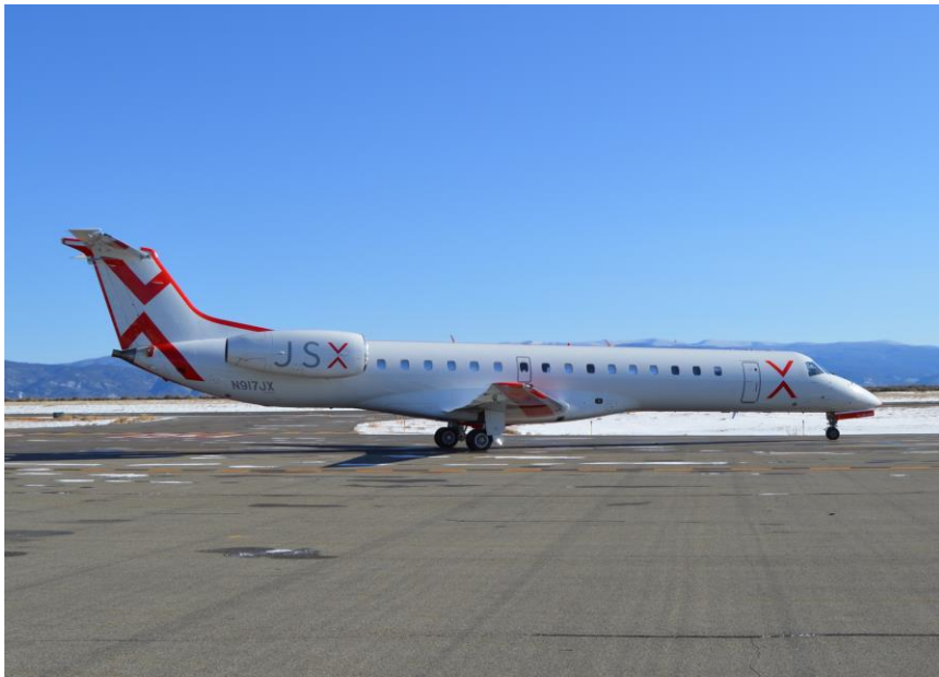
December 17, 2022 - JSX's Embraer 145, N917JX, taxis to runway 31 at the Taos Regional Airport in New Mexico for departure to Dallas, Texas on December 16, 2022.