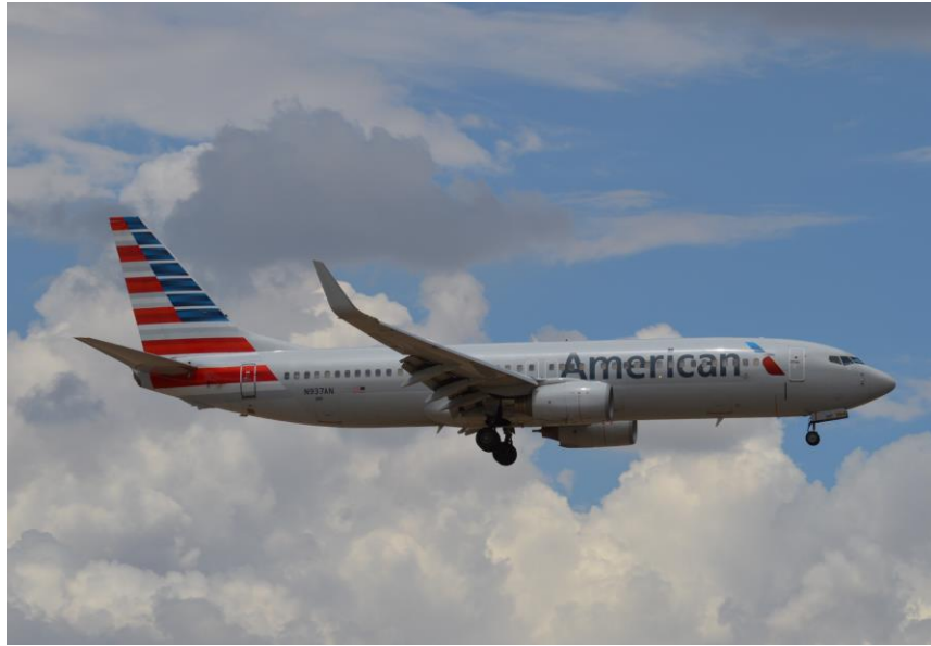
November 30, 2022 - American Airlines Boeing 737-800, N937AN, is preparing to land on runway 08 at the Albuquerque Sunport on July, 26, 2020.