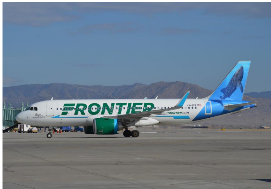
November 16, 2022 - Frontier Airlines Airbus A320neo, N342FR, featuring “Baja” the whale shark, is taxiing to the gate after arriving at the Albuquerque Sunport on February 18, 2020.