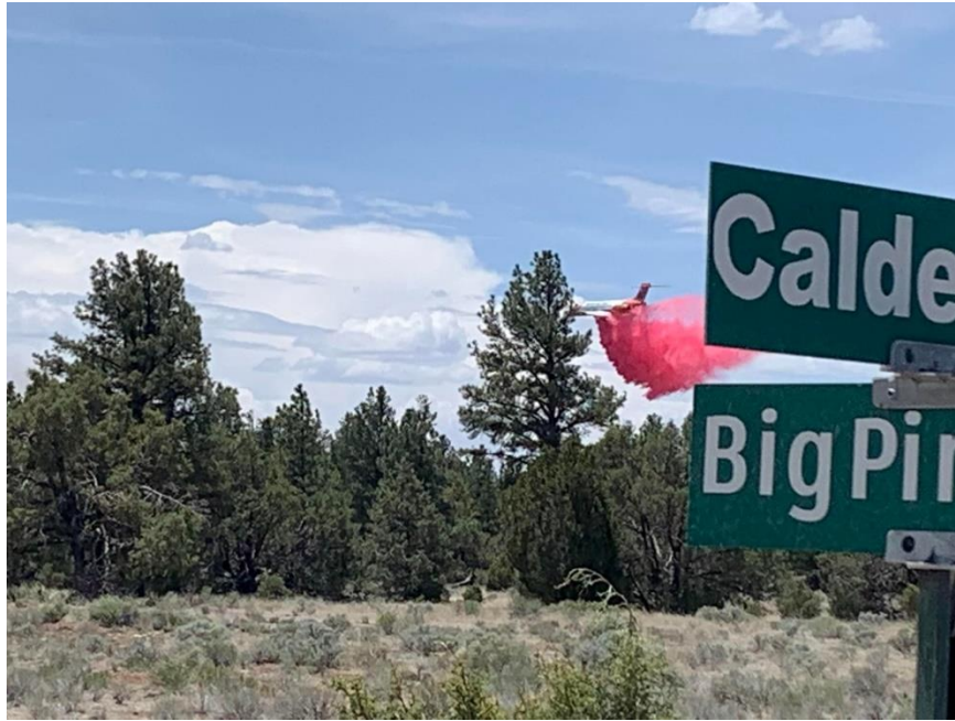
August 22, 2022 - An Erickson Aero Tanker MD-87 drops a slurry load on the Cerro Banderero forest fire sometime between June 9 - 14, 2022.