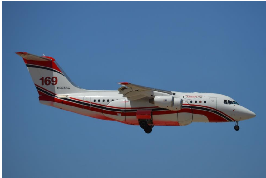
August 22, 2022 - This Aero-Flite Type I AVRO RJ85 (aka: BAe-146-200) air tanker comes in for a landing at the Sunport on May 13, 2022.