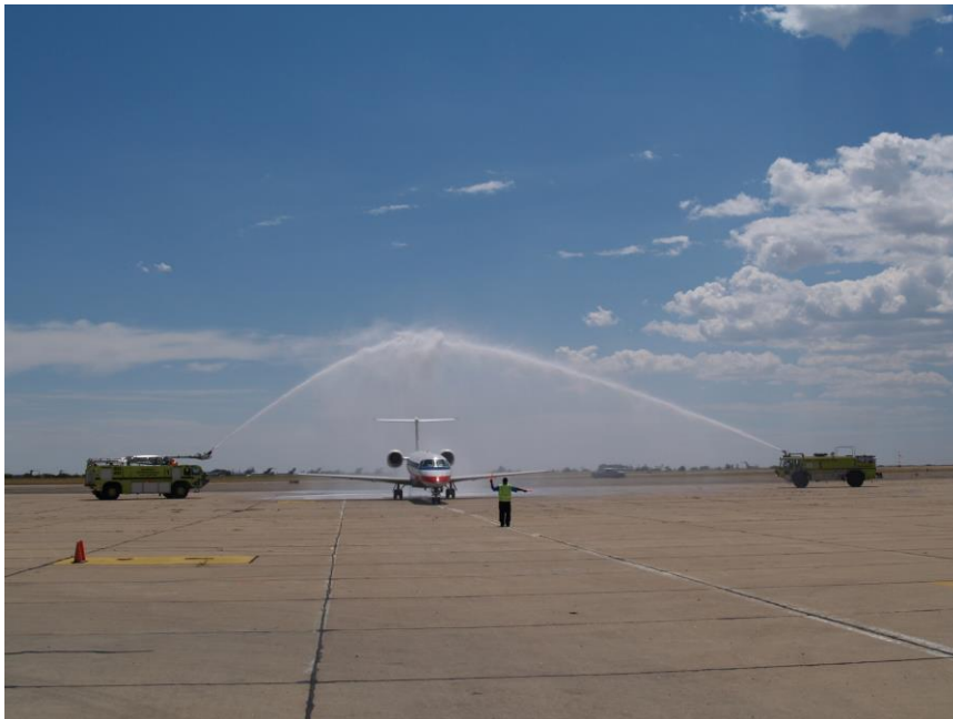
November 19, 2022 - American Eagle Embraer-145, N693AE, arrives on its inaugural flight to the Roswell International Air Center from Dallas/Ft Worth and receives a water cannon welcome on September 5, 2007.