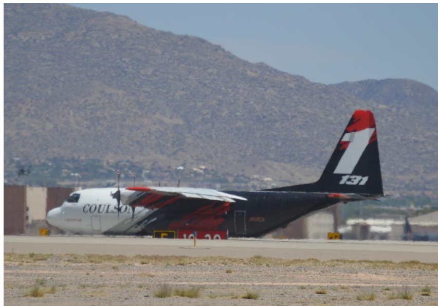
August 22, 2022 - This Coulson Aviation C-130 Hercules air tanker was in Albuquerque fighting record forest fires this summer. This plane was photographed on May 13, 2022.