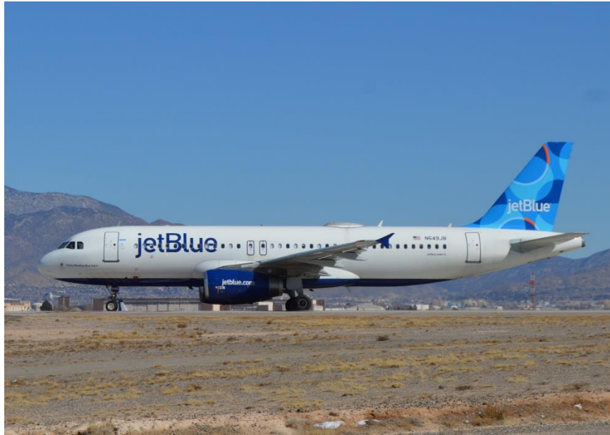
October 11, 2022 - This JetBlue Airbus A320 N649JB taxis to runway 08 for departure from the Albuquerque Sunport on February 18, 2022.