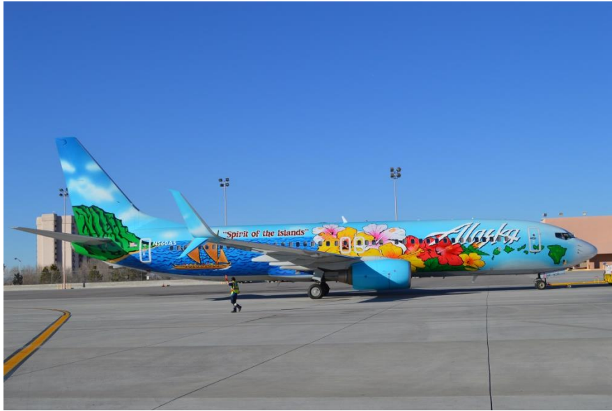
October 25, 2022 - This Alaska Airlines Boeing 737-800, N560AS, "The Spirit of the Islands", has a special paint scheme commemorating the extensive service to the Hawaiian Islands, with each side a different livery. This photo shows the right side of the plane as it pushes back from the gate to depart the Albuquerque Sunport on February 2, 2015.