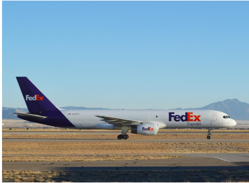
October 21, 2022 - This FedEx Boeing 757-200, N958FD, taxis to the airfreight terminal after landing at the Albuquerque Sunport on December 13, 2017.