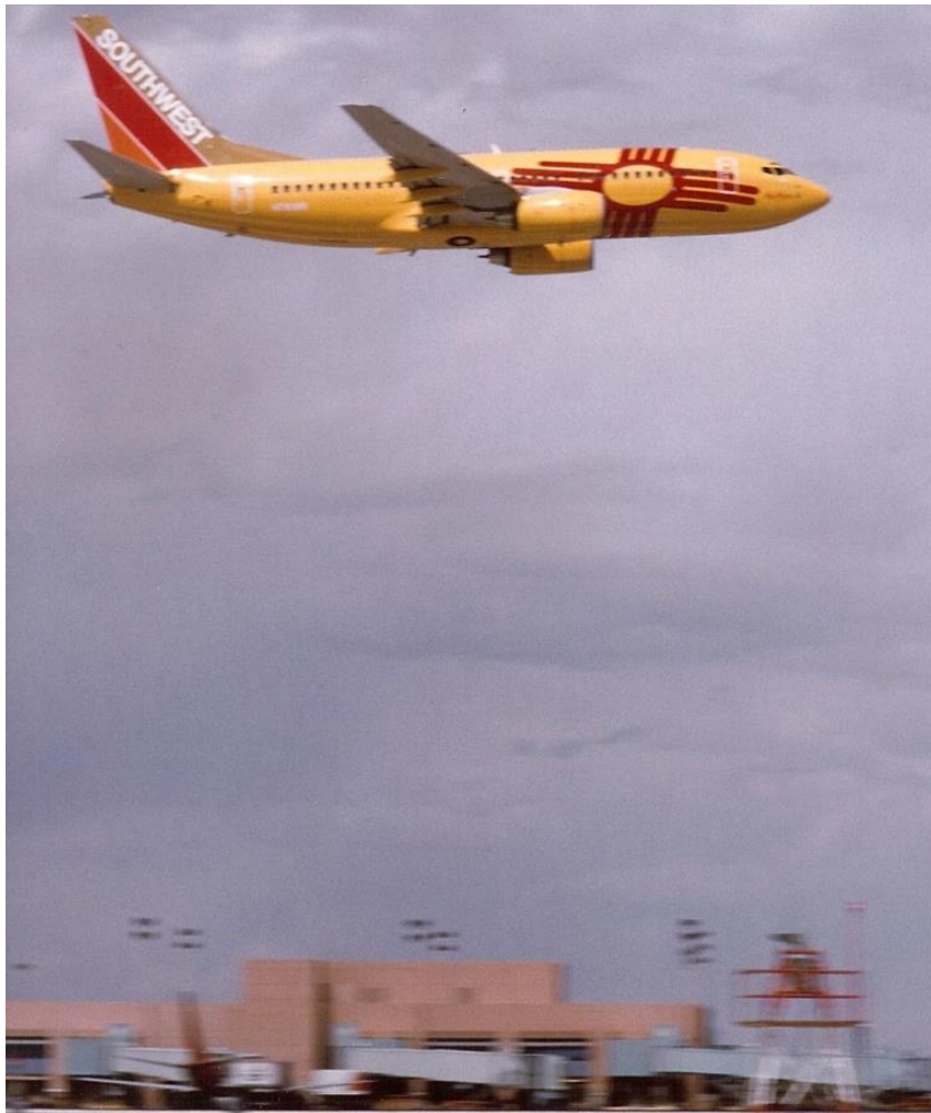
October 10, 2022 - Southwest Airlines New Mexico One preforms a fly-by at the Albuquerque Sunport on September 18, 2000.