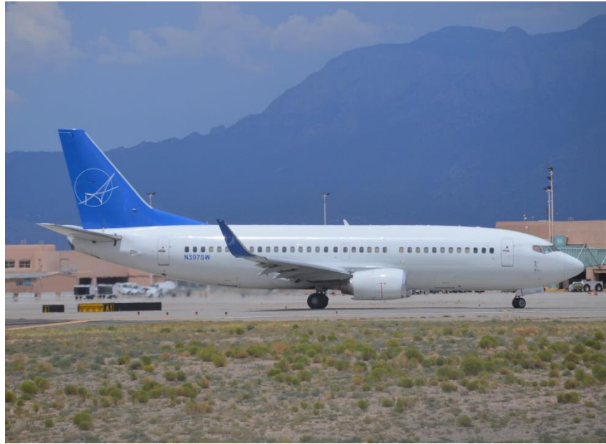
October 4, 2022 - This iAero Airways (formally Swift Air) Boeing 737-300 charter flight is ready for takeoff at the Albuquerque Sunport on July 26, 2020.