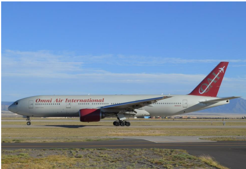
October 13, 2022 - This Omni Air International Boeing 777-200 landed on runway 3-21 at the Albuquerque Sunport on October 11, 2021 for a military charter flight.