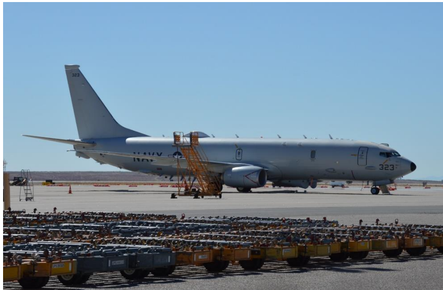
October 25, 2022 - This US Navy Boeing P-8A Poseidon, number 169323, is seen on the airfreight ramp at the Albuquerque Sunport on October 25, 2022.