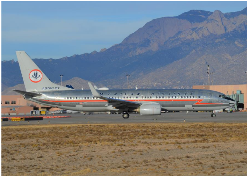
December 20, 2022 - This Boeing 737-800, N905NN, wears a retro livery of American Airlines worn in the 1960's. It is seen departing on runway 08 at the Albuquerque Sunport on December 22, 2021.