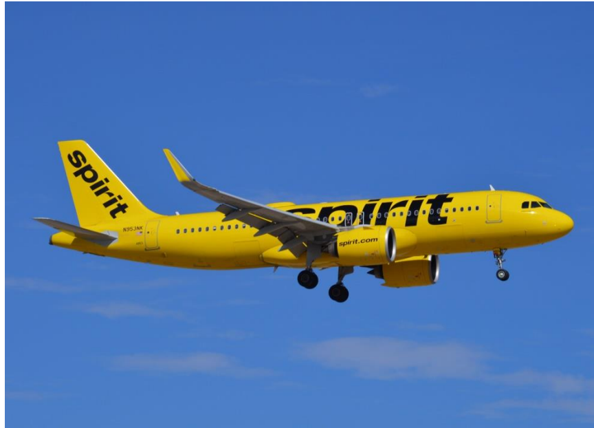
October 15, 2022 - This Spirit Airlines Airbus A320neo, N953NK, is seen on approach to runway 08 at the Albuquerque Sunport on October 15, 2022.