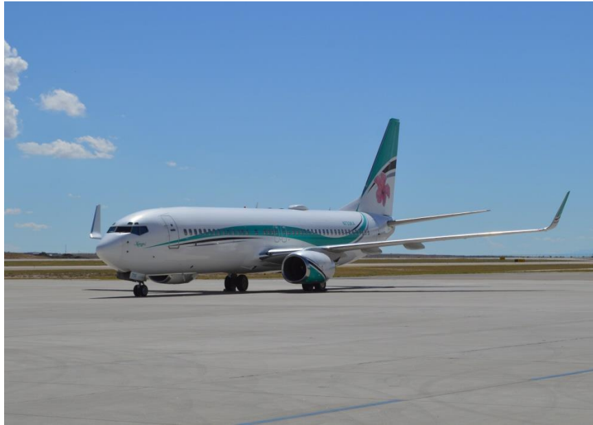
September 23, 2022 - Kaiser Air Boeing 737-800 N733KA arrived at Albuquerque's Atlantic Aviation on September 21, 2022, sat on the tarmac for about one hour, then departed back to Oakland, California.