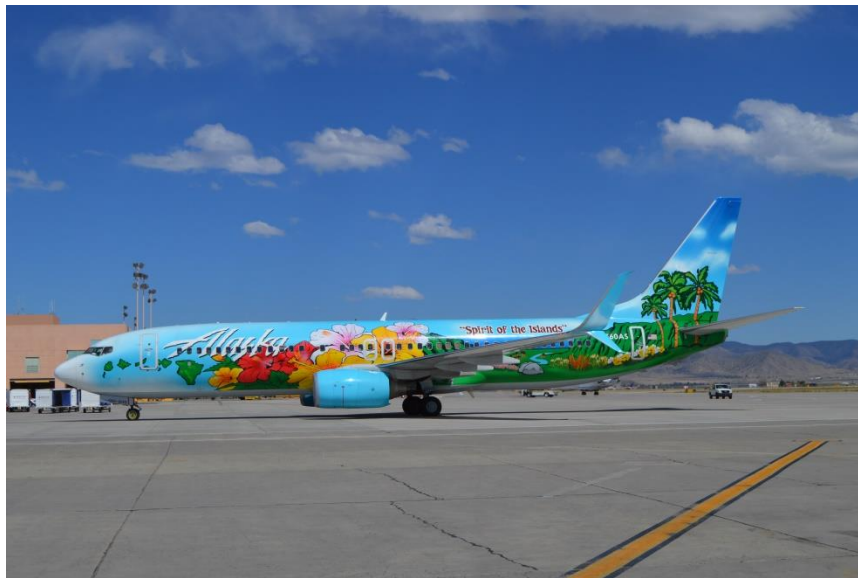
October 25, 2022 - This Alaska Airlines Boeing 737-800, N560AS, shows the left side livery of the "The Spirit of the Islands" as it taxis to the gate at the Albuquerque Sunport on May, 7, 2016.