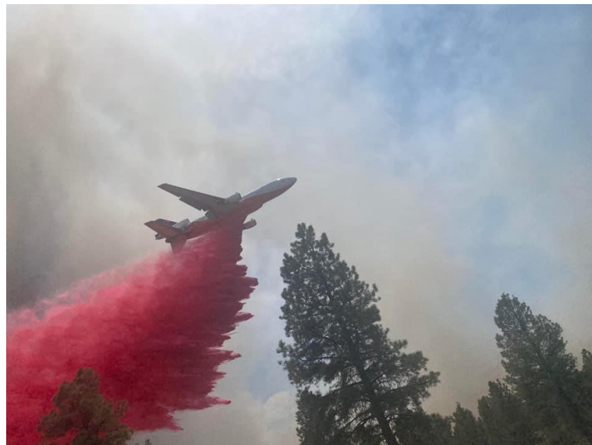
August 22, 2022 - A 10 Tanker Air DC-10 dropping slurry on the Cerro Bandero forest fire sometime between June 9-14, 2022.