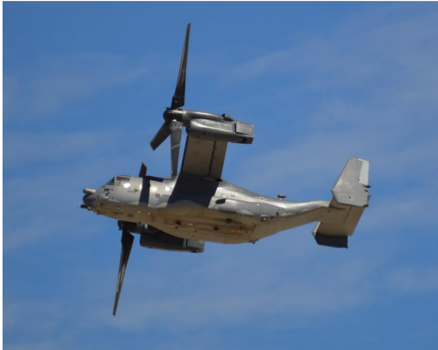
September 26, 2022 - A Bell Boeing CV-22 Osprey assigned to the 71st Special Operations Squadron takes off from Kirtland Air Force Base on September 21, 2022.