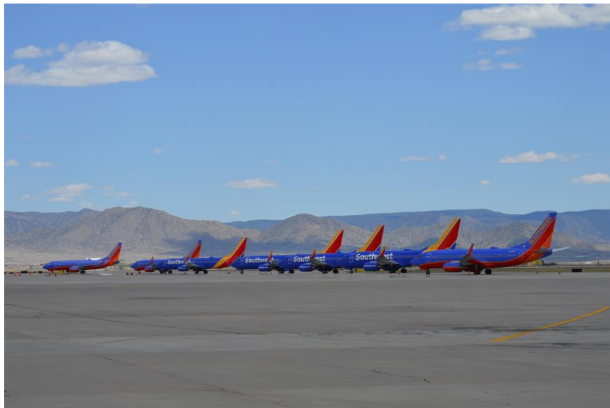
November 25, 2022 - Seven Southwest Airlines Boeing 737-700 and 800's were parked at the Albuquerque Sunport temporarily at the start of the COVID-19 pandemic on April 23, 2020.