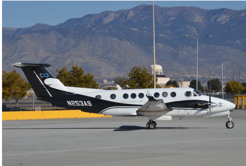
October 18, 2022 - This Boutique Air Beech 350 Super King Air, N253AS, sits at the Albuquerque Sunport's commuter gate on November 25, 2016.