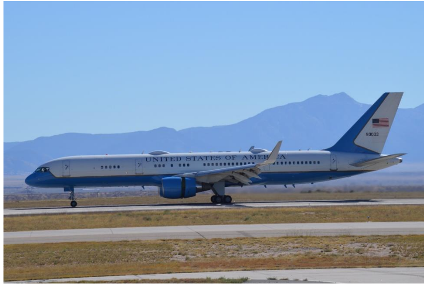
October 25, 2022 - Air Force Two, a Boeing C-32A (757-200), 90003, lands on runway 03 at the Albuquerque Sunport at 12:05pm on October 25, 2022 with Vice President Kamala Harris onboard before taxiing to Kirtland Air Force Base.