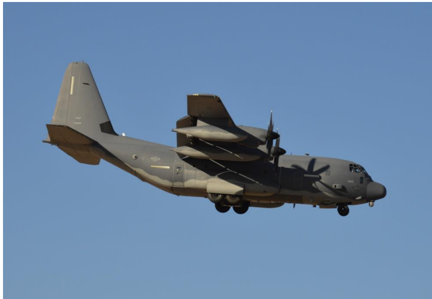
October 31, 2022 - A MC-130J, Commando II, 14-5805, is on approach to Kirtland Air Force Base on November 20, 2020. This aircraft is assigned to the 67th Special Operations Squadron at RAF Mildenhall, England.