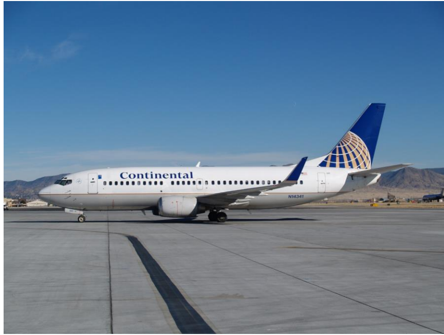
December 29, 2022 - This Continental Airlines Boeing 737-300, N14341, is seen here after pushback for departure from the Albuquerque Sunport on February 9, 2008.