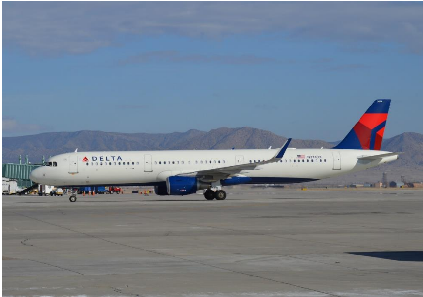
October 31, 2022 - A Delta Airlines Airbus A321, N374DX, taxis to the gate after arriving at the Albuquerque Sunport on February 18, 2020. Delta flies all A321's for its service from Albuquerque to Atlanta Georgia.