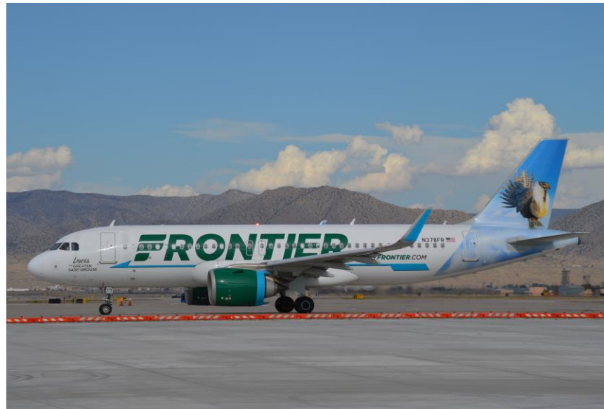
November 16, 2022 - Frontier Airlines Airbus A320neo, N378FR, featuring "Lewis" the greater sage-grouse, is seen taxiing to the gate after landing at the Albuquerque Sunport on June 23, 2022.