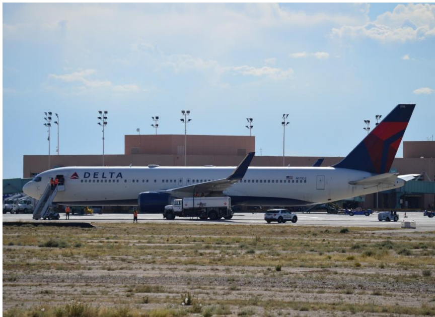
October 15, 2022 - This Delta Airlines Boeing 767-300, N171DZ, in route from Atlanta to Honolulu, was diverted to the Albuquerque Sunport on October 15, 2022.