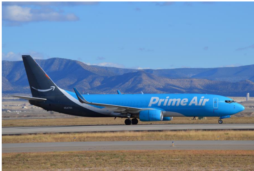
November 4, 2022 - Amazon Prime Air, operated by Sun County Airlines, made its inaugural service to Albuquerque on November 3, 2022. This Prime Air Boeing 737-800, N5474A, is taxiing to the new Amazon Air cargo facility at the Albuquerque Sunport on November 4, 2022.