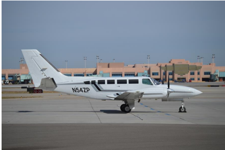
December 12, 2022 - South Aero's Cessna 404 Titan, N54ZP, is parked at the General Aviation facility at the Albuquerque Sunport on October 2, 2020.