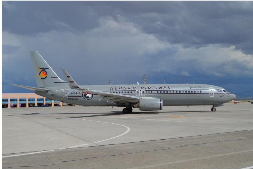
October 23, 2022 - This Alaska Airlines Boeing 737-800, N569AS, wears a livery worn by the airline in the 1940's, honoring Alaska's 75th anniversary that occurred in 2007. This aircraft, nicknamed Starliner 75, is seen departing the Albuquerque Sunport on August 10, 2015.