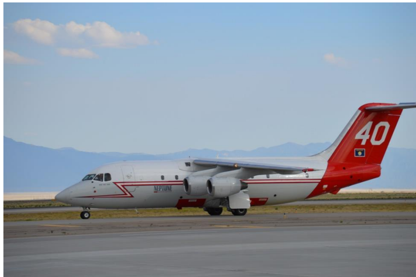
August 22, 2022 - This Neptune Aviation Services BAe-146-200 air tanker sits on the apron at the Sunport on May 13, 2022.