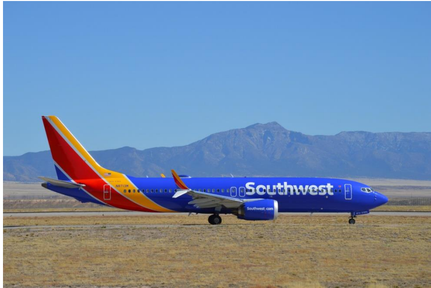
October 27, 2022 - This Southwest Airlines Boeing 737-8 Max, N8713M, is taxiing to runway 03 at the Albuquerque Sunport on March 30, 2018, shortly before all 737 Max aircraft were grounded for 18 months.