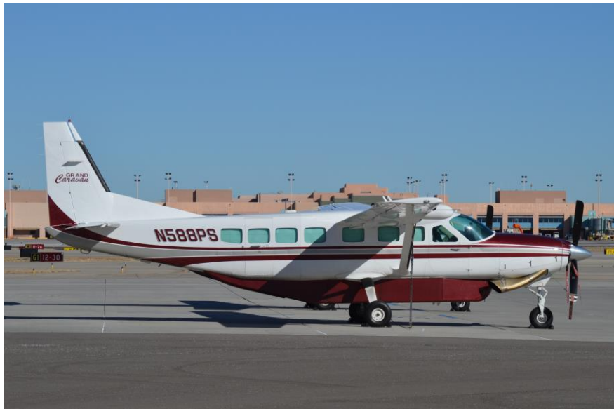
December 12, 2022 - This South Aero Cessna 208B Grand Caravan, N588PS, is parked at the General Aviation facility at the Albuquerque Sunport on February 8, 2020. South Aero is an Albuquerque based carrier that provides feeder service for UPS from outlying communities around New Mexico.