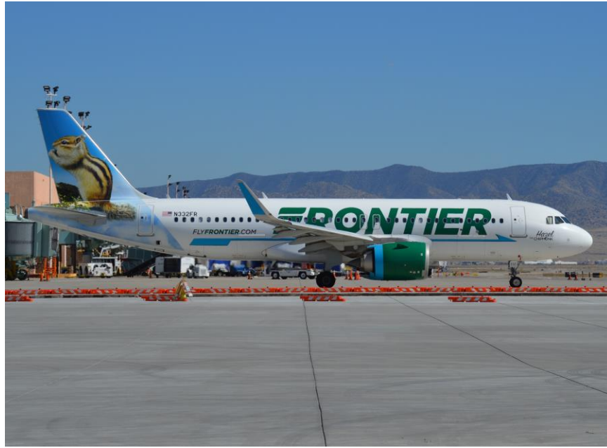
November 16, 2022 - Frontier Airlines Airbus A320neo, N332FR, featuring “Hazel” The chipmunk, is seen taxiing to the runway for takeoff from the Albuquerque Sunport on October 20, 2022.