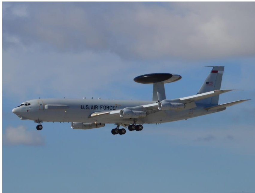
September 29, 2022 - A US Air Force E-3B Sentry on approach to land at Kirtland Air Force Base in Albuquerque on May 11, 2017. Kirtland receives hundreds of transient aircraft each year.