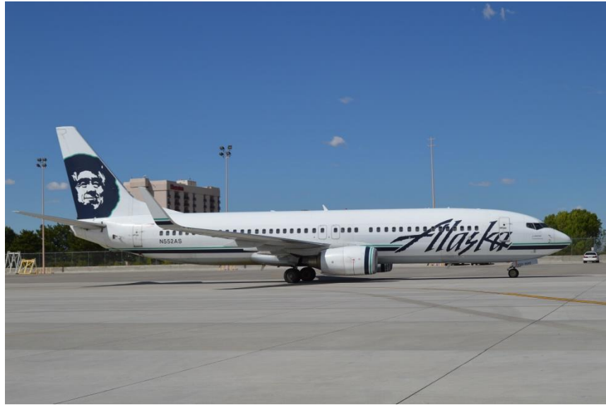
October 10, 2022 - Alaska Airlines Boeing 737-800 taxis after its inaugural flight to the Albuquerque Sunport from Seattle on September 18, 2014.