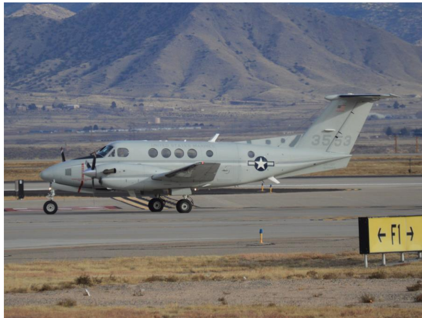
December 28, 2022 - This U.S. Marines Beechcraft UC-12F Huron Super King Air A200C, 163553, is captured exiting runway 21 after landing at the Albuquerque Sunport on December 27, 2022.