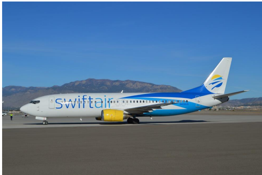
October 4, 2022 - This chartered Swift Air Boeing 737-400 taxis to Atlantic Aviation after arriving at the Albuquerque Sunport on October 23, 2017.