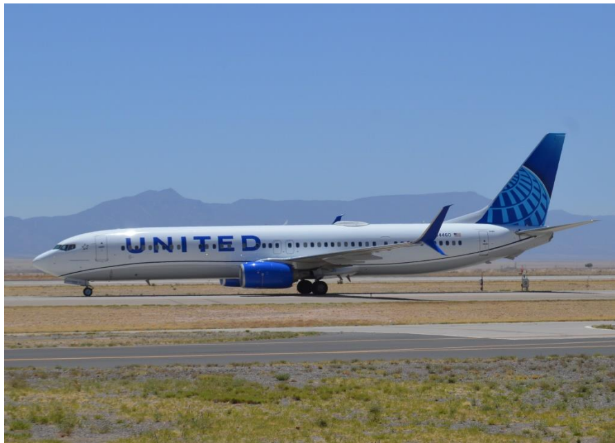
October 29, 2022 - This United Airlines Boeing 737-900, N34460, taxis to the gate after landing on runway 21 at the Albuquerque Sunport on May 31, 2022.