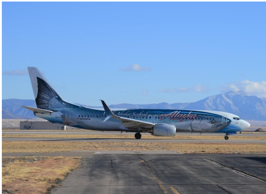
October 23, 2022 - This Alaska Airlines Boeing 737-800, N559AS, sports a salmon fish livery inspired when one of their aircraft hit a salmon dropped by an eagle while taking off from Juneau, Alaska in 1987. The aircraft, nicknamed salmon-thirty-salmon, is seen taxiing to runway 03 for takeoff at the Albuquerque Sunport on December 15, 2020.