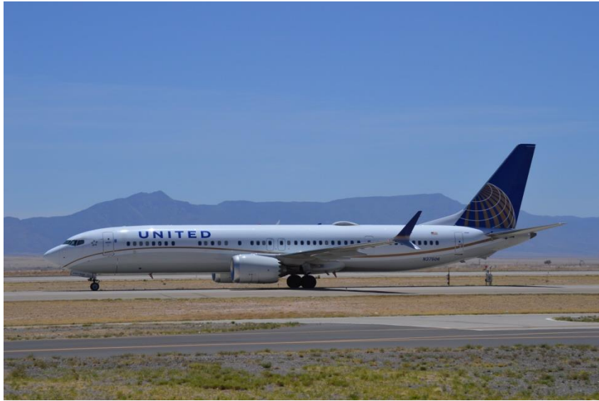
August 22, 2022 - This United Airlines Boeing 737-9 MAX arrives at the Albuquerque Sunport on May 20, 2022. This is this models first visit to Albuquerque with this livery.