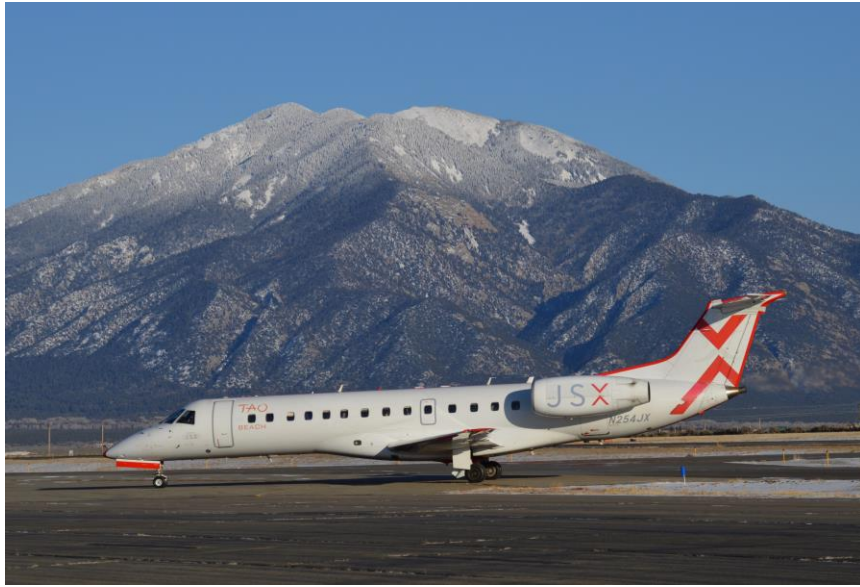
December 17, 2022 - This JSX Embraer 135, N254JX, is captured arriving at the Taos Regional Airport from San Diego, California on December 16, 2022 with the majestic Sangre de Cristo Mountains in the background.