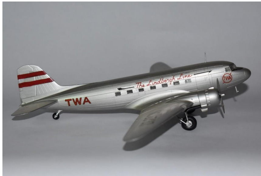
August 22, 2022 - This TWA DC-3 model was donated to CoW and placed on display July 29, 2022. TWA began flying this aircraft out of Albuquerque in 1936.