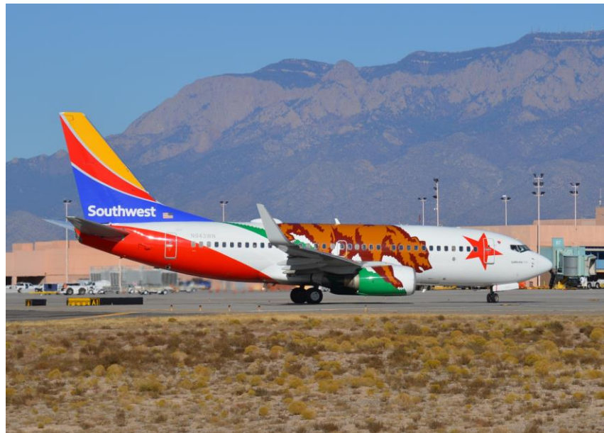
December 8, 2022 - This Southwest Airlines Boeing 737-700, N943WN, “California One,” in the special livery for the former great State of California, is shown departing on runway 08 at the Albuquerque Sunport on November 20, 2020.