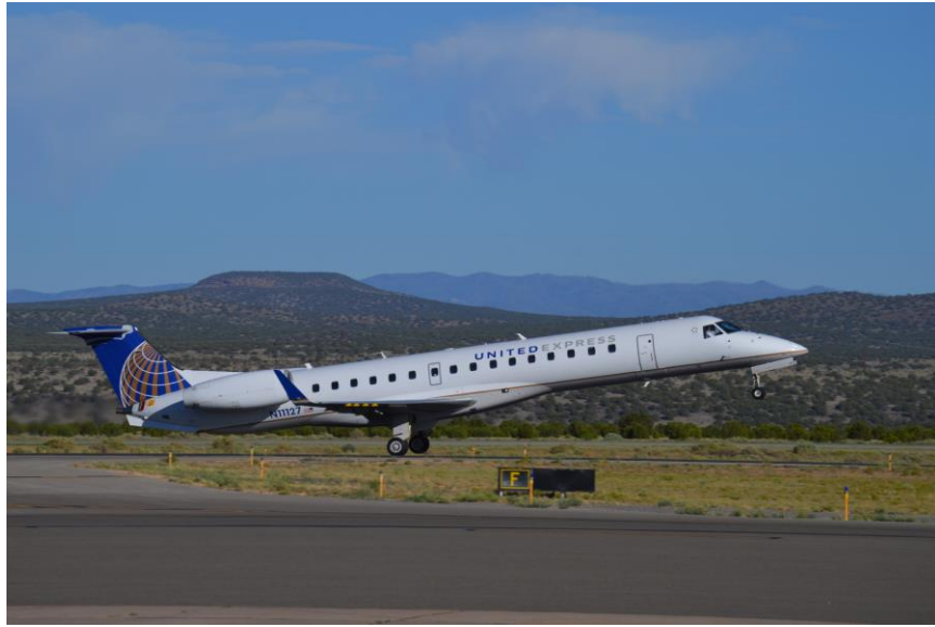
November 12, 2022 - This United Express Embraer 145, N12229, operated by Trans States Airlines, rotates off runway 02 at the Santa Fe County Regional Airport on July 10, 2016.