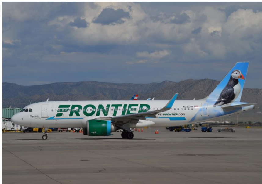
December 5, 2022 - Frontier Airlines Airbus A320neo, N322FR, featuring “Captain” the Puffin, taxis to the gate after arriving at the Albuquerque Sunport on August 22, 2018.