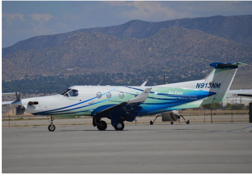
November 27, 2022 - This Pilatus PC-12, N913NM, operated by Air Methods for the San Juan Regional Medical Center in Farmington, New Mexico, is seen arriving at the Albuquerque Sunport on September 19, 2021.