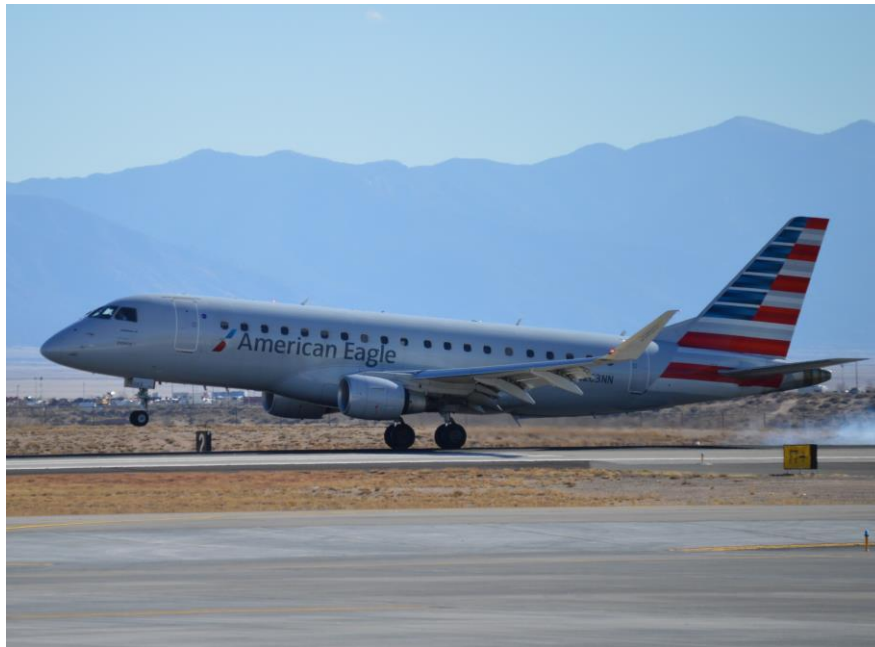
December 9, 2022 - This American Eagle Embraer 175, N263NN, operated by Envoy Air, is seen touching down on runway 03 at the Albuquerque Sunport finishing a flight from Austin, Texas on December 8, 2022.