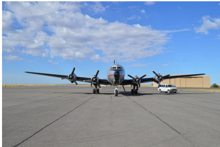
August 22, 2022 - Another photo of the Berlin Airlift Historical Foundation's C-54 on May 24, 2022.