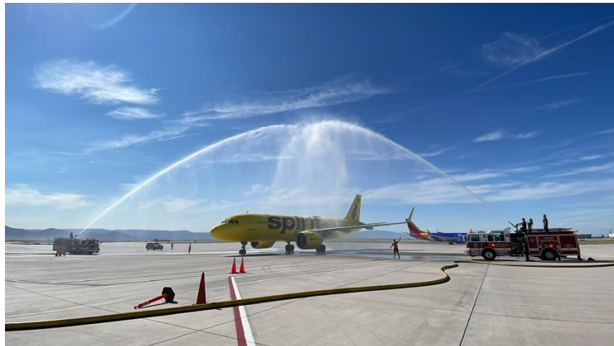
October 10, 2022 - Spirit Airlines Airbus A-320neo received a water cannon salute on the inaugural arrival to the Albuquerque Sunport on August 3, 2022.