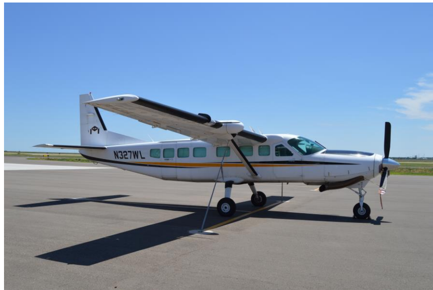
December 12, 2022 - This South Aero Cessna 208 Caravan, N327WL, is parked on the ramp at the Clovis Regional Airport in New Mexico on July 31, 2020.