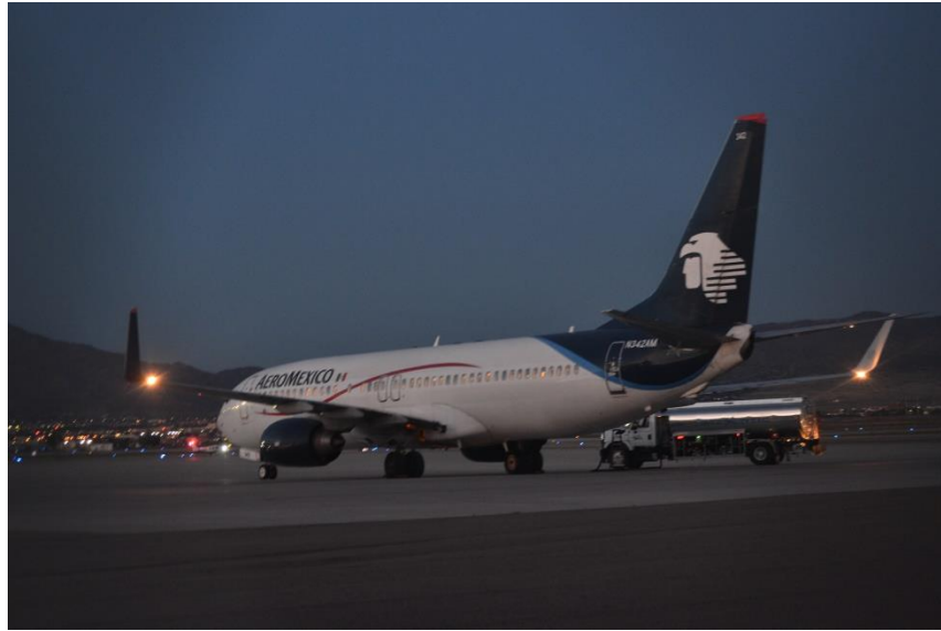
August 22, 2022 - This AeroMexico Boeing 737-800 made an emergency landing at night at the Sunport on July 10, 2022.