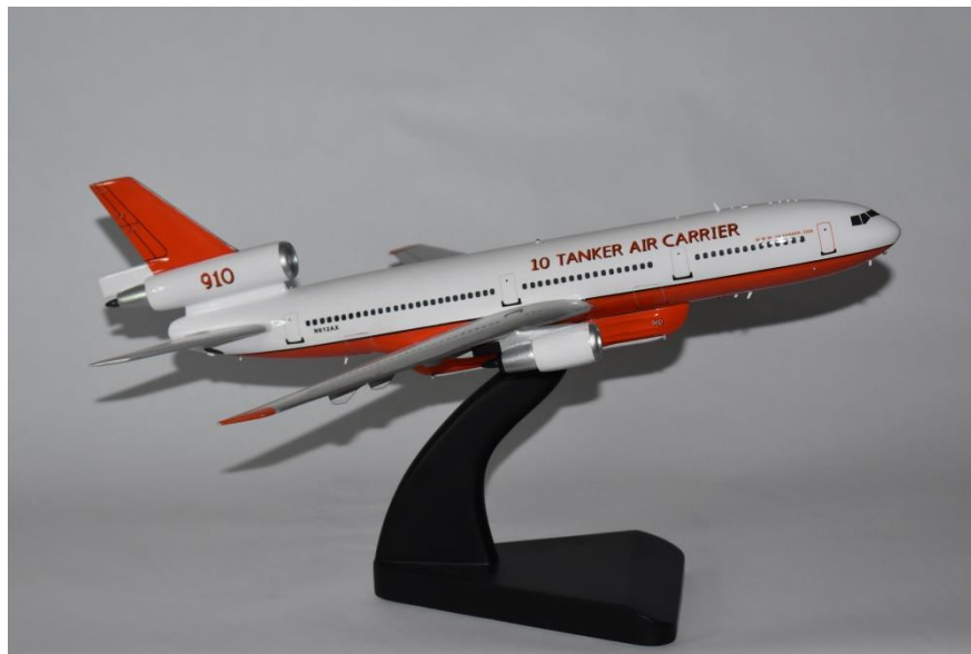
August 22, 2022 - 10 Tanker Air donated this model of their DC-10 to the collection. Headquartered in Albuquerque since 2006, this 10 Tanker Air model is in the original livery.