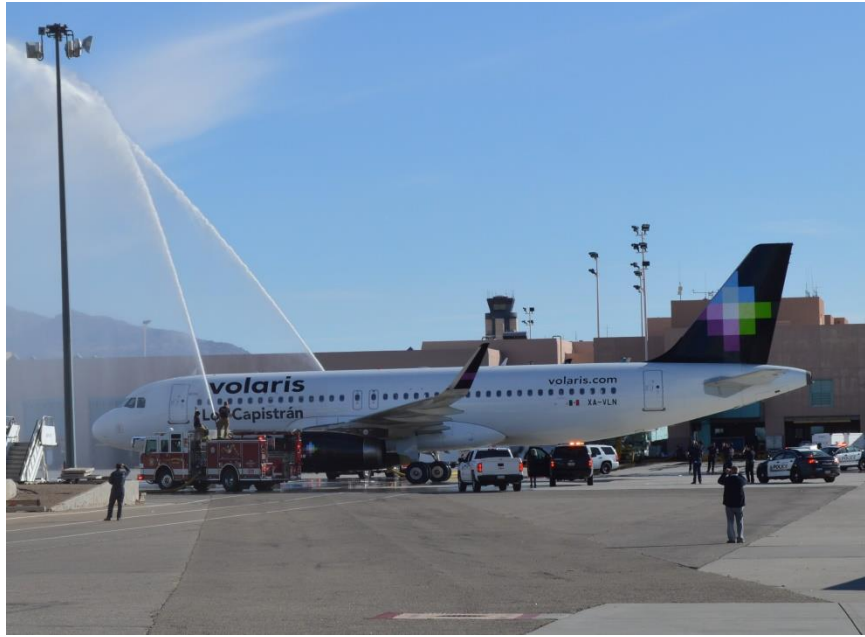
October 11, 2022 - Volaris Airbus A-320 receives a water cannon salute on the inaugural arrival to the Albuquerque Sunport November 17, 2018.