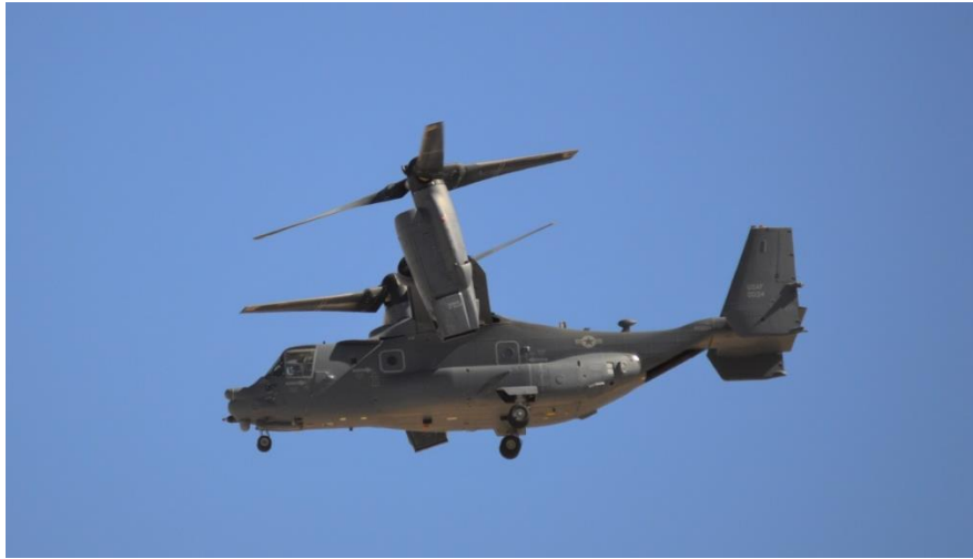
October 10, 2022 - A USAF CV-22 Osprey from the 71st Special Operations Squadron, number 0034, takes off from Kirtland Air Force Base on September 30, 2022.