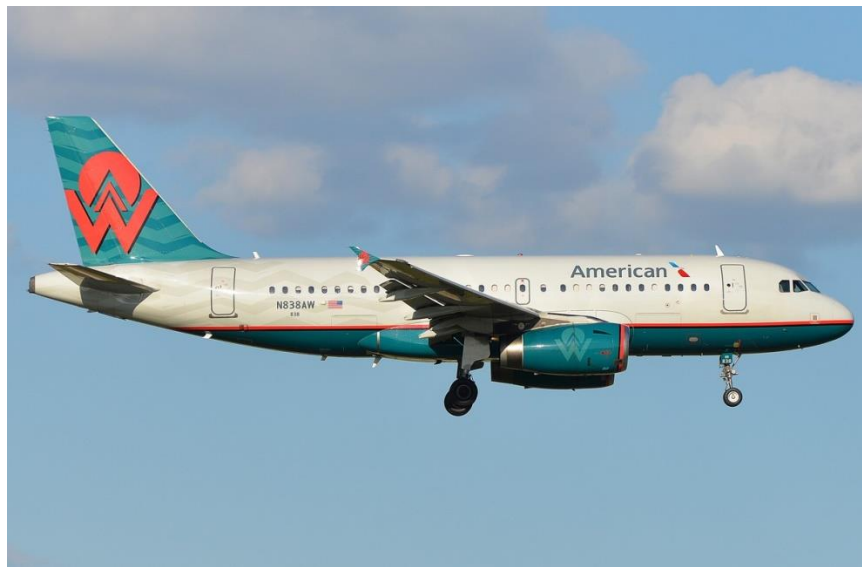
October 10, 2022 - American Airlines Airbus A-319 America West retro N838AW arrives at the Albuquerque Sunport on September 24, 2019