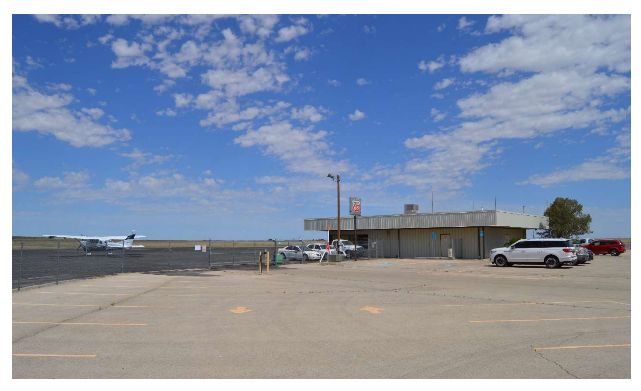
The terminal building at the Artesia Municipal Airport.

The Artesia Municipal Airport is now a general aviation civil airfield with two runways located three miles west of Artesia, New Mexico. It was established in 1943 by the United States Army Air Forces as a contract glider training field to train glider pilot students during World War II. The field was deactivated in the fall of 1944, declared surplus, and turned over to the Army Corps of Engineers. It was later discharged to the War Assets Administration and eventually converted into a civil use airport. The Artesia airport saw commuter airline service by several commuter air carriers from 1963 through 1978. Scheduled flights were provided to Albuquerque, El Paso, Amarillo, Lubbock and Midland/Odessa. A third runway had initially been constructed but was deactivated in the late 1980's.